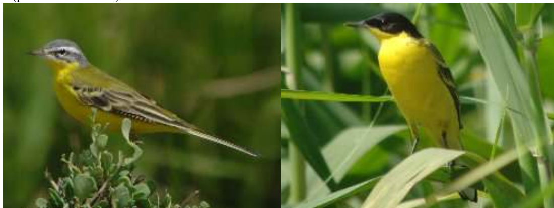
Left: Yellow Wagtail Motacilla flava beema Jahra East 3 rd April 2007

Cormorant 4, Squacco 8+, Western Reef Egret 1, Purple Heron 2, Black-winged Stilt 2, Black-winged Pratincole 28, Collared Pratincole 1, Grey Plover c.10, Ruff 4, Common Sandpiper 4, Slender-billed Gull C, Black-headed Gull c.30, Great Black-headed Gull 1(2cy), Heuglin's Gull 3, Caspian Tern 15+, Little Tern 1, Sand Martin 2, Red-throated Pipit C, Yellow Wagtail 100s, Isabelline Shrike 1(phoenicuroides)