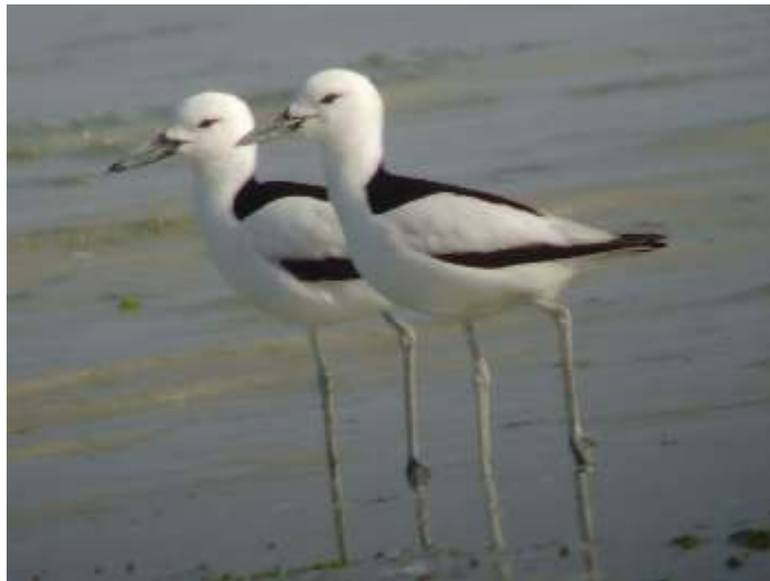
Crab Plover Doha Spit 6 th April 2007

We only saw this species at Doha Spit as we did not have the chance to visit Bubiyan Island where spectacular numbers breed. Records from Doha Spit included 3 on 3 rd April, 1 on 5 th April and 6 on 6 th April.