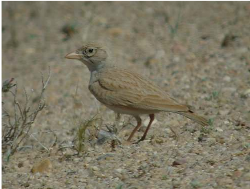
Dunn's Lark Sabah-al-Ahmad 7 th April 2007