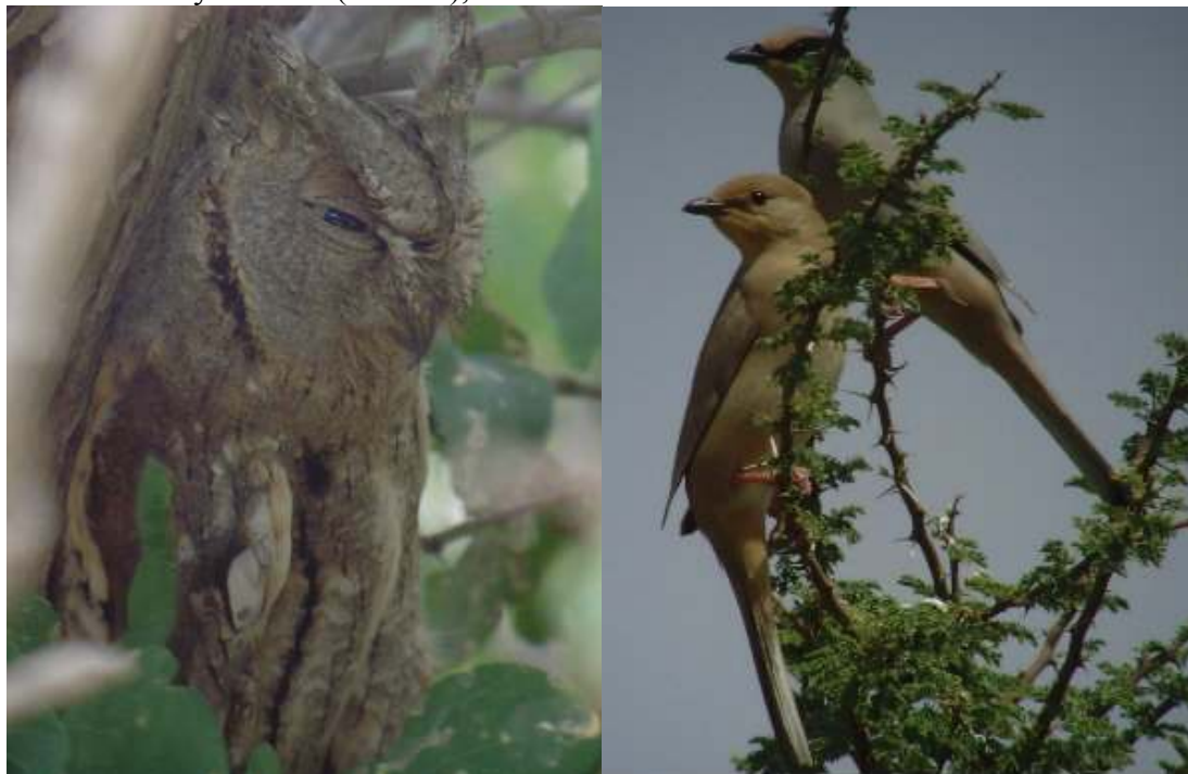
Left: Scops Owl Tulha 4 th April 2007

Dunn's Lark 6, Hoopoe Lark 3, Bar-tailed Lark 1, Short-toed Lark c.15, Crested Lark C, Swallow C, Tawny Pipit c.5, Yellow Wagtail 2, Northern Wheatear 1, Southern Grey Shrike 1(aucheri), Woodchat 1