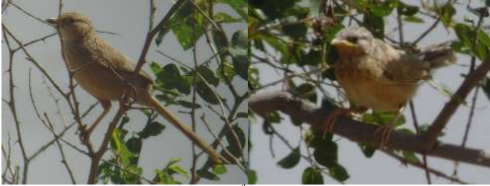
Left: adult Common Babbler Abdaly Farms 5 th April 2007