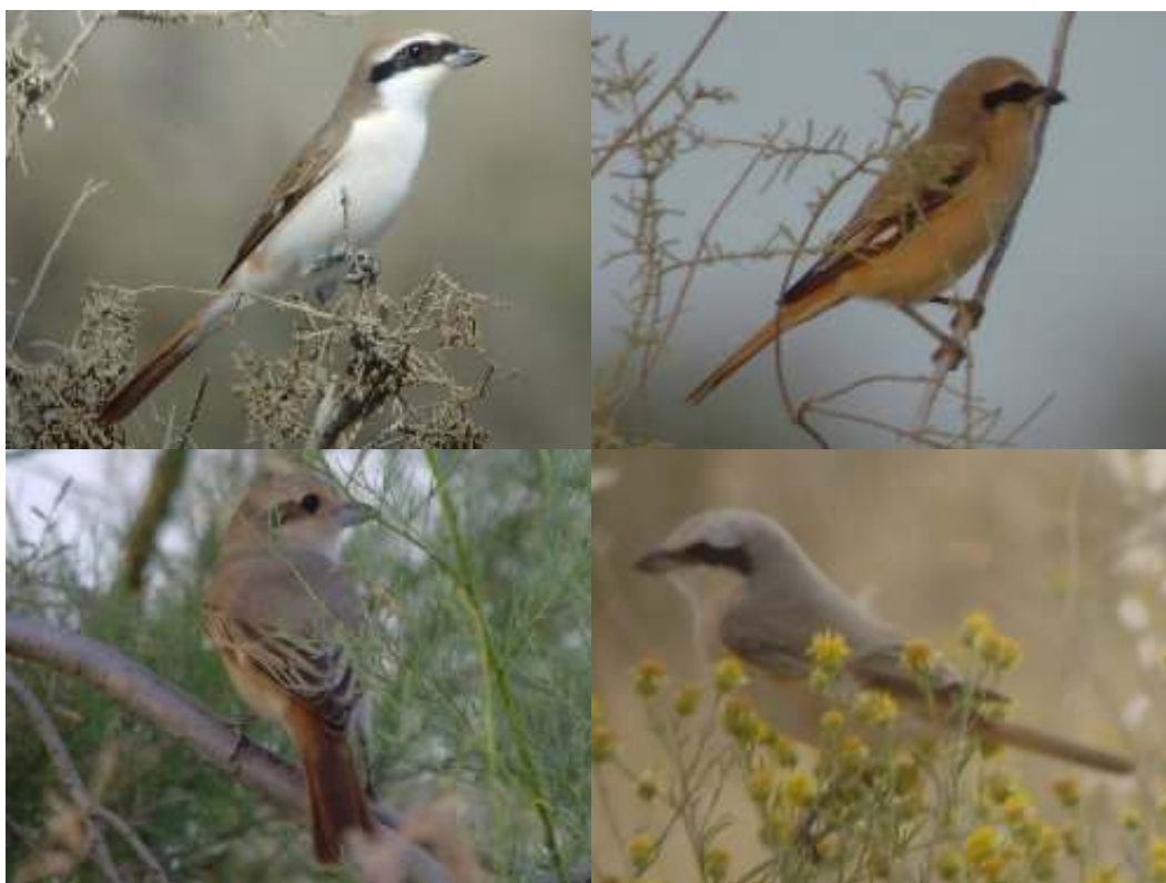
Above left: male phoenicuroides (Turkestan Shrike) Zour Port 6 th April 2007 Above right: male isabellinus (Daurian Shrike) Sulaibhikat 5 th April 2007 Below left: female isabellinus (Daurian Shrike) Sulaibhikat 5 th April 2007 Below right: male isabellinus (Daurian Shrike) Kabd 8 th April 2007