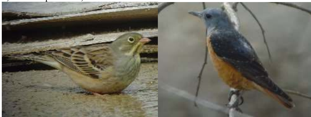
Left: Ortolan Sulaibhikat 3 rd April 2007

Grey Heron 10+, Greater Flamingo 400+, Kentish Plover 10+, Little Stint c.80, Slender-billed Gull c.200, Little Tern 1, Namaqua Dove 4, Hoopoe 1, Bee-eater 7, Swallow 10, Crested Lark C, White Wagtail 1, Red-throated Pipit 3, Redstart 1, Bluethroat 1, Rufous-tailed Scrub Robin 1, Eastern Black-eared Wheatear 1, Rock Thrush 1 (male), Stonechat 2, Grey Hypocolius 1(female), White-cheeked Bulbul C, Graceful Prinia 12, Lesser Whitethroat 2, Long-tailed Shrike 1, Common Myna 5, House Sparrow C, Ortolan 1