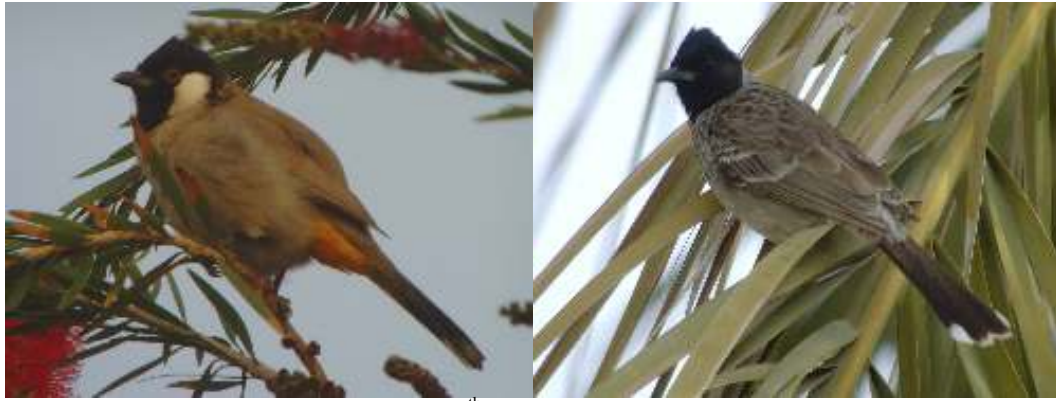
Left: White-cheeked Bulbul Green Island 4 th April 2007