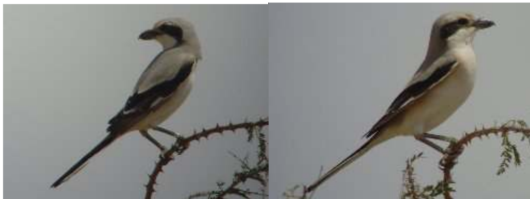
Steppe Grey Shrike Lanius meridionalis pallidirostris Tulha 7 th April 2007

Individuals of the race pallidirostris (Steppe Grey Shrike) noted at Zour Port/Pipeline Beach 6 th April, Tulha 7 th April and Sabah Al-Ahmad 8 th April. A bird of the race aucheri was noted at Sabah Al-Ahmad 7 th April.