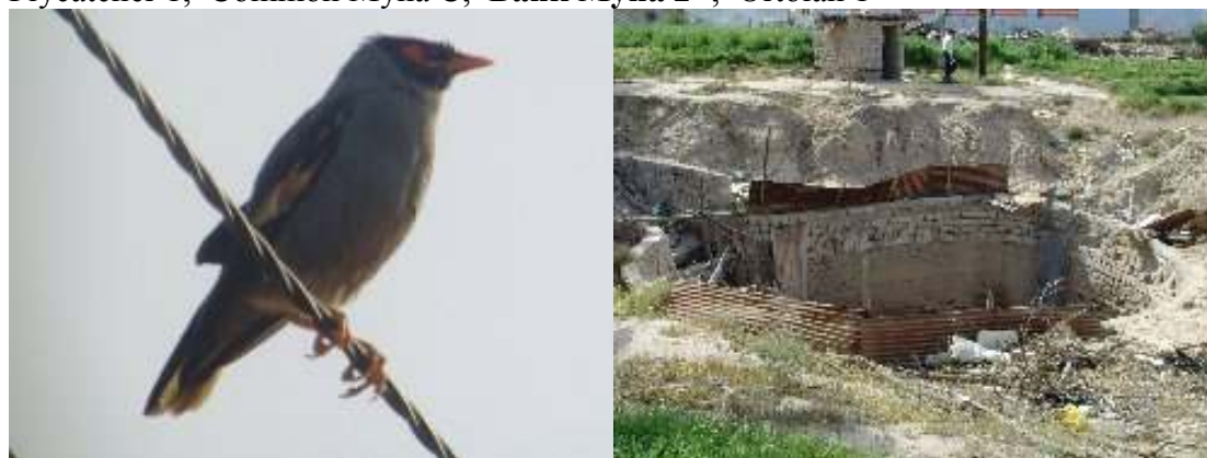
Left: Bank Myna Jahra Farms 7 th April 2007

Eastern Imperial Eagle 1(2cy), Laughing Dove C, White-throated Kingfisher 1, Cuckoo 2, Tree Pipit 3, Redstart 2, Nightingale 1, Chiffchaff C, Semi-collared Flycatcher 1, Common Myna C, Bank Myna 2+, Ortolan 1