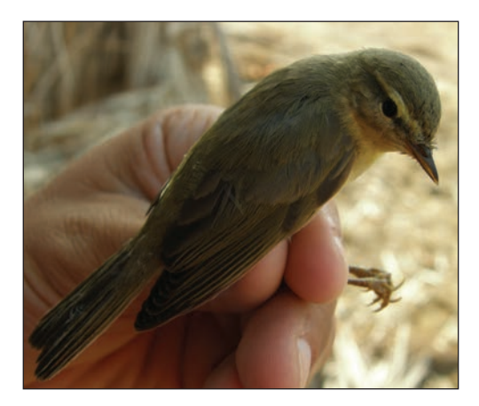
Plate 4. Willow Warbler Phylloscopus trochilus trapped at El Marun lake, September 2010, Bahariya oasis, Egypt.

Birds with lower fat scores included, all at El Marun: Eurasian Reed Warblers Acrocephalus scirpaceus (1.7, 6), Rufous-tailed Scrub Robins (1.6, 19) and Spanish Sparrows (1.2, 23).