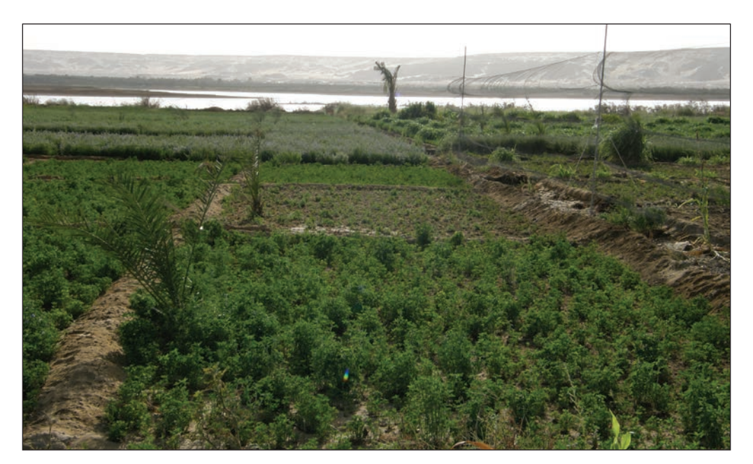
Plate 2. El Marun lake, alfalfa in foreground with mist-nets, lake and a more mature date palm, September 2010, Bahariya oasis, Egypt.

to a scale from 0 to 8 (Busse 2000), wing formula and wing and tail measurements were recorded, and weight. Selected birds were tested for directional preferences in a Busse orientation cage (Busse 1995; for results see Stepniewski et al 2011). Vantage point counts and casual bird observations were conducted each day for 30 minutes at strategic points around each lake, mainly to record water birds.