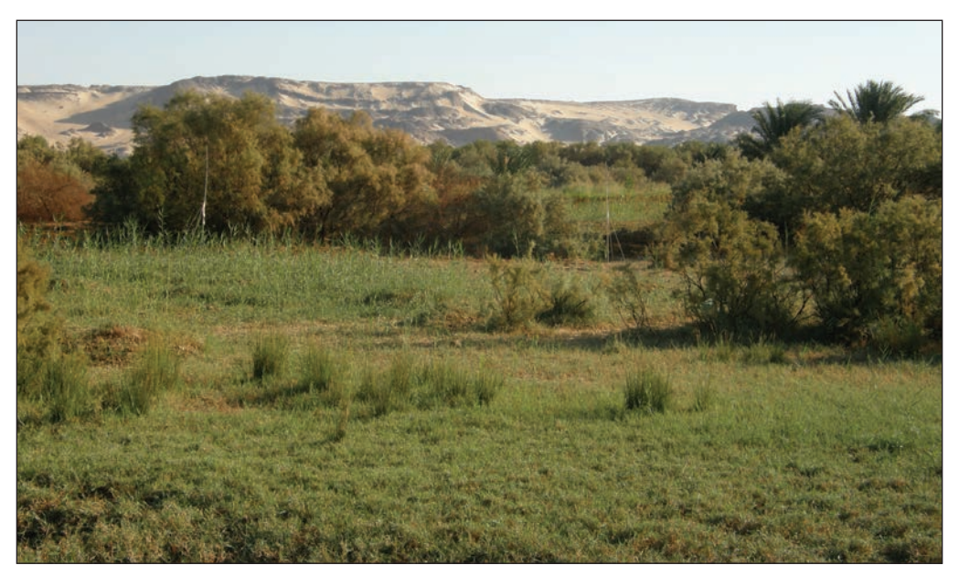
Plate 7. Nets next to tamarisk (mid distance) at El Marun lake, northern desert escarpment in background, September 2010, Bahariya oasis, Egypt.

in Bahariya may have accumulated fat loads in the Nile delta or maybe even in Europe and probably used the oasis mainly as a place to rest without refueling. The reedbeds in Bahariya are poorly developed and maybe cannot supply the birds with the amounts of aphids needed for restoring the fat load.