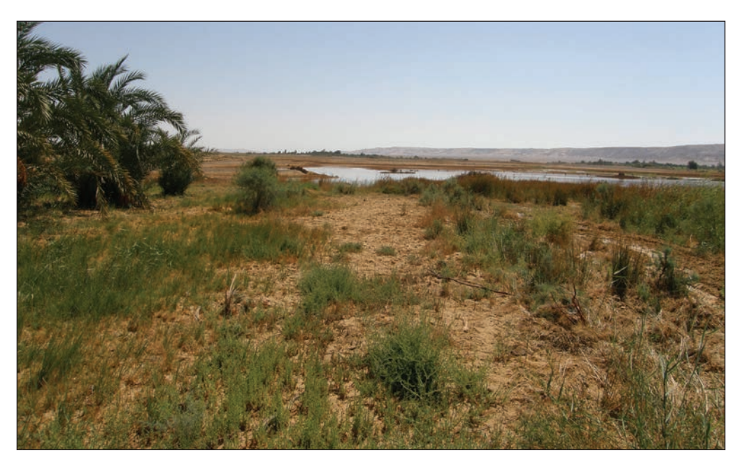
Plate I. Abu Yasser lake habitats, foreground grass and date palms, lake in background, August 2010, Bahariya oasis, Egypt.

Hunting is practised and several local bedouin people were observed shooting at ducks on the lake. At Abu Yasser 7 \times 12 m and 3 \times 7 m (105 m) of mist-nets with 4 pockets were erected in a variety of different habitats near the lake: grass pasture, alfalfa, rushes, reeds and tamarisk/scrub.