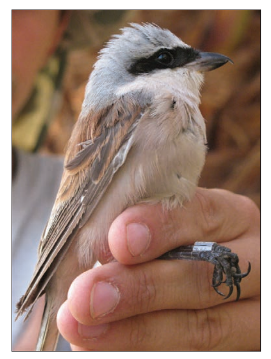
Plate 3. Red-backed Shrike Lanius collurio trapped beside tamarisk bushes at Abu Yasser lake, August 2010, Bahariya oasis, Egypt.

The majority of migratory passerines had quite large amounts of fat (fat scores >3, Table 2). These included Willow Warblers (mean 3.6, 29 birds) from both ringing sites and Yellow Wagtails (3.7, 21) at El Marun.