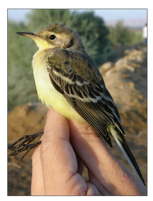
Plate 5. Yellow Wagtail Motacilla flava juvenile trapped in alfalfa crops at El Marun lake, September 2010, Bahariya oasis, Egypt.

in insect-rich alfalfa crops which were very patchy in distribution (average height 35.8 mm). All (100%) Eurasian Reed Warblers (6) and Lesser Whitethroats (6, Plate 6) were recorded in tamarisk habitats including 78.9% (15) of the Rufous-tailed Scrub Robins. Several other species were trapped alongside apricot fruit trees including a single Garden Warbler Sylvia borin, Thrush Nightingale Luscinia luscinia, Whinchat Saxicola rubetra and Spotted Flycatcher and two Collared Flycatchers Ficedula albicollis.