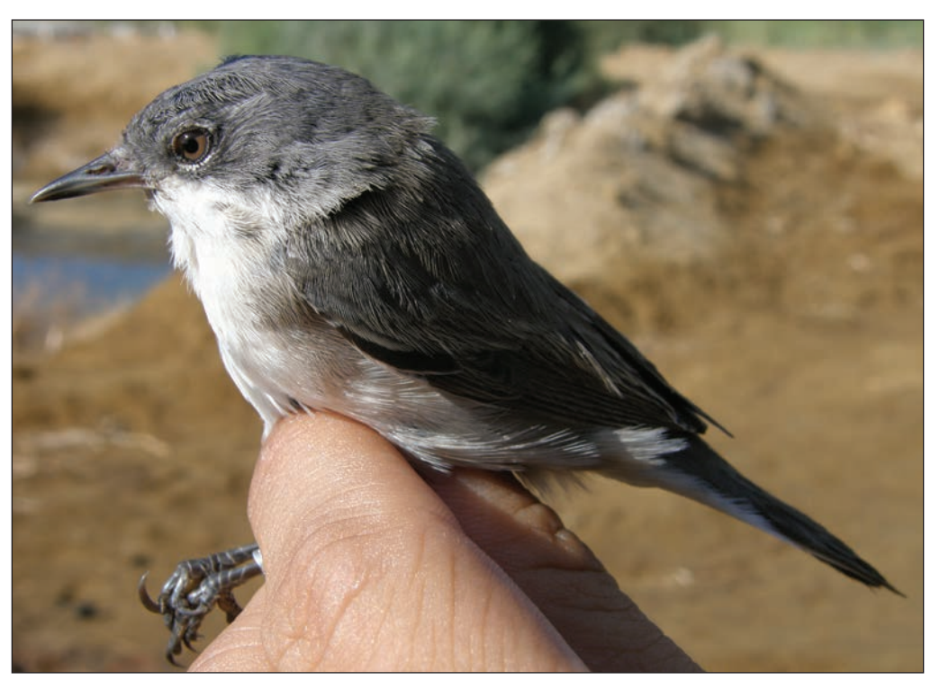
Plate 6. Lesser Whitethroat Sylvia curruca trapped beside tamarisk bushes at El Marun lake, September 2010, Bahariya oasis, Egypt.

This study confirms that Bahariya oasis is a stopover area for migratory birds. Passerine migrants were recorded actively foraging in a variety of habitats such as tamarisk bushes, alfalfa crops, reeds, fruit trees; with body mass and fat loads well above breeding levels. Willow Warbler and Yellow Wagtail were the two species trapped most frequently, mirroring a study conducted in autumn 1982/1983 (Biebach et al 1986), at the