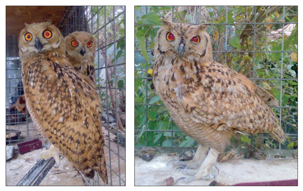
Plate 3. (left) Two full-sized but young Pharaoh Eagle Owls Bubo ascalaphus, 10 June 2011, animal market, Ramadi, Anbar province, Iraq. © Omar Fadhil Al-Sheikhly

Plate 4. (right) Pharaoh Eagle Owl Bubo ascalaphus, 10 June 2011, animal market, Ramadi, Anbar province, Iraq. © Omar Fadhil Al-Sheikhly