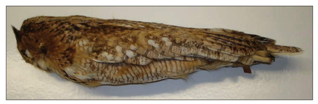
Plate 5. Pharaoh Eagle Owl Bubo ascalaphus skin at the Field Museum, Chicago. Specimen collected November 1937 at Al-Hadithah on the Euphrates in western Iraq by R Clawson.

Plate 4. (right) Pharaoh Eagle Owl Bubo ascalaphus, 10 June 2011, animal market, Ramadi, Anbar province, Iraq.