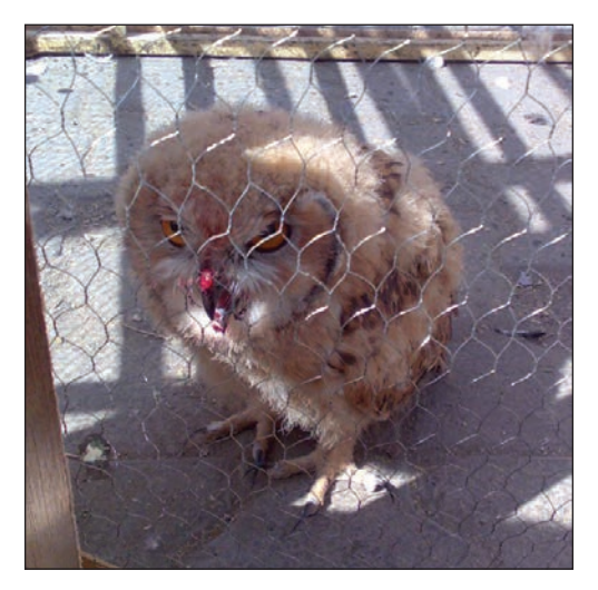
Plate I. Pharaoh Eagle Owl Bubo ascalaphus c40 days old, 15 May 2009, animal market, Ramadi, Anbar province, Iraq.

Enquiries revealed that the owlet was one of two chicks (the other had died) that had been collected by a hunter from a nest at Wadi Al Ubayiadh (33° 04' 34.38" N, 42° 48' 53.47" E, Figure 1, Plate 2), an arid area of rocky hills between Al Rahaliya and Nekheab districts in Anbar province. The hunter indicated to me where to locate the nest site. The nest was in a hole in a cliff of moderate elevation, fecal droppings indicating where the adults had been roosting. I later observed the adults: they had a pale, rusty plumage with the lower breast and belly distinctly barred; the darklined facial disc surrounded orange eyes. The following year, on 10 June 2011, two