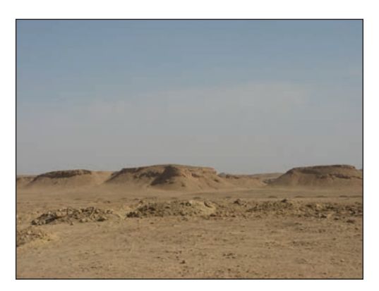
Plate 2. Wadi Al Ubayiadh, between Al Rahaliya and Nekheab districts, Anbar province, Iraq.