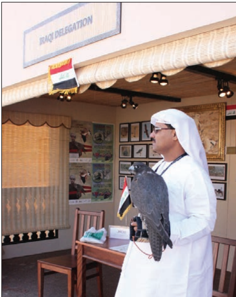
Plate 4. "Yes, falconry is carried out in Iraq but in balance with nature, conservation and protection."