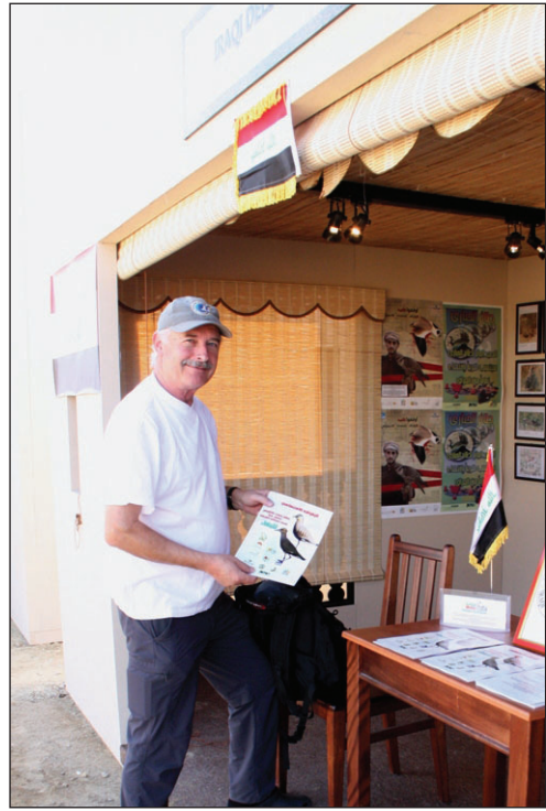
Plate 3. Iraq stand: International Falconry Association member with Sociable Lapwing Vanellus gregarius leaflet.