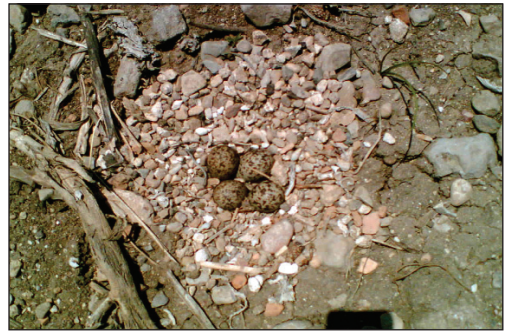
Plate 1. Nest of Spur-winged Lapwing Vanellus spinosus at Ras el Ain in the Tyre Coast nature reserve, May 2006.