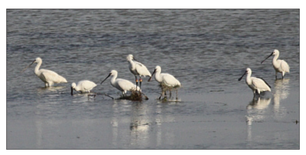
Plate 9. Eurasian Spoonbills Platalea leucorodia, 21 May 2009, Al Dhakira, Qatar. The colour-ringed bird (middle) was ringed as a nestling on 18 May 2008 at Bolluk lake, near Konya, Turkey.

A Great Knot Calidris tenuirostris at Ras Al Allaq on the southeast coast on 10 Dec 2008 is the 1st record for Qatar. Seven non-breeding Eurasian Spoonbills Platalea leucorodia were at Al Dhakira, Qatar, on 21 May (Plate 9); one colour-ringed on both legs had been ringed as