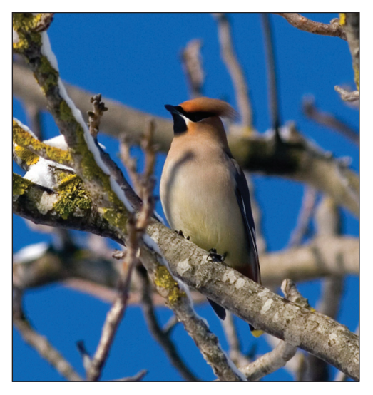
Plate 18. Bohemian Waxwing Bombycilla garrulus, 3 Mar 2009, Asarcık, Turkey.

on 9 May. There was a single Red-throated Diver Gavia stellata at Filyos on 6 and 9 Mar, two at Sinop on 27 Feb and one at Samsun on 13 Jan. The 2nd Turkish record of Lesser Flamingo Phoenicopterus minor was one in the Gediz delta, İzmir, on 30 Jan. Thirteen Western White Storks Ciconia ciconia in the Kavak delta, Canakkale, on 13 Jan was an unusual winter record. Raptors of note during the period included four White-tailed Eagles Haliaeetus albicilla at Yedikır dam, Amasya, on 8 Feb and one at Sariyer, İstanbul, on 30 Apr; a Cinereous Vulture Aegypius monachus in the Kızılırmak delta on 18 Apr, the first record for the site; single Greater Spotted Eagles Aquila clanga in the Kavak delta on 6 Jan, at Beykoz,