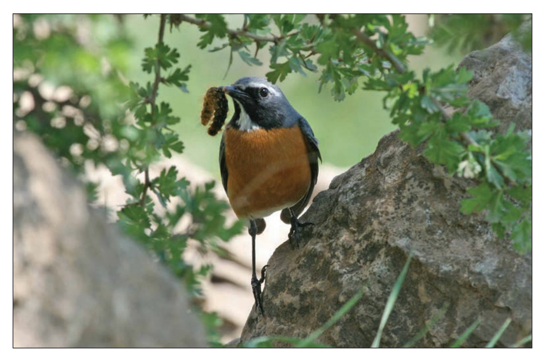
Plate 5. White-throated Robin Irania gutturalis, April 2009, NE Kurdistan hills, Iraq.