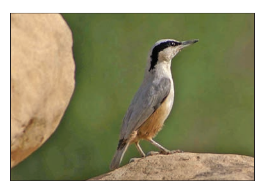
Plate 3. Eastern Rock Nuthatch Sitta tephronota, April 2009, NE Kurdistan hills, Iraq.