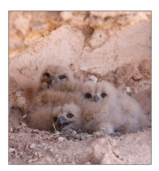
Plate 10. Pharaoh Eagle-Owl Bubo ascalaphus desertorum nestlings, 27 Feb 2009, Qatar.

a nestling on 18 May 2008 at Bolluk lake, near Konya, Turkey, 2240 km away. There were two confirmed breeding records of Pharaoh Eagle-Owl Bubo ascalaphus in Qatar in late February; one pair raised one young, the other at least two (Plate 10). A pair of Yellow-throated Sparrows Gymnoris xanthocollis was at Mazra'at Traina, Jeryan Al Batna, 17–18 Apr, with three male Black-headed Buntings Emberiza melanocephala on 18 Apr.