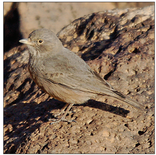
Plate 16. The dark form annae of Desert Lark Ammomanes deserti, 27 Feb 2009, basalt desert east of lebel Druze, Syria.

Visitors to Syria should be able to find Citrine Wagtail at any time of year. Likewise, several groups recorded Cyprus Wheatear Oenanthe cypriaca, which is clearly a widespread spring migrant. Seven species of wheatear were seen in Jebel Abdul Aziz between 24 and 29 Mar, including four Rufous-tailed Wheatears Oenanthe (xanthoprymna) xanthoprymna, a form rarely recorded from Syria which is probably an early spring migrant to the north-east; one was also seen at Aumair on 12 Mar. Better still, on 27 Feb, the basalt desert east of Jebel Druze turned up several Basalt (Mourning) Wheatears Oenanthe lugens (Plates 13 & 14) and a male White-crowned Black Wheatear Oenanthe leucopyga (Plate 15), the first welldocumented record for Syria, as well as the dark form annae of Desert Lark Ammomanes deserti (Plate 16), described by Richard Meinertzhagen, who named it after his granddaughter. There is surely much more to find in the Syrian drylands. Better coverage of the desert oases turned up some nice warblers, for instance two records of Rüppell's Warbler Sylvia rueppelli, several records of Eastern Orphean Warbler Sylvia (hortensis) crassirostris and Ménétries's Warbler Sylvia mystacea and two Eastern Bonelli's Warblers Phylloscopus orientalis; the last is the scarcest and all records are welcome (accompanied by descriptions please). Syrian Serins Serinus syriacus were seen at the usual site at Bloudan but also