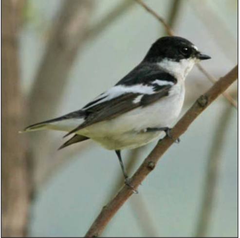
Plates 7 & 8. Female and male Semi-collared Flycatchers Ficedula semitorquata , April 2009, NE Kurdistan hills, Iraq.

on territory in oak and willow woodlands belts (Plates 7 & 8).