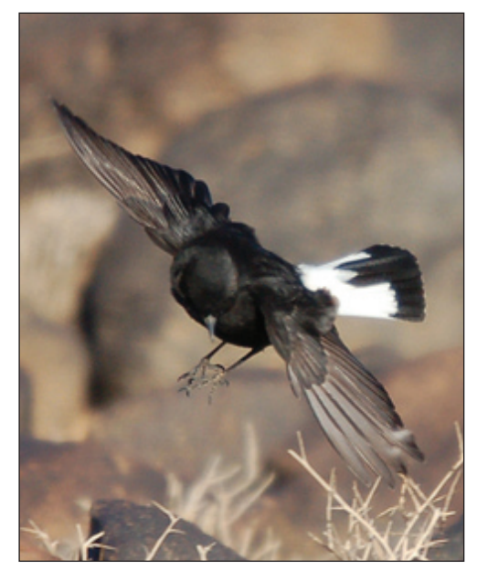
Plates 13 & 14. Basalt Wheatear Oenanthe lugens, 27 Feb 2009, basalt desert east of Jebel Druze, Syria.

on 27 Feb, five on 24 Feb and four 11-13 Mar in the Jazira, five at Ar Ruweira on 10 Mar and 59 near Deir ez-Zor between 14 and 17 Mar. A Caspian Plover Charadrius asiaticus at lake Khatuniyeh on 13 Mar was perhaps the 2nd Syrian record. Both are steppe species probably very under-recorded in Syria. The rarest wader this year was a Ruddy Turnstone Arenaria interpres at Sabkhat al-Jabbul on 7 Mar, only the 2nd Syrian record (the 1st being in August 2008). Other interesting waders included a pair of Red-wattled Lapwings Vanellus indicus at lake Khatuniyeh on 11 Mar (the species may well breed in the area); four Bar-tailed Godwits Limosa lapponica and two Black-winged Pratincoles Glareola nordmanni near Deir ez-Zor on 10 Apr; and a Terek Sandpiper Xenus cinerea at Mheimideh on 18 Apr. Flocks of up to 16 Red-necked Phalaropes Phalaropus lobatus were counted with observations from Mheimideh on 12 and 15 Mar and 6 and 11 Apr, and at Sed Wadi Abied on 5 Apr; this is a regular if uncommon migrant. Nine Black-legged Kittiwakes Rissa tridactyla were seen off Ugarit, north of Lattakia, on 10 Feb, apparently part of an influx into the eastern Mediterranean (see the entry for Lebanon). There were only two records of Sandgrouse,