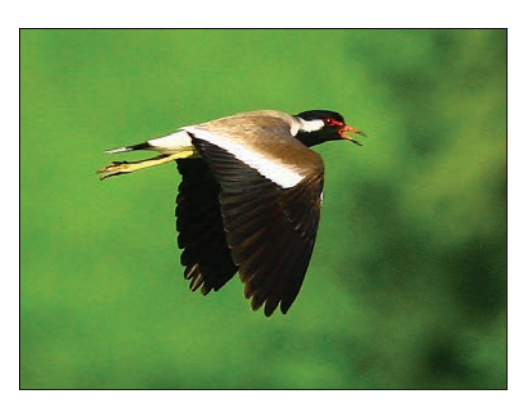
Plate 17. Red-wattled Lapwing Vanellus indicus, 26 Apr 2009, Batman, Turkey.