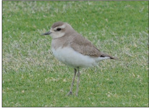
Plates I & 2. Second Caspian Plover Charadrius asiaticus for Egypt, 9–13 May 2009, El Gouna golf course.