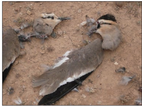
Plates II & I2. Remains of Sociable Lapwings Vanellus gregarius, I3 March 2009, northern Syrian steppes.

A breeding record of Macqueen's Bustard ('Eastern Houbara') Chlamydotis macqueenii in the south-east in March was widely publicised: the last time a Houbara was seen in Syria it was soon shot. Searches for Sociable Lapwings Vanellus gregarius revealed what we have long feared; hunters shoot large numbers of this species when the birds pass through the northern steppes in early spring. Piles of heads and wings were photographed on 13 Mar from a site north-west of Deir ez-Zor (Plates 11 & 12); hunters reported six hundred birds there the previous day. There were several other sightings in the northern steppes, fortunately of live birds. These key observations may at last explain why this species has declined so rapidly and is now Critically Endangered; surely it is essential to provide better protection to prevent these unacceptable losses. Improved coverage of the northern steppes also turned up valuable observations of Eurasian Dotterels Charadrius morinellus: over 50 in the basalt desert east of Suwaida