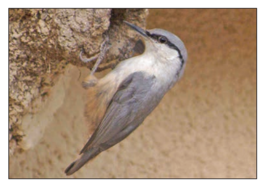
Plate 4. Western Rock Nuthatch Sitta neumayer, April 2009, NE Kurdistan hills, Iraq.