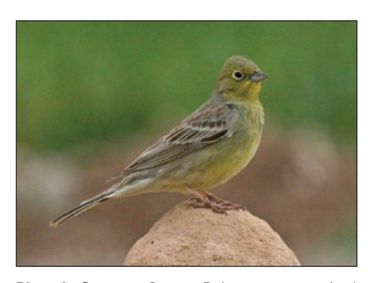
Plate 6. Cinereous Bunting Emberiza cineracea , April 2009, NE Kurdistan hills, Iraq.

Tit Poecile lugubris (20 pairs), Long-tailed Tit Aegithalos caudatus (2 pairs), Eastern Rock Nuthatch Sitta tephronota (22 pairs, Plate 3), Western Rock Nuthatch Sitta neumayer (4 pairs, Plate 4), Eurasian Nuthatch Sitta europaea (4 pairs), White-throated Robin Irania gutturalis (11 pairs, Plate 5), Rufous-tailed Wheatear Oenanthe xanthoprymna (2 pairs), Finsch's Wheatear Oenanthe finschii (16 pairs), Corn Bunting Emberiza calandra (23 pairs) and Cinereous Bunting Emberiza cineracea (4 pairs and flock of 12, Plate 6). A total of ten pairs of Semi-collared Flycatchers Ficedula semitorquata were counted and appeared to be