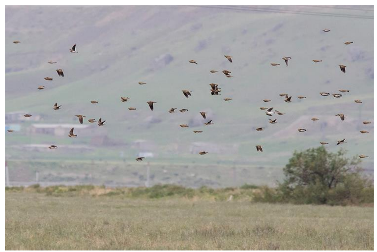
Thousands of migrating Calandra Larks over the steppe at Besh Barmag. An incredible experience!