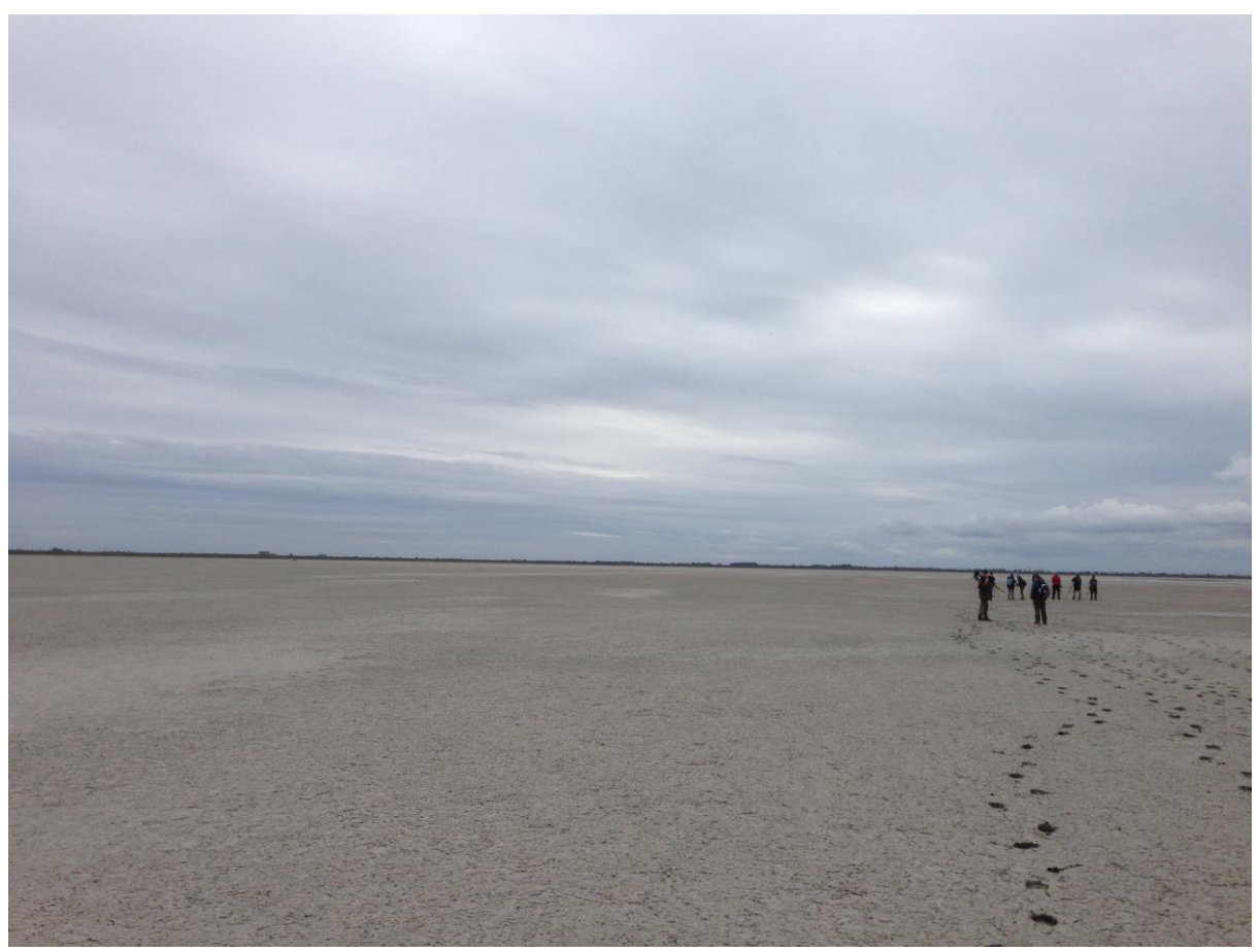
The Haji Gaboul lake was d-r-y this time.