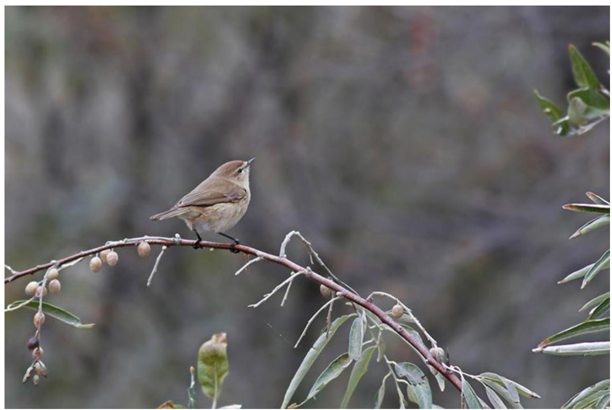
Mountain Chiffchaff in the bushes at Besh barmag.

Fairly common and quite numerous in the coastal bushland, Besh Barmag 26-28/10. Most looked like abietinus/collybita but with a straight, weak call like tristis . These should have been Caucasus breeders according to the Collins guide/Lars Svensson. Two pale candidates for tristis were also found.