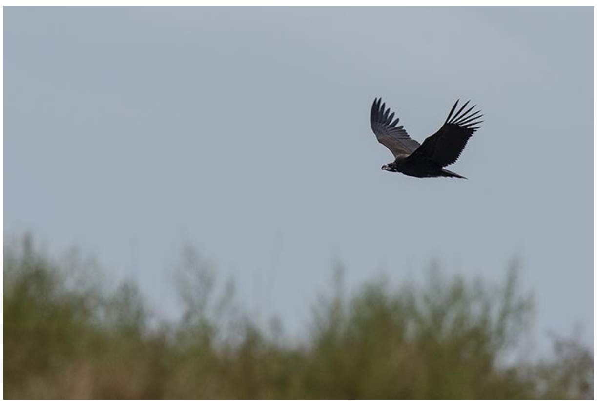
Cinereous Vulture at Besh Barmag.

A total of 213 migrating at Besh Barmag 26-28/10 and 15 at the "flamingo lake" Shirvan NP 29/10.