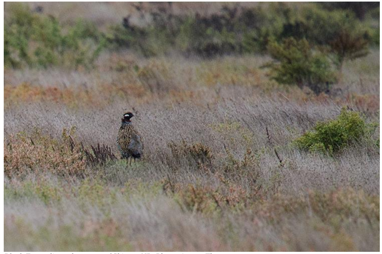
Black Francolin at the steppe of Shirvan NP.