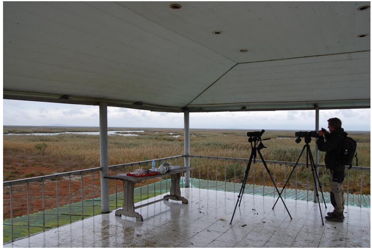
The viewing platform at the lake in Shirvan – great sceneries and rich in species. And yes, tea will be served.

Be sure to arrange your entrance tickets before arrival (Caspian Tour can do this) and check in at the rangers office at the entrance. You might be asked if you need a "guide" which comes with a 10 AZN charge but not really needed for only going to the lake and back. The manager, mr Hikmet, is usually around and can also shuttle people (some tipping expected) the last bit to the lake house, this last section of dirt road can be too tough for buses or minivans. At the lake house the family usually offers tea to visitors, don't forget the tip.