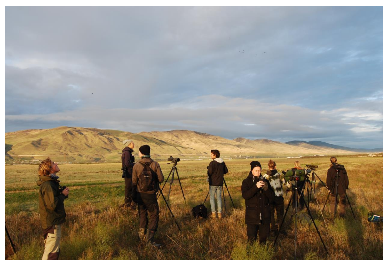
Just 90 minutes from Baku airport finds you on spot at Besh Barmag.

The price level is still fair from a Western perspective and we could keep this tour at a v-e-r-y cheap level, using simple accommodation, no guide needed and buying food along the way. Return tickets with Turkish Airlines from Scandinavia to Baku at just over 300 euro, we booked this individually online. 3-4 hours transit in Istanbul. A visa is needed and some paper work in connection with that, Caspian Tour took care of this as well. We collected all documents and sent it via email to them.