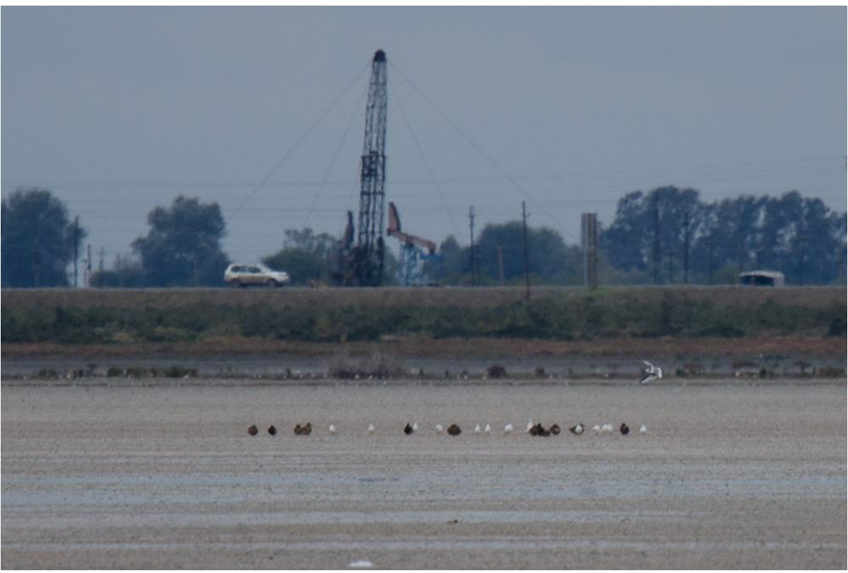
Distant Black-legged Kittiwake (in flight, on the right) at Haji Gaboul.

A total of 70 migrating at Besh Barmag 26-28/10 but some might have been local movements.