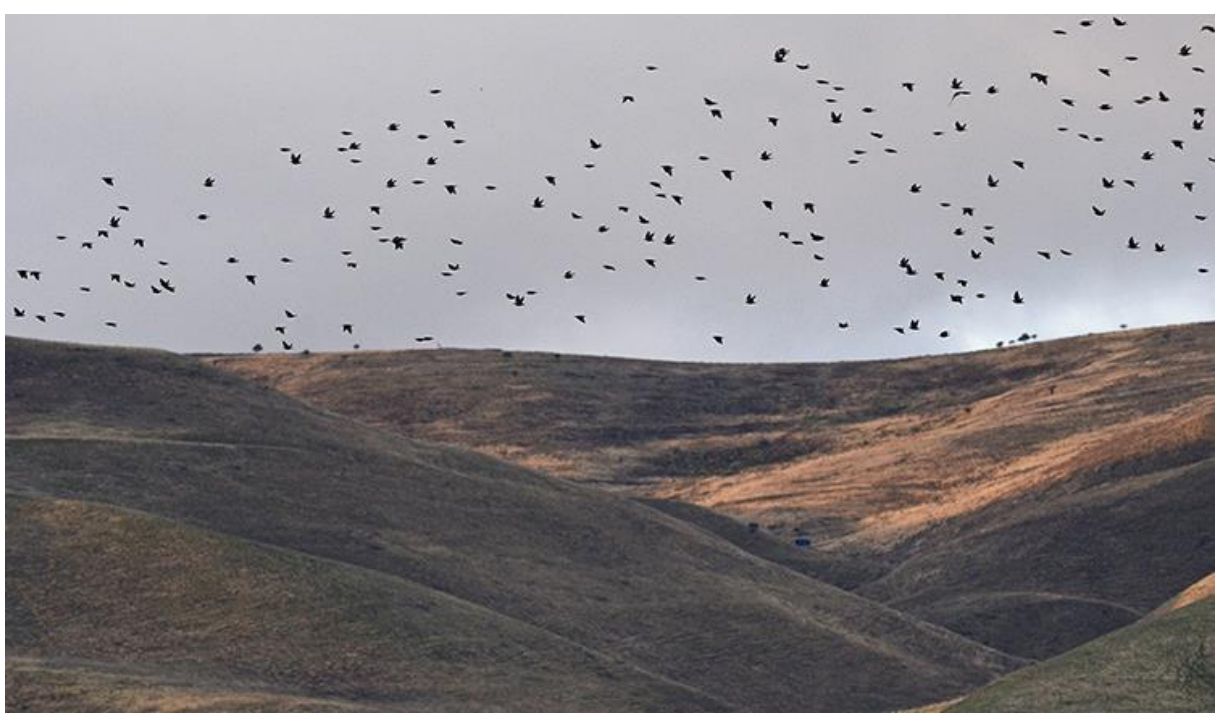
Starlings migrating at Besh Barmag.

A total of 1.237 migrating at Besh Barmag 26-28/10 and common in the bushland. Also common in Shirvan NP 29/10.