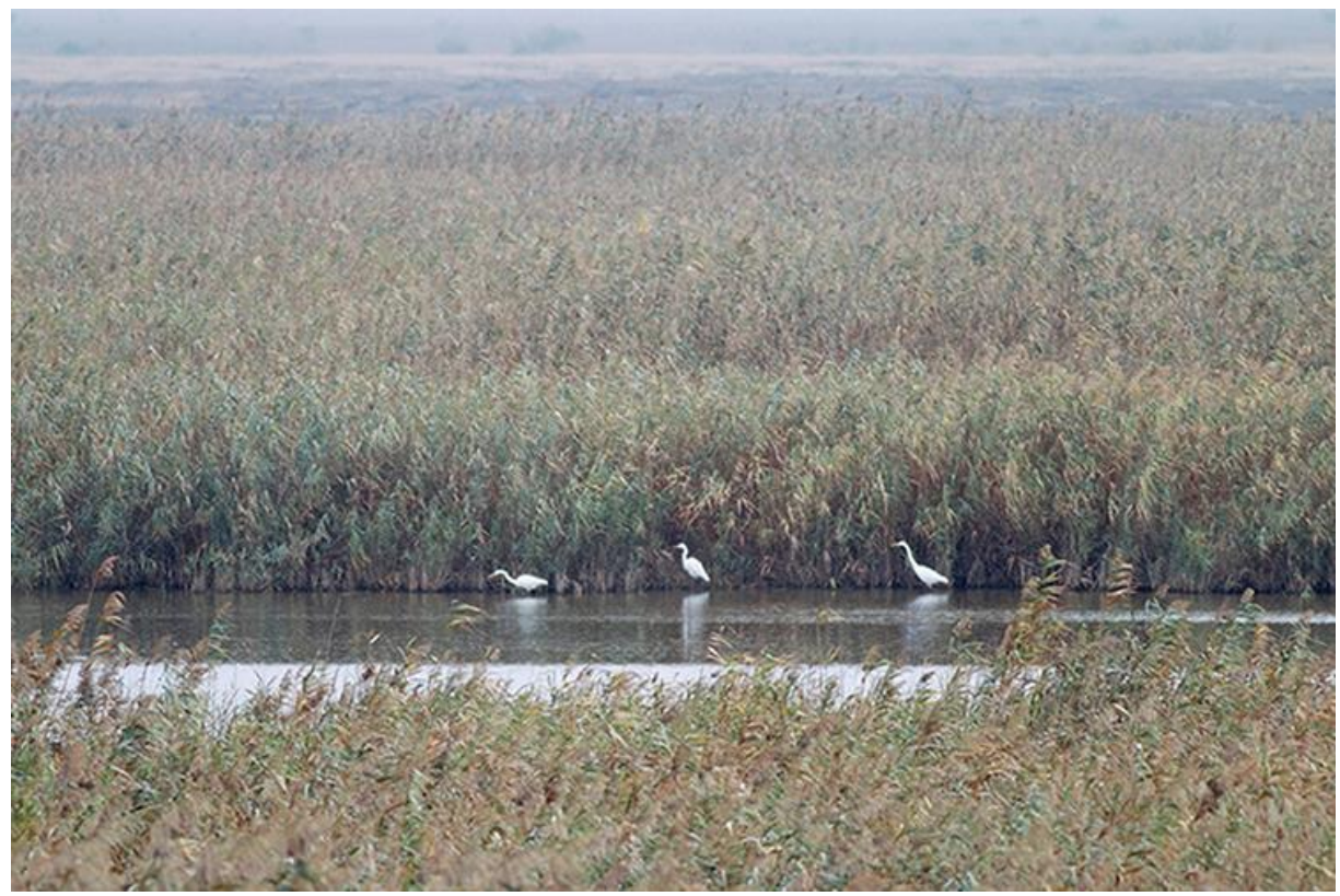
Great Egrets in the "flamingo lake", Shirvan NP.

A total of 104 migrating at Besh Barmag, often mixed with Great Egrets, 26-28/10 and 15 at the "flamingo lake" Shirvan NP 29/10.