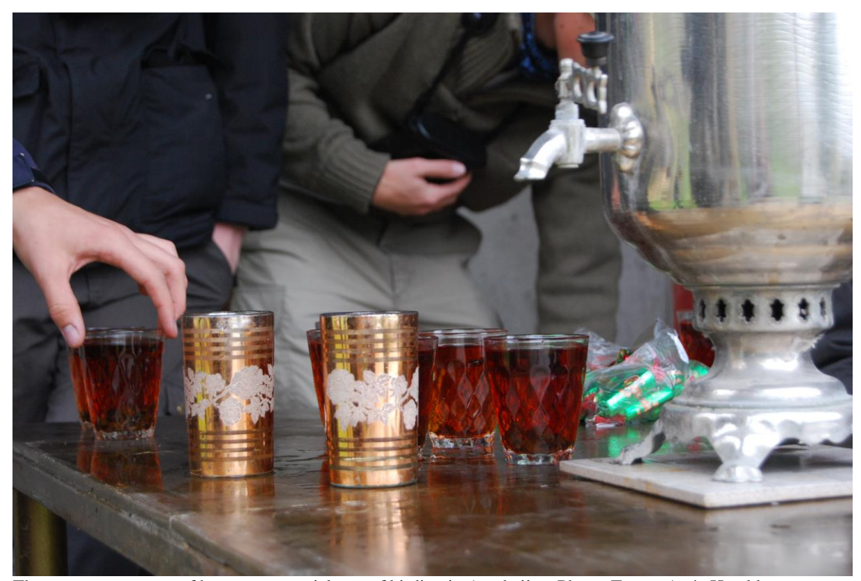
The ever present cups of hot tea – essential part of birding in Azerbaijan.

The house itself was very basic but charming – rough concrete walls, hanging light bulbs and with heating coming from old-style wood fired stoves – and our hosts did their utmost for us to have a good time. Generous amounts of tea for example. The Chirax castle ruin is perched on a hilltop within sight from the house and makes for a scenic backdrop.