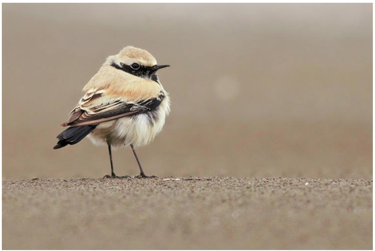
Desert Wheatear at the beach of Besh Barrmag.