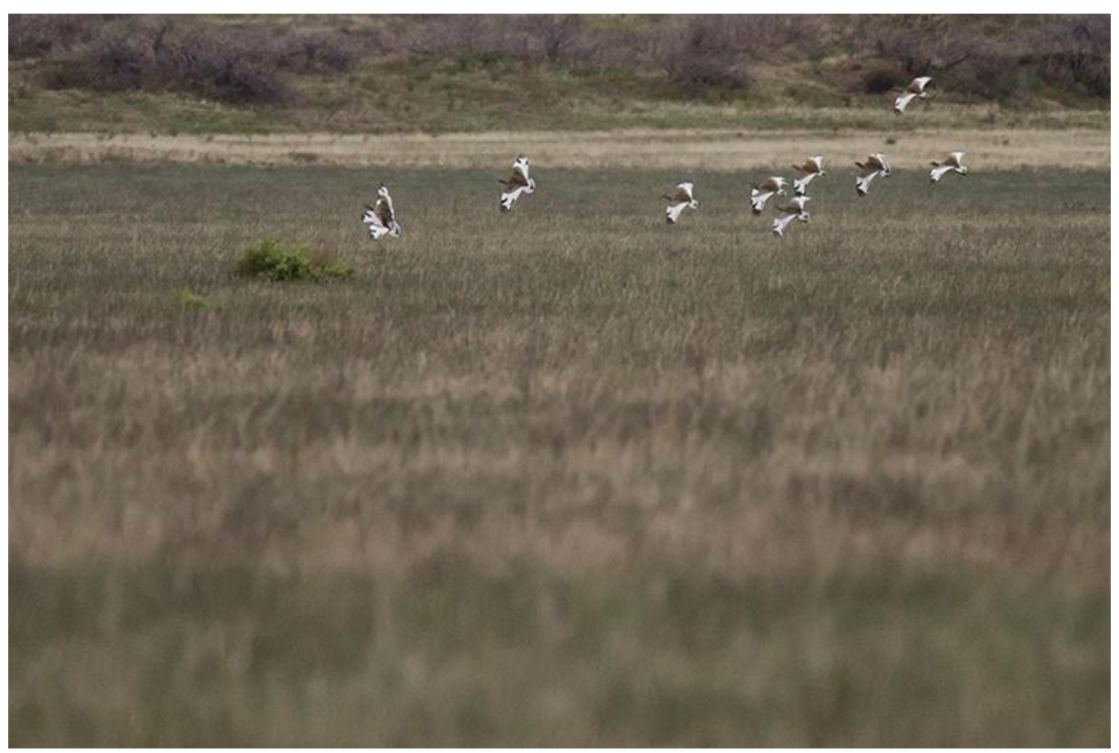
Little Bustards over the steppe at Besh Barmag.

4-5 at the "flamingo lake" Shirvan NP 29/10.