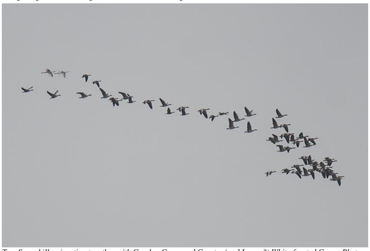
Two Spoonbills migrating together with Greylag Geese and Greater (and Lesser?) White-fronted Geese.

2 migrating at Besh Barmag 26/10 and 4 at the "flamingo lake" Shirvan NP 29/10.