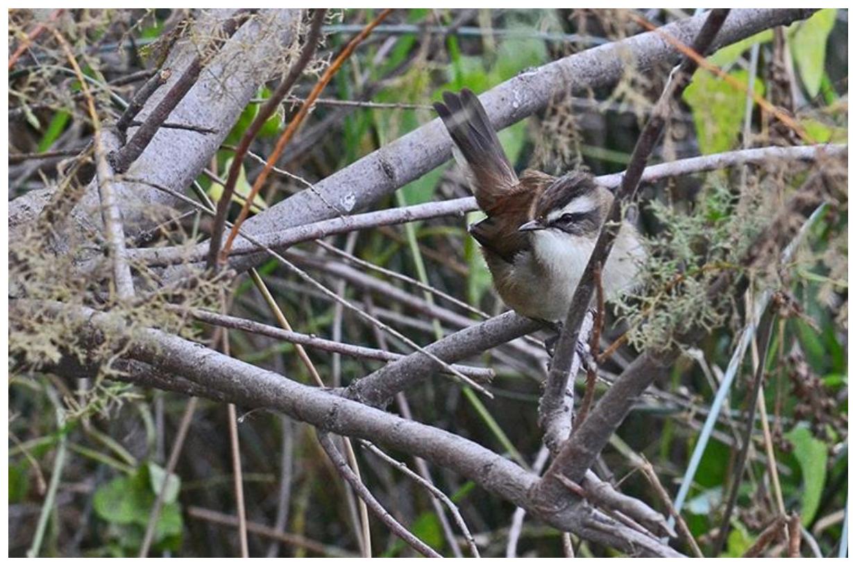
Moustached Warbler in the shrubs of Besh barmag.

5 at the coastal lagoon, Besh Barmag 28/10 and 8 at the "flamingo lake", Shirvan NP 29/10.