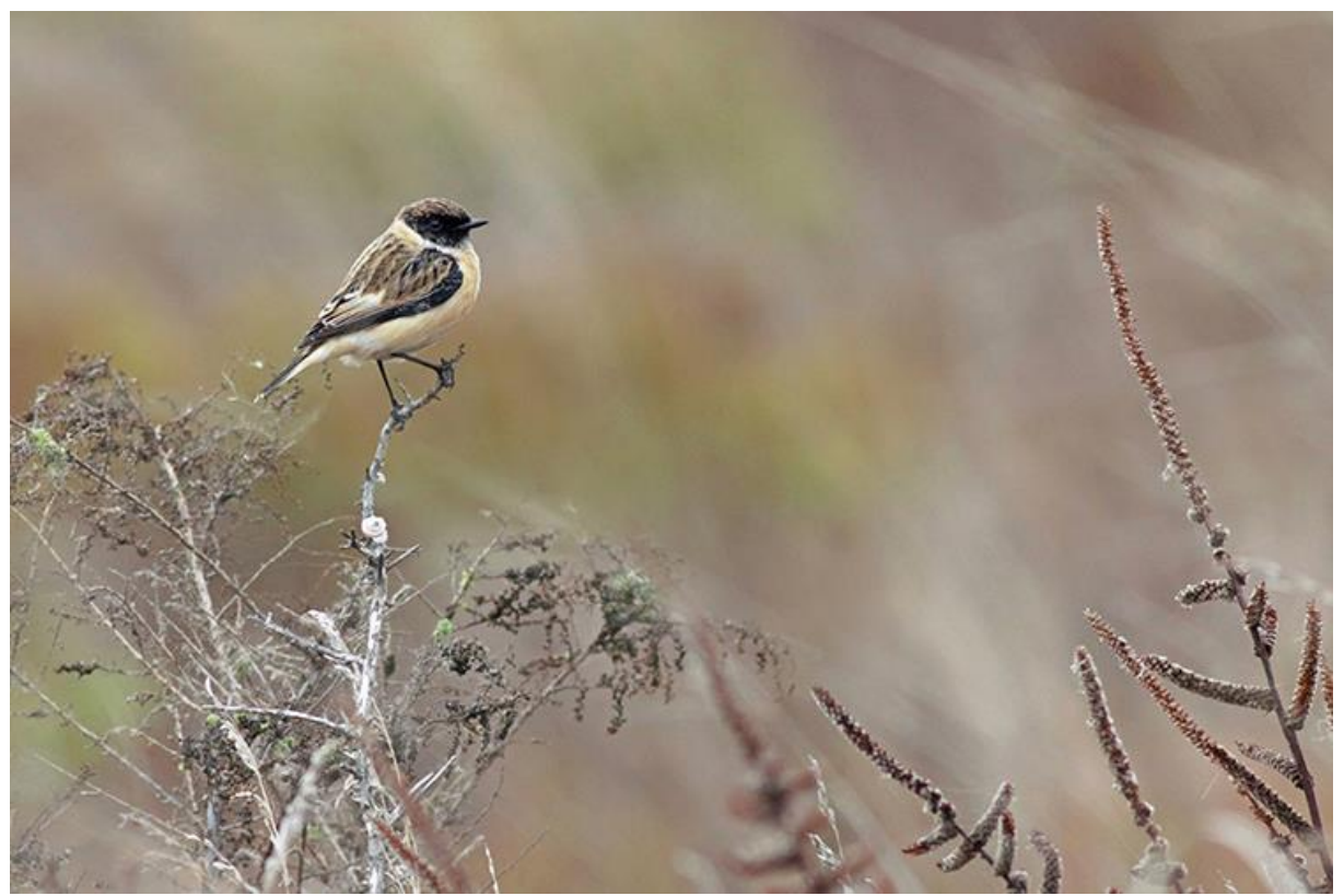
Siberian Stonechat male in Shirvan NP.

1 male at the beach at Besh Barmag 28/10. Probably the 5^{th} modern time record. We had the 3^{rd} record at the exact same spot in October 2013.