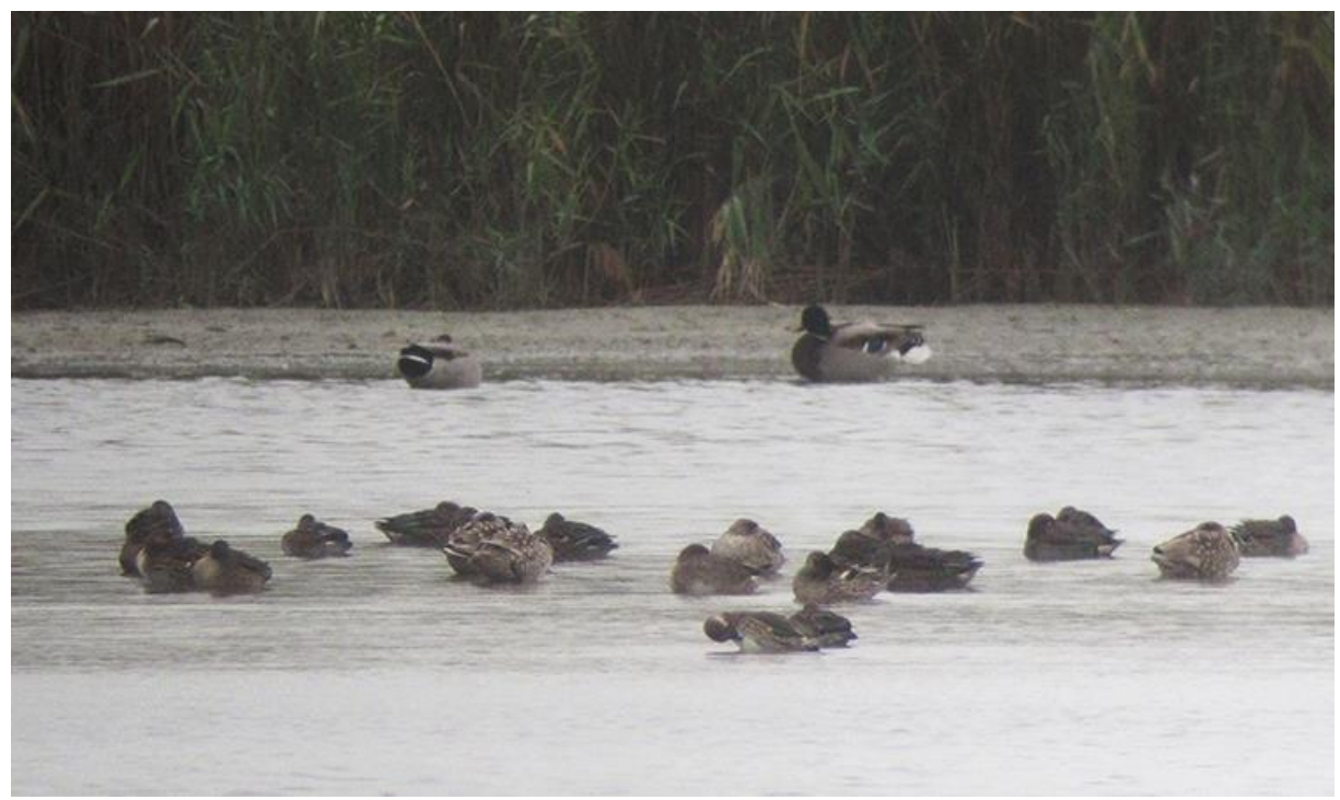
Marbled Teals with Teals and Mallards in Shirvan NP.

A total of 242 migrating at Besh Barmag 26-28/10 and 20 at the "flamingo lake", Shirvan NP 29/10.