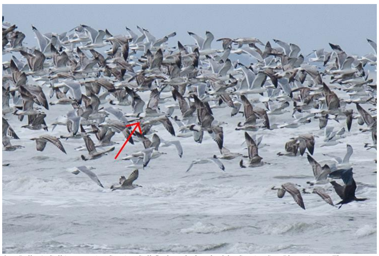
1 cy Pallas's Gull in a massive Caspian Gull-flock on the beach of the Caspian Sea.

A 1cy bird among Caspian Gulls at the beach, Besh Barmag, 28/10. Discovered by scanning the photos after the trip!