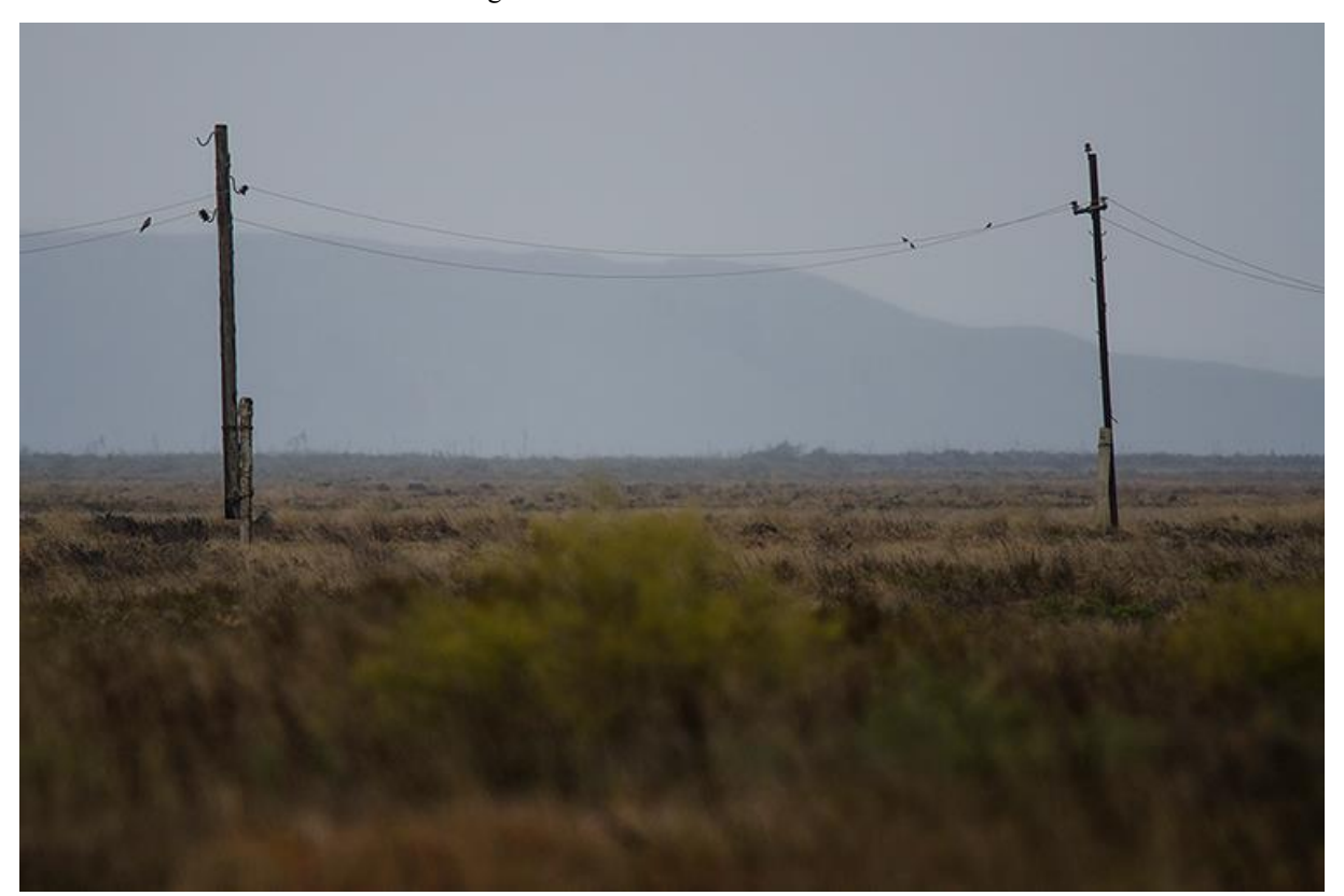
Lesser Kestrel and 3 Corn Buntings on wire at Shirvan NP. Typical Azeri steppe landscape.

One late male on a wire near the "flamingo lake" Shirvan NP 29/10.