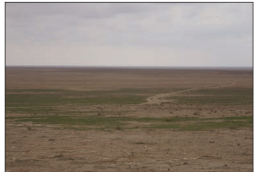
Plate 3. Al-Aumair site, Syria: 20 Sociable Lapwings Vanellus gregarius were seen.

Third sighting: 25 February 2011, al-Aumair 36° 26' N 39° 41' E (Figure 1, Plate 3). At 13.30 h, 20 Sociable Lapwings were found of which five were females. Of the fifteen males