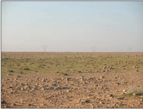
Plate 1. Ash'Shola site, Syria: two Sociable Lapwings Vanellus gregarius were seen, in the area of relatively greener vegetation.