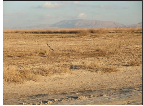
Plate 2. Khatuniyeh site, Syria: a single Sociable Lapwing Vanellus gregarius was seen (at the northeastern bank of the lake, not shown).