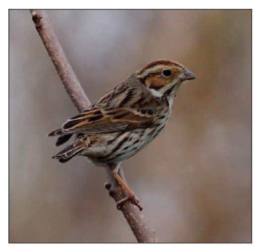
Plate 24. Little Bunting Emberiza pusilla, Subaşı, Hatay, Southern Coastlands, Turkey, 13 November 2010.