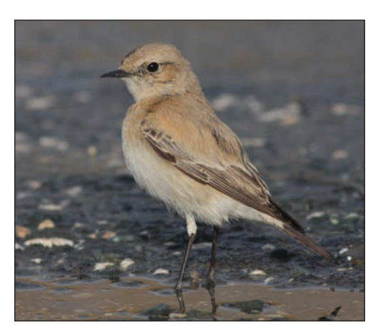
Plate 12. Female Desert Wheatear Oenanthe deserti, Samandağ, Hatay, Southern Coastlands, Turkey, January 2011.

Southern Coastlands: second-calendar year, O. l. lugens or O. l. persica , Göksu delta, 27 Mar 08 (R Wüst-Graf; photo; Plate 13) has been accepted by the Swiss rarities committee.