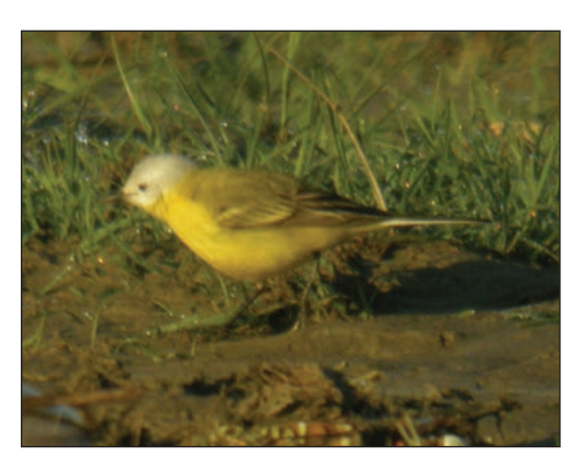
Plate 9. Male (Western) Yellow Wagtail Motacilla flava leucocephala, south Van marshes, East, Turkey, 25 April 2011.

East: race leucocephala , south Van marshes, 25 Apr 11 (O Nilsson, M Tholin; photo; Sandgrouse 33: 208; Plate 9). First record of this taxon in Turkey.