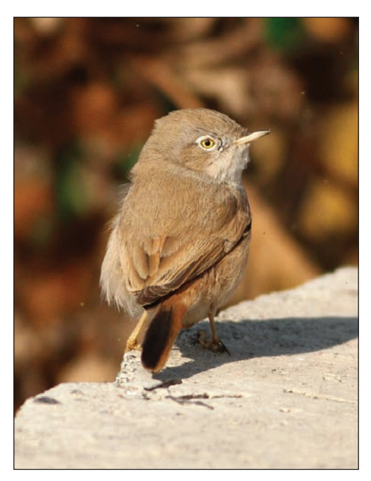
Plate 16. Asian Desert Warbler Sylvia nana, Filyos, Black Sea Coastlands, Turkey, 29 October 2011.