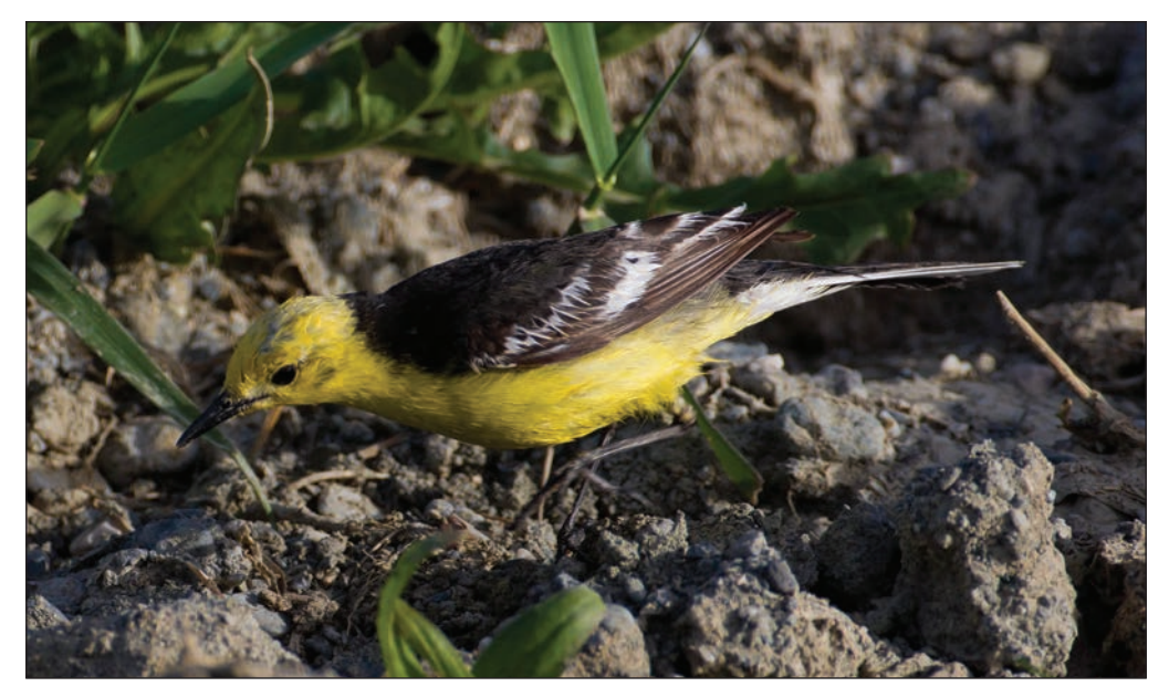
Plate 10. Citrine Wagtail Motacilla citreola calcarata, south Van marshes, East, Turkey, 18 May 2011.

South-East: Nizip, Gaziantep: 27 Jan 08 (A Atahan; Sandgrouse 30: 223; Kirwan et al 2008a); 10 Dec 11 ( Sandgrouse 34: 106). Third and fourth winter records.