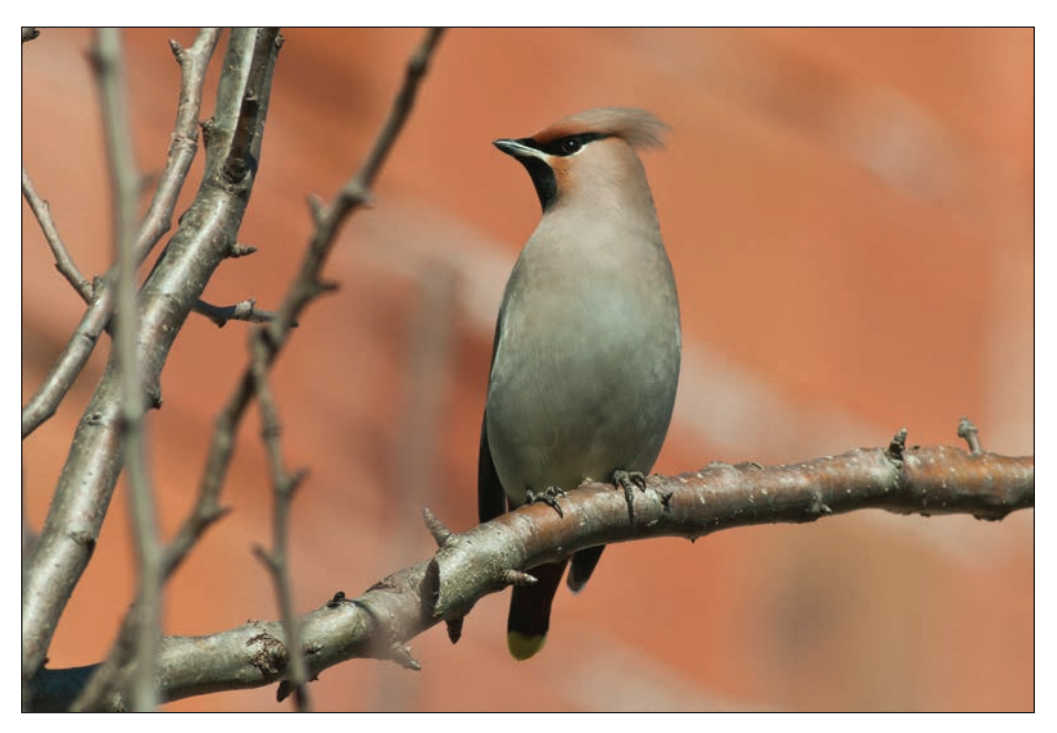
Plate II. Bohemian Waxwing Bombycilla garrulus, Asarcık, Samsun, Black Sea Coastlands, Turkey, 5 March 2011.

Central Plateau: Akyurt, Ankara, 24 Feb 10 (G Güven).