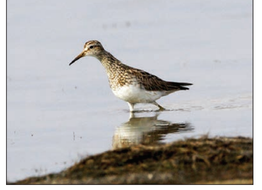
Plate 5. Pectoral Sandpiper Calidris melanotos, Gala Gölü, Thrace, Turkey, 9 October 2010.

Black Sea Coastlands: Kızılırmak delta: 31 May 08 (K Erciyas et al; Sandgrouse 30: 223);