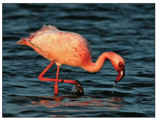
Plate 2. Lesser Flamingo Phoenicopterus minor, Gediz delta, Western Anatolia, Turkey, 30 April 2011.

23 Apr 11 (A & M Atahan et al ). 2, Çevlik, Hatay, 1 Jan 08 (M Atahan; Sandgrouse 30: 223). 4, Lara beach, Antalya, 28 Mar 09 (M Özen, Ö Sözüer). Göksu delta: 22 Feb 10 (S Karabiyik); 4, 29 Mar 10 (M Bozdoğan, E Yoğurtçuoğlu et al ).