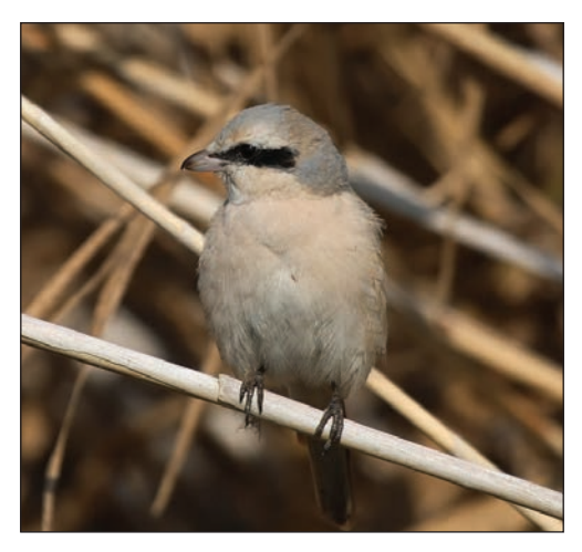
Plate 21. Turkestan Shrike Lanius isabellinus phoenicuroides, Gediz delta, İzmir, Western Anatolia, Turkey, 21 January 2008.