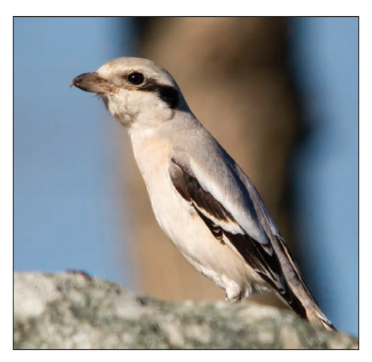
Plate 19. Great Grey Shrike Lanius excubitor pallidirostris, Rize harbour, Black Sea Coastlands, Turkey, 4 November 2010.