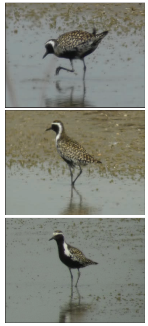
Plate 4. A Pacific Golden Plover Pluvialis fulva, Tuzla Gölü, Southern Coastlands, Turkey, 20 May 2011.

Passage migrant and perhaps also winter visitor in large numbers to small area in South-East, where only discovered in early 2007 ( Sandgrouse 29: 97–98), with significant percentage of global population probably occurring there and in adjacent Syria. Additionally, recorded very rarely in spring in Black Sea Coastlands, Western Anatolia, Southern Coastlands and Central Plateau, and in autumn in eastern Black Sea Coastlands, Western Anatolia and East, with very large numbers (perhaps most of world population) now confirmed to move through eastern third of country. For a historical review of the species' status see