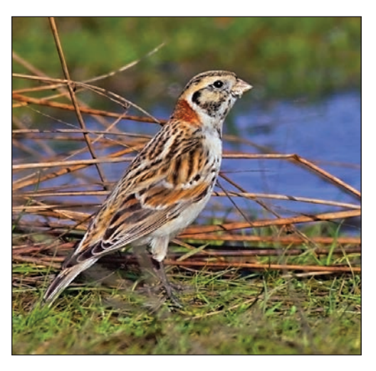
Plate 23. Lapland Longspur Calcarius lapponicus, İğneada, Thrace, Turkey, 11 February 2010.

Vagrant, but occurrence poorly documented, with no extant specimens and just two previous modern (post-1966) reports, both in Black Sea Coastlands in Apr 1992, which