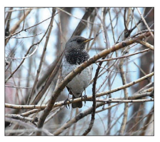
Plate 14. Dark-throated Thrush Turdus ruficollis atrogularis, Erzurum Ovası, East, Turkey, 20 March 2011.

West Anatolia: Bafa Gölü: singing, 19, 22 and 23 Mar 08 (J Pels).