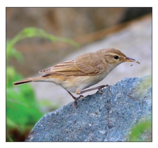
Plate 15. Booted Warbler Hippolais (Iduna) caligata, Rize, Black Sea Coastlands, 8 September 2010.

Previously considered a vagrant, though some of the six records between 1969 and 1983 are not well documented. An apparently quite large breeding population