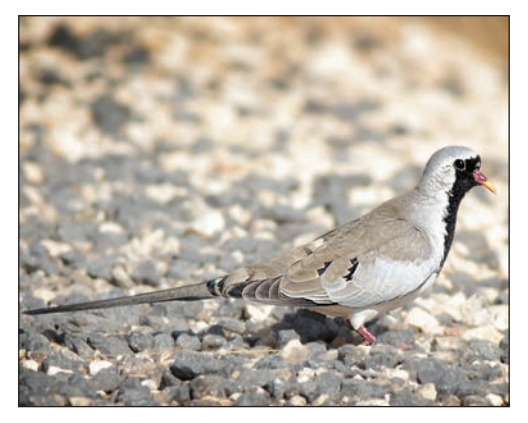
Plate 7. Male Namaqua Dove Oena capensis, Birecik, South-East, Turkey, 21 June 2009.