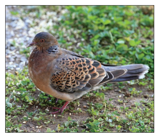
Plate 6. Oriental Turtle Dove Streptopelia orientalis meena, Ayvalık, Balıkesir, Western Anatolia, Turkey, January 2011.

Presumably resident in montane coniferous forest over much of the northern half of the country, but just one definite nesting record (in 2010). Full details of a winter record in the Taurus mountains have never been