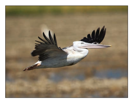
Plate I. Immature Pink-backed Pelican Pelecanus rufescens , Göksu delta, Southern Coastlands, Turkey, 10 May 2011.