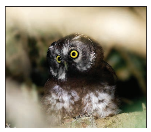
Plate 8. Tengmalm's Owl Aegolius funereus, Uludağ, Bursa, Western Anatolia, 27 July 2010.