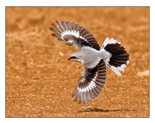
Plate 20. First-winter Great Grey Shrike Lanius e. excubitor, west of Ceylanpinar, South-East, Turkey, 2 November 2009.