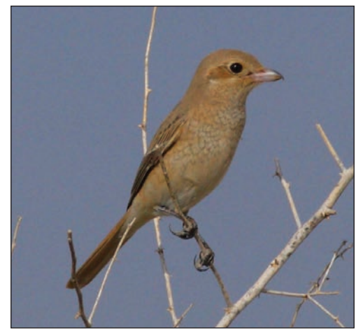
Plate 22. Daurian Shrike Lanius i. isabellinus, Karkamış dam, South-East, Turkey, 12 October 2008.

'grey shrikes' (Olsson et al 2009). As a result, we retain all records under excubitor until such time as a more robust dataset pertaining to this group becomes available.