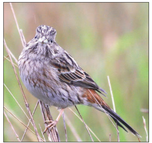
Plate 25. Pine Bunting Emberiza leucocephalos, Büyükçekmece Gölü, İstanbul, Thrace, Turkey, II January 2008.

although made by observers familiar with the species lacked documentation (Kirwan et al 2008a), making the two records in November 2010 the first to be fully documented in the country.