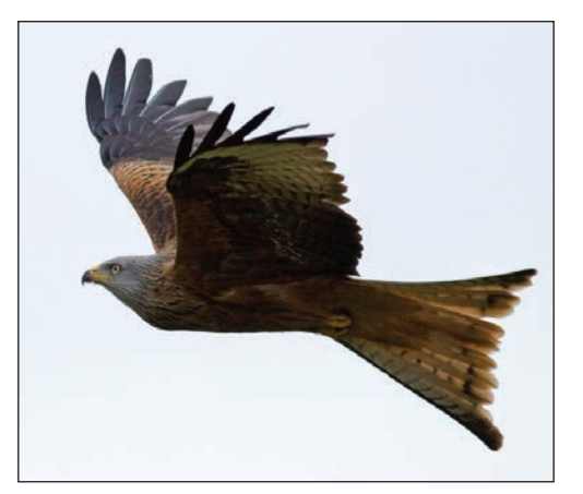
Plate 3. Red Kite Milvus milvus, Esenboğa airport, Ankara, Central Plateau, Turkey, 2 May 2011.

Southern Coastlands: Hacılar Köyü, Burdur, 5 Feb 11 (S Özgünlü, G Sinan; photo; Sandgrouse 33: 208).