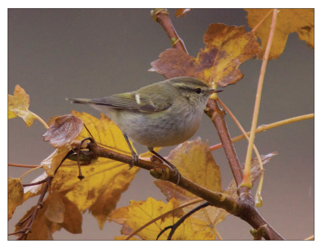
Plate 17. Hume's Leaf Warbler Phylloscopus humei, Pelitköy, Samsun, Black Sea Coastlands, Turkey, 19 November 2011.

Black Sea Coastlands: probably first-winter, Pelitköy, Samsun, 19 Nov 11 (M Danacı; photo; Plate 17; Sandgrouse 34: 106).