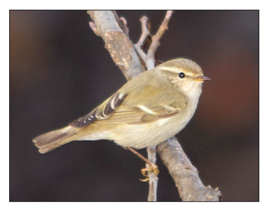
Plate 18. Yellow-browed Warbler Phylloscopus inornatus, Rize, Black Sea Coastlands, Turkey, 9 January 2010.

Scarce winter visitor to the western twothirds of Turkey, most frequently to Thrace. The following comprise the first record for South-East (an individual of the nominate race, like the vast majority of other records in Turkey identified to subspecies) and the first three records of race pallidirostris (so-called Steppe Grey Shrike) from Central (Middle) Asia, which subspecies has sometimes been recommended for species status (Hernández et al 2004) or included within Southern Grey Shrike L. meriodionalis (Dickinson 2003). Just one previous record of meridionalis in Turkey, a specimen taken in the environs of Istanbul, but subsequently lost and therefore impossible to validate (Mathey-Dupraz 1921, Kirwan et al 2008a). However, a recent molecular study found high levels of incongruence between molecular and other data with respect to the taxonomy of