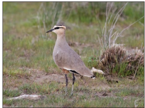
Plate 3. Sociable Lapwing Vanellus gregarius , Miankaleh wildlife refuge, Iran, 10 March 2009.

In February 2009 a single bird was observed by FE around Eshq-Abad, Ghaleh-Now wetland (Figure 1), southeast of Tehran. On 14 November 2007, two Sociable Lapwings were observed by MM in Chaharmahal and Bakhtiari province in a grassland habitat 100 m north of the Gandoman wetland (31° 50' 53.7" N, 51° 07' 53.1" E, Figure 1). On 8 January 2008, during the mid-winter waterbirds census at Boonji coast, Jask area, Hormozgan province (25° 54' 39" N, 57° 16' 59" E, Figure 1), a Sociable Lapwing was observed by MG in