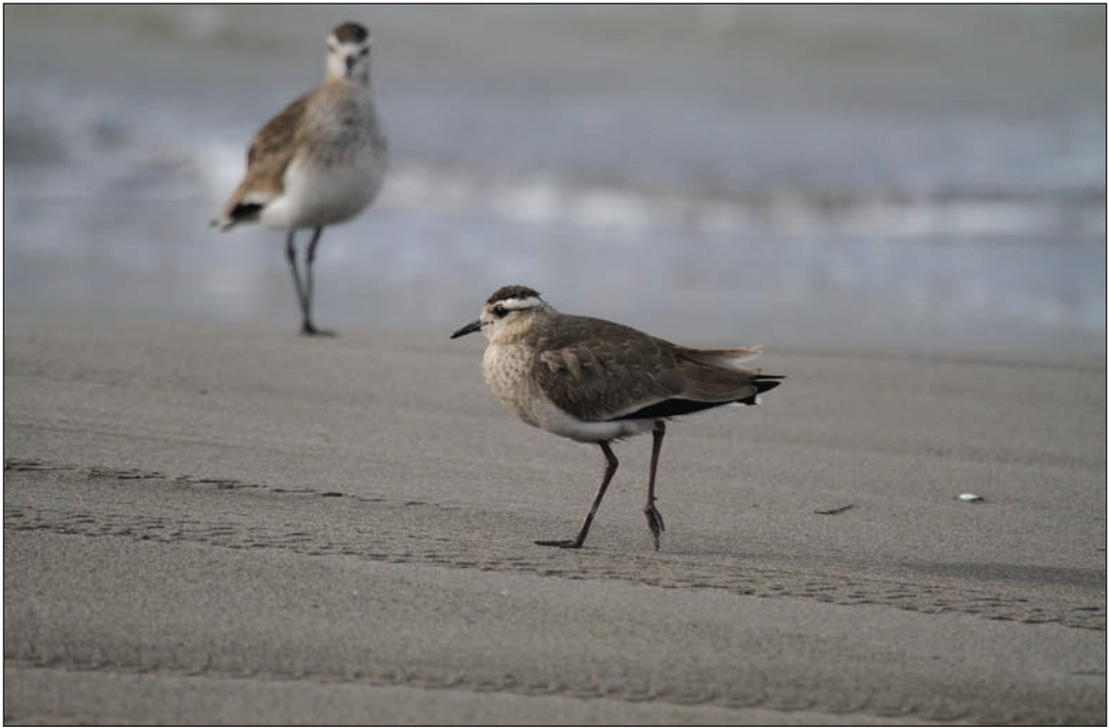
Plate 2. Two Sociable Lapwings Vanellus gregarius , Boujagh NP coast, Iran, 21 November 2011.

November 2011 by Gharabaghdoost. Ghaemi (2006) reported 4 individuals in Gomishan wetlands in April 1999 (Table 1).