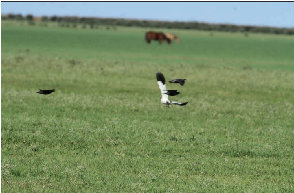
Plate 1. Sociable Lapwing Vanellus gregarius at Boujagh NP, Iran, 27 November 2010.

The Sociable Lapwing was recorded at the nearby Anzali wetland area, 40 km west of Boujagh NP, on at least four occasions 1967–1998 (Table 1). Far to the east of Boujagh NP, between the two wetlands of Miankaleh and Gomishan, two Sociable Lapwings were observed by KR 15 November 2007. The birds were observed foraging in ploughed farmland adjacent to Khajeh-Nafas village (37° 02' 26" N, 54° 03' 35" E). The feeding behaviour of the birds was observed for about one hour, and the main prey item appeared to be Mole Crickets Gryllotalpa gryllotalpa . On 10 March 2009, a Sociable Lapwing in summer plumage was observed by KR and MG in Miankaleh wildlife refuge (36° 50' 23.5" N, 53° 27' 48.7" E, Plate 3). Also one individual was photographed at the same area 16