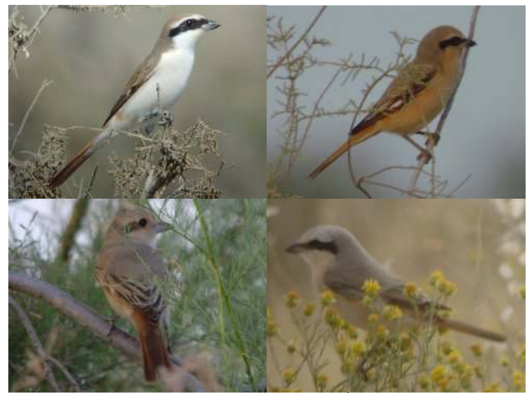
Above left: male phoenicuroides (Turkestan Shrike) Zour Port 6<sup>th</sup> April 2007 Above right: male isabellinus (Daurian Shrike) Sulaibhikat 5<sup>th</sup> April 2007 Below left: female isabellinus (Daurian Shrike) Sulaibhikat 5<sup>th</sup> April 2007 Below right: male isabellinus (Daurian Shrike) Kabd 8<sup>th</sup> April 2007