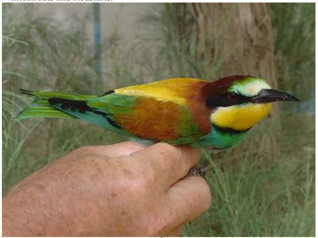
European Bee-eater Al-Abraq Al-Khabari 8<sup>th</sup> April 2007 – this stunning bird had to be humanely destroyed moments after this photograph was taken due to a broken wing. It had been shot out of the sky by Kuwaiti hunters as we birded this desert oasis, truly bringing home the indiscriminate bird killing that unfortunately occurs in the country

time here, this is where we experienced the most shooting and the devastating effects that come with it. Accipters seemed to be the main target and this was evident by a number of dead Sparrowhawks we found, but the most distressing sight was that of a Bee-eater being shot out of the sky. This is apparently the best place to see African Collared Dove in Kuwait but we failed to find this species here, although it was apparently seen whilst we were on site. We witnessed a wave of migrants moving through that included a couple of Barred and Menetries's Warblers, an Icterine Warbler, a couple of Semi-collared Flycatchers as well as good numbers of Lesser Whitethroats and Redstarts.