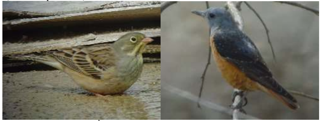
Left: Ortolan Sulaibhikat 3<sup>rd</sup> April 2007 Right: Rock Thrush Sulaibhikat 3<sup>rd</sup> April 2007

Grey Heron 10+, Greater Flamingo 400+, Kentish Plover 10+, Little Stint c.80, Slender-billed Gull c.200, Little Tern 1, Namaqua Dove 4, Hoopoe 1, Bee-eater 7, Swallow 10, Crested Lark C, White Wagtail 1, Red-throated Pipit 3, Redstart 1, Bluethroat 1, Rufous-tailed Scrub Robin 1, Eastern Black-eared Wheatear 1, Rock Thrush 1 (male), Stonechat 2, Grey Hypocolius 1(female), White-cheeked Bulbul C, Graceful Prinia 12, Lesser Whitethroat 2, Long-tailed Shrike 1, Common Myna 5, House Sparrow C, Ortolan 1