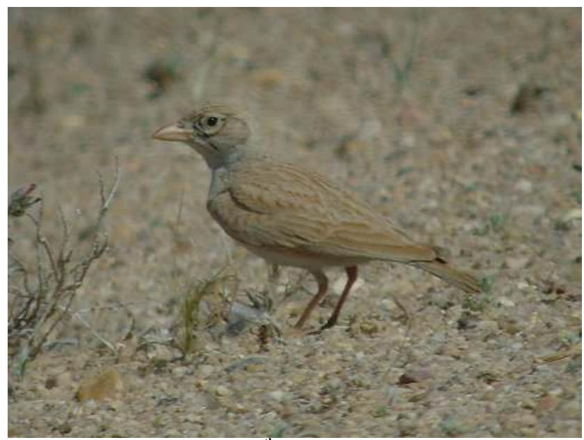
Dunn's Lark Sabah-al-Ahmad 7th April 2007