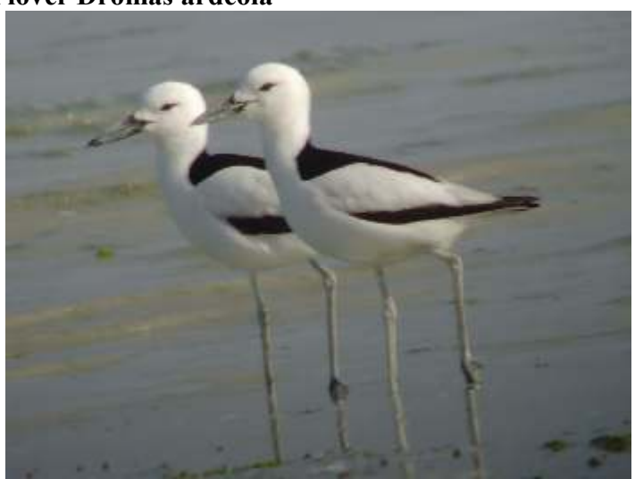
Crab Plover Doha Spit 6<sup>th</sup> April 2007

We only saw this species at Doha Spit as we did not have the chance to visit Bubiyan Island where spectacular numbers breed. Records from Doha Spit included 3 on 3<sup>rd</sup> April, 1 on 5<sup>th</sup> April and 6 on 6<sup>th</sup> April.