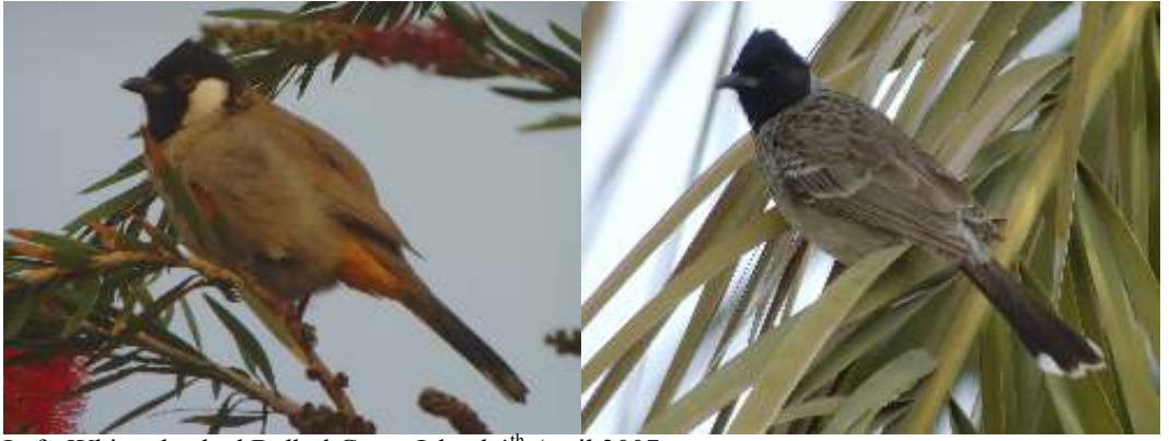
Left: White-cheeked Bulbul Green Island 4<sup>th</sup> April 2007 Right: Red-vented Bulbul Green Island 4<sup>th</sup> April 2007