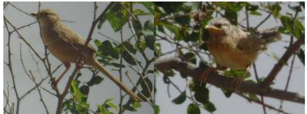
Left: adult Common Babbler Abdaly Farms 5<sup>th</sup> April 2007 Right: juvenile Common Babbler Abdaly Farms 5<sup>th</sup> April 2007