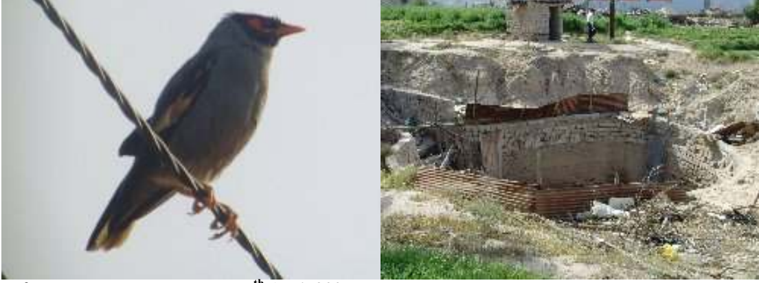
Left: Bank Myna Jahra Farms 7<sup>th</sup> April 2007

Right: Bank Myna breeding site – well at Jahra Farms 7th April 2007