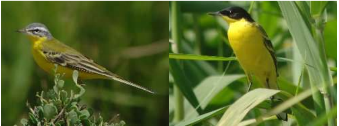
Left: Yellow Wagtail Motacilla flava beema Jahra East 3<sup>rd</sup> April 2007 Right: Black-headed Wagtail Motacilla (flava) feldegg Jahra East 3<sup>rd</sup> April 2007

Cormorant 4, Squacco 8+, Western Reef Egret 1, Purple Heron 2, Black-winged Stilt 2, Black-winged Pratincole 28, Collared Pratincole 1, Grey Plover c.10, Ruff 4, Common Sandpiper 4, Slender-billed Gull C, Black-headed Gull c.30, Great Black-headed Gull 1(2cy), Heuglin's Gull 3, Caspian Tern 15+, Little Tern 1, Sand Martin 2, Red-throated Pipit C, Yellow Wagtail 100s, Isabelline Shrike 1(phoenicuroides)