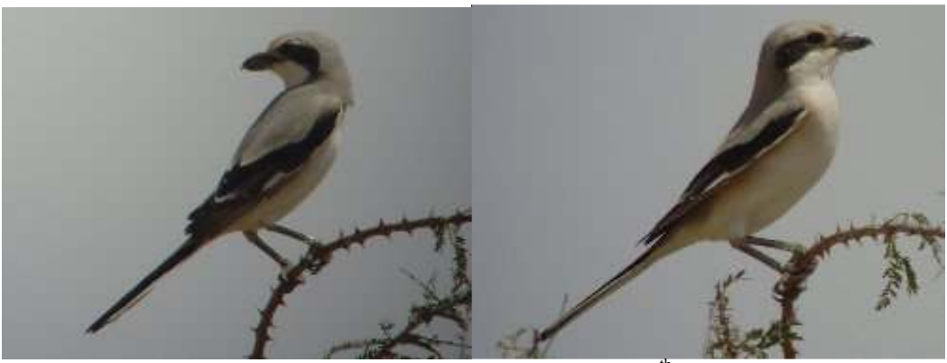
Steppe Grey Shrike Lanius meridionalis pallidirostris Tulha 7<sup>th</sup> April 2007

Individuals of the race pallidirostris (Steppe Grey Shrike) noted at Zour Port/Pipeline Beach 6<sup>th</sup> April, Tulha 7<sup>th</sup> April and Sabah Al-Ahmad 8<sup>th</sup> April. A bird of the race aucheri was noted at Sabah Al-Ahmad 7<sup>th</sup> April.