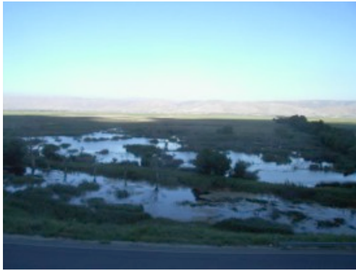
Aamiq from the hills to the west, May 2006.

Night Herons, Little Bitterns, Little Grebes and a multitude of the previously mentioned warblers were in the wetland. We managed to flush a Great Snipe that Richard had seen some days before. Red-rumped Swallow, Woodchat Shrike and a lone Turtle Dove flew by. In the surrounding land both Calandra Larks and Corn and Black-headed Buntings were common.