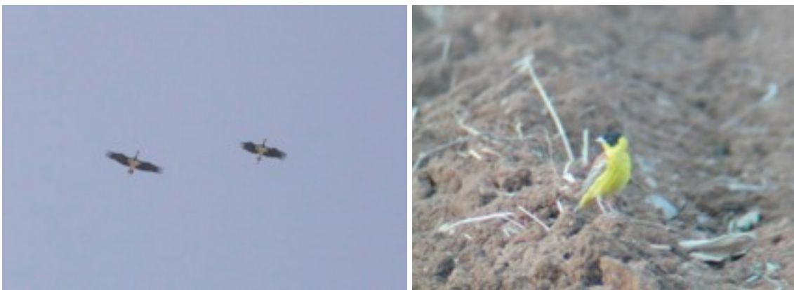
Black Storks and Black-headed Bunting.

The reeds were alive with Great Reed Warblers, Moustached and Savi's Warblers. Little Bittern was flushed from the edges. Black-headed Bunting, Cettis Warbler and Calandra Larks were territorial. Next to a dirt track running through the fields were three Pale Rock Sparrows and two Rose-coloured Starlings passed overhead. Black and White Storks as well as two Long-legged Buzzards appeared in the sky. By the parking lot I was surprised to see a Namaqua Dove fly past me towards the village. Obviously this was the first record for Lebanon and a report is sent to the national committee.