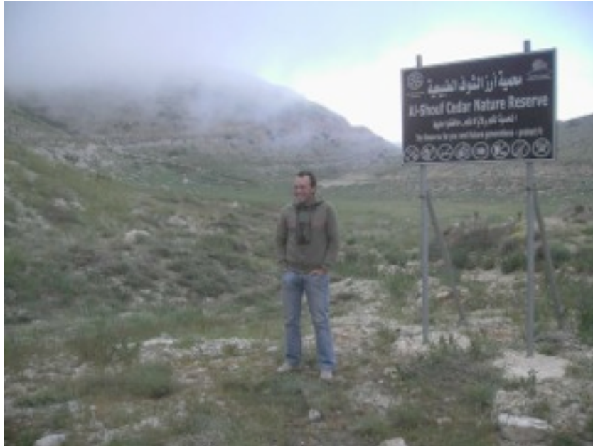
Me in the chilly morning on 1.900m a.s.l. in the Shouf.

2 at Kfar Zabad and 7 at Tell el-Akhdar one flock just north of Aamiq Baalbek (among the temple ruins!) and at Chouf Montains 3 at Kfar Zabad and fairly common around Aana/Aamiq 16-17/5 seen seen 10-12 at Kfariya vineyard common in the Bekaa common in the Bekaa