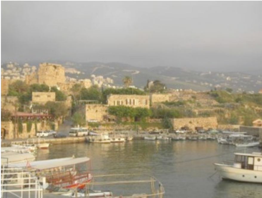
Pretty fishing port of Jbeil with the ancient ruins of Byblos

May 16 th birding at the IBA of Kfar Zabad and the wetland of Aamiq in the Bekaa Valley. I stayed two nights at the A Rocha project house in Aana.