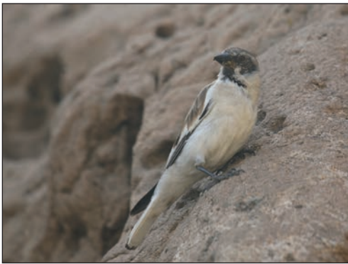
Plate 3. White-winged Snowfinch Montifringilla nivalis , June 2010, Piramagroon mountain, Kurdistan, Iraq.