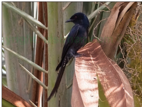
Plate 7. Ashy Drongo Dicrurus leucophaeus , 10 April 2010, Jahra Farms, Kuwait.