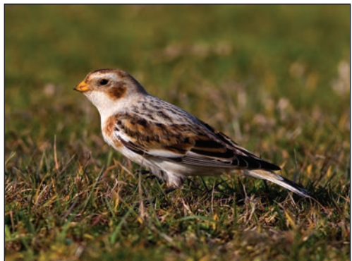
Plate 12. Snow Bunting Plectrophenax nivalis, 6 February 2010, Kızılırmak delta, Turkey.

There were three records of Red-breasted Geese Branta ruficollis during the winter with singles at Filyos, Zonguldak, 26 Jan and the Gediz delta 17 Feb, and five at Sarıkum lake, Sinop, 16 Feb. Turkey's second Lesser Flamingo Phoeniconaias minor was at the Gediz delta 24 Jan. Three Little Bustards Tetrax tetrax were seen at the start of the year with singles at Filyos 26 Jan, the Göksu delta 7 Feb and the Kızılırmak delta 2 Feb. A flock of 55 Sociable Lapwings Vanellus gregarius at Urfa Bozkırları 11 Mar continued the annual run of records and highlighted the importance of this region of Turkey for this globally threatened species. A report of a Pacific Golden Plover Pluvialis fulva in the Kızılırmak delta 1 Oct 2009 is the 2nd for Turkey. A Caspian Plover Charadrius asiaticus near Kaldırım, Çukurova, 19 Apr was