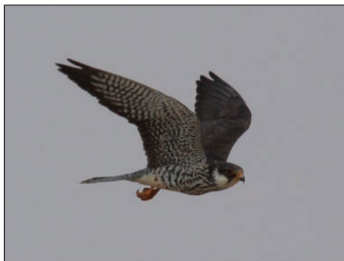
Plate 5. Amur Falcon Falco amurensis , 29 May 2010, Sabah Al-Ahmed NR, Kuwait.

An adult Lesser Flamingo Phoeniconaias minor , the second for Kuwait, was at Sulaibikhat bay 16–27 Jan and a Black Stork Ciconia nigra was at Sabah Al-Ahmed NR 1 May. The first Amur Falcon Falco amurensis for Kuwait was photographed at SAANR 29 May (Plate 5). Several hundred Demoiselle Cranes Anthropoides virgo were recorded from 19 Mar, with a peak of 70 at SAANR (Plate 6). There are only four previous records. It is thought they were blown from their normal western Arabian peninsula migration route to the east coast by the gale force westerly winds at the time. The first breeding record of White-tailed Lapwing Vanellus leucurus in Kuwait