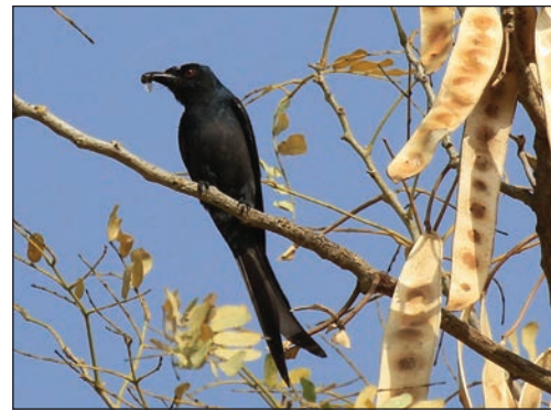
Plates 15–17. Ashy Drongo Dicrurus leucophaeus , 3 March 2010, Safa park, United Arab Emirates.

singles Wamm farms and Ra's al-Khaimah mountains 19–20 Mar and Wamm farms 3 Apr (14–16th records), and the first breeding record, an adult with two juveniles in Masafi wadi 7–12 Jun. Hypocoliuses Hypocolius ampelinus were on Lulu island and in the Western Region on Dalma island, Jebel Dhanna and Sila'a peninsula until 13 Apr with a maximum count of 30 birds. An Ashy Drongo Dicrurus leucophaeus at Safa park 14–15 Jan and 2–17 Mar (3rd record, Plates