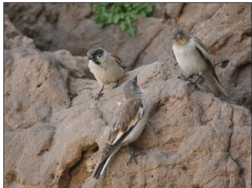
Plate 4. White-winged Snowfinches Montifringilla nivalis , June 2010, Piramagroon mountain, Kurdistan, Iraq.

The central and western deserts of Iraq are one of the main migration routes for raptors in Iraq. In spring, over 450 Lesser Kestrels Falco naumanni , 500 Black Kites Milvus migrans and Black-eared Kites Milvus migrans lineatus , four Eastern Imperial Eagles Aquila heliaca and six Pallid Harriers Circus macrourus were seen.