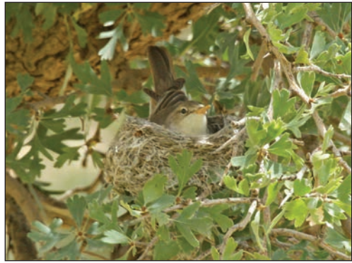
Plate 2. Upcher's Warbler Hippolais languida on nest, May 2010, Iraq.