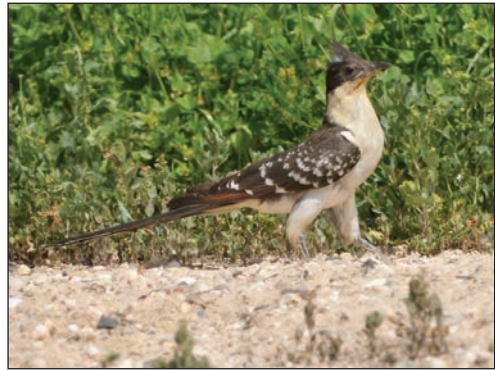
Plate 9. Great Spotted Cuckoo Clamator glandarius , 12 March 2010, Arakhiya farm, Qatar.

New species for Qatar were Variable Wheatear Oenanthe (picata) picata at Al Ruwais 27 Nov 2008 and Cretzschmar's Bunting Emberiza caesia at Sealine beach resort 19 Mar. At least two pairs of Purple Herons Ardea purpurea have been found breeding at Abu Nakhla, the first breeding records for Qatar and the Gulf. An adult male European