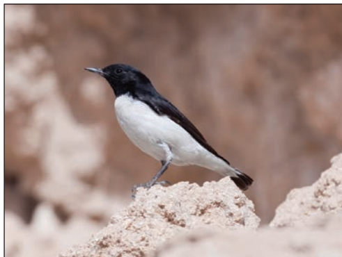
Plate 8. Hume's Wheatear Oenanthe albonigra , 5 February 2010, Kuwait.