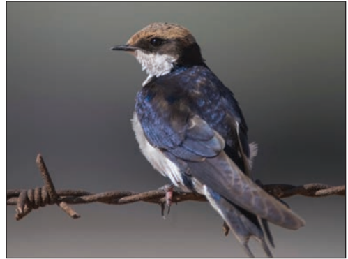
Plate 20. Wire-tailed Swallow Hirundo smithii , February 2010, Al Ain WTP, United Arab Emirates.