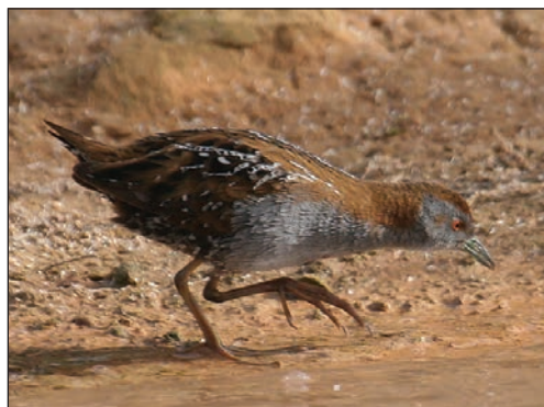
Plate 10. Baillon's Crake Porzana pusilla , 11 April 2010, Arak dam, Syria.

Surveys of the protected areas at Abu Qubeis (coastal mountains), Jebel Abdul Aziz (in the Jazira) and Forouloq (near Kassab) yielded valuable results, emphasising their conservation importance. See-see Partridges Ammoperdix griseogularis were at Karakozak dam (4) and Lower Khabur reservoir dam (2) in March and Jebel Abdul Aziz (2) 12 Apr, as well as the 'usual' site at Halabbiyah. At least four Black Francolins Francolinus francolinus were heard near the Palm Village hotel, Damascus, 4–5 May; this is very surprising as their nearest known locality is the Euphrates valley, 400 km across the desert. Perhaps they were released. Four Mute Swans Cygnus olor were at lower Khabur reservoir 9 Apr. Up to 72 Lesser White-fronted Geese Anser erythropus were at Sabkhat al-Jabbul this winter; this RDB Vulnerable species clearly winters regularly in northern Syria. Two Red-breasted Geese Branta ruficollis were at Jabbul 16 Feb. At least 2300 White-headed Ducks Oxyura leucocephala were at Jabbul 19 Feb with 1850 still present 3 Mar; these counts are by far the highest from Syria. Single figures at Mheimideh on several dates included a