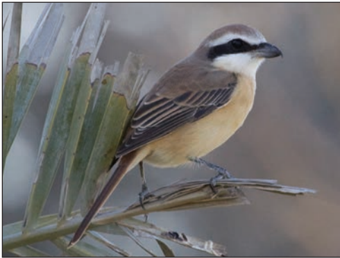
Plate 14. Brown Shrike Lanius cristatus, April 2010, Dubai Pivot Fields, United Arab Emirates.

Bubulcus ibis coromandus (the 1st UAE record, first seen Aug 2009) appears to have wintered at Wamm farms. This taxon and Cattle Egret Bubulcus i. ibis are almost inseparable in non-breeding plumage, so when it became white in Sep 2009 it was undetected or absent until it developed its orange plumage again and was then seen 26 Mar–17 Apr. One Brown Booby Sula leucogaster (15th record) on the east coast 28 May was joined by two more at Khor Kalba the next day. Two Masked Boobies Sula dactylatra were at Khor Kalba 29 May (12th record). An Amur Falcon Falco amurensis at Al Qua'a fodder field 29 Dec was the 11th record. Two Spur-winged Lapwings Vanellus spinosus were at Al Ain water treatment plant 13–14 Feb with a single bird until 6 Mar (Plate 13). One at Al Quoz stables 28 Feb–7 Jun was the 3rd record. Interesting records of larids (all of singles) included: Brown Noddy Anous stolidus at Jebel Dhanna 4 May (the first off the west coast) with another off Fujairah 25 May; Black-legged Kittiwake Rissa tridactyla on Fujairah port beach 11–12 Feb (4th record); Little Gull Hydrocoloeus minutus in Khor Kalba harbour 11–20 Mar (14th record); Arctic Tern Sterna paradisaea on Fujairah port beach 7 May (2nd record); Roseate Tern Sterna dougallii off Ra's Dibba 11 Jun (3rd record) and immature Sooty Tern Onychoprion fuscata off Khor Kalba harbour 9 Jun (7th record). A Pied Kingfisher Ceryle rudis was in Dubai city 6 Jan–1 Feb with another in Ruwais 5 Mar.