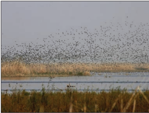
Plate 1. Marbled Ducks Marmaronetta angustirostris en masse, 5 February 2010, Baghdadiya, Iraq.