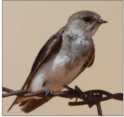
Plates 18 & 19. Pale Martin Riparia diluta, February 2010, Al Ain WTP, United Arab Emirates.