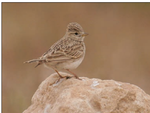
Plate 11. Lesser Short-toed Lark Calandrella rufescens , April 2010, Syria.