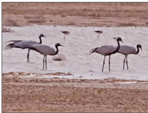
Plate 6. Demoiselle Cranes Anthropoides virgo , 23 March 2010, Sabah Al-Ahmed NR, Kuwait.