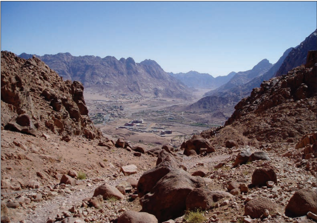
Plate 1. St Katherine City

Key: 2006: 1 = Wadi Nasb, 2 = Ain Hodra, 3 = Wadi Marra, 4 = Wadi Gharba, 5 = Wadi Gebel, 6 = Wadi Itlah. 2007: 7 = Ain Hodra, 8 = Sheikh Awad area (Wadi Sulaf), 9 = Wadi Kid, 10 = St Katherine City (2006 & 2007)