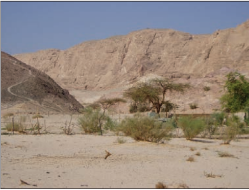
Plate 2. Ain Hodra © Matthew White