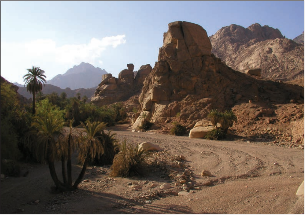
Plate 4. Wadi Kid

Wadi Itlah (1400–1520 m asl, 2006). Located close to St Katherine, Wadi Itlah is a narrow and long wadi system with scree slopes and extensive boulder fields. There are several Bedouin fruit gardens and small holdings with goats, sheep and donkeys, also a few carob trees and date palms outside of the gardens.