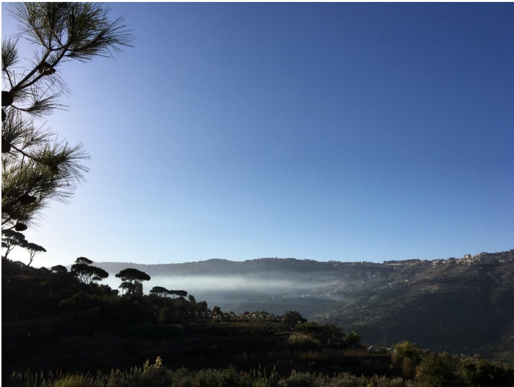
Morning view over the Beirut River Valley. Chattering White-spectacled Bulbuls and Graceful Prinias, the first Short-toed Eagles drifting overhead and tea brewing on the log fire.

http://www.spnl.org/unifying-our-voices-for-bird-conservation-birdlife-sweden-and-spnl-celebrating-wmbd-in-hima-ras-el-maten/