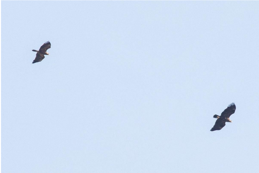
Greater Spotted Eagle ahead of a Lesser Spotted Eagle. Note the larger size, chunky shape, clear "fingers", darker colors and single white carpal patch of the Greater Spotted Eagle.

2 migrating (1cy and 2cy+) in the burst of LSE at 3pm on October 3rd, Ras al-Matn