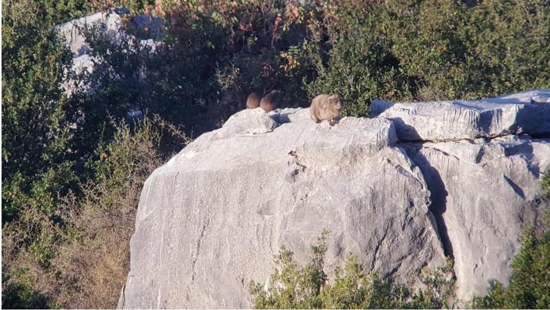
Rock Hyrax family below the observation point at Ras al-Matn, as seen through the scope.