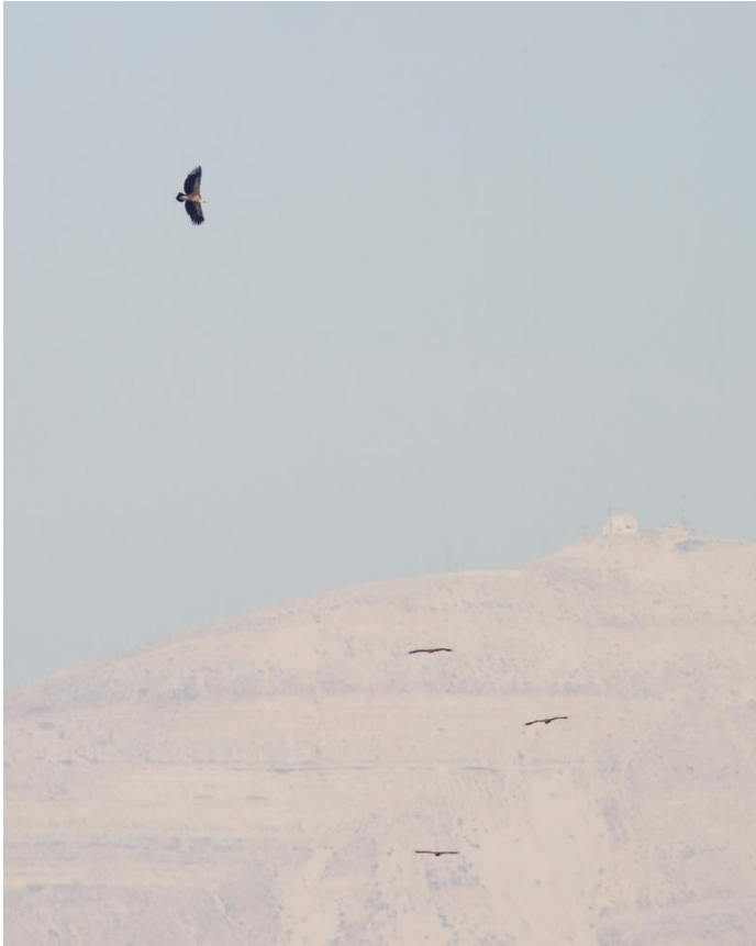
A majestic Griffon Vulture among Lesser Spotted Eagles, seen from the lunch tables in Ras al-Matn.

Egyptian Vulture ( Neophron percnopterus )