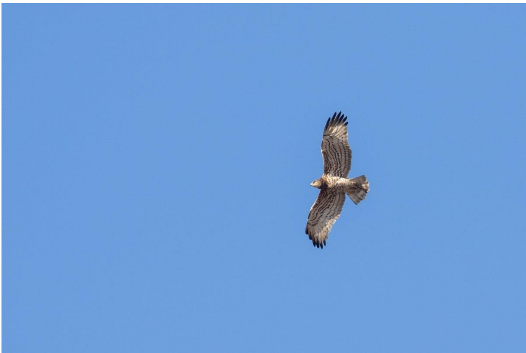
One of many beautiful Short-toed Eagles seen at close range during our brief visit.