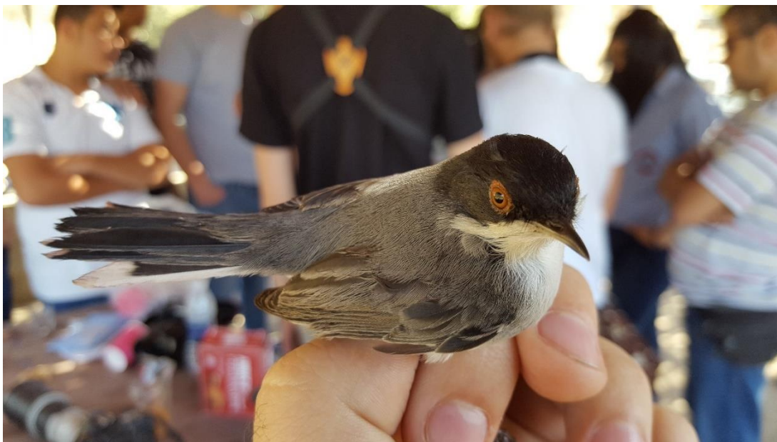
Male Sardinian Warbler partaking in the Bird Camp educative demonstrations.