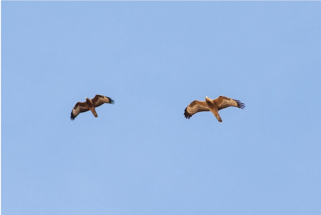
Handsome 1cy Honey Buzzards passing overhead on the Mount Lebanon ridge. Not shot at.