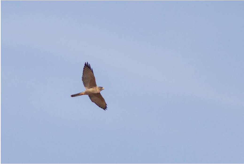
Levant Sparrowhawk passing by in singles or smaller groups.

Eurasian Sparrowhawk ( Accipiter nisus )