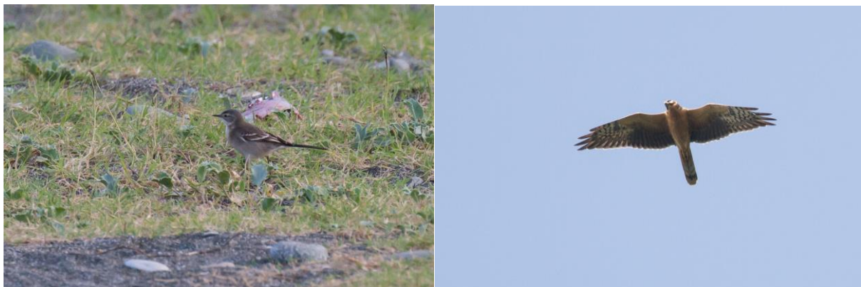
Citrine Wagtail and Pallid Harrier. Eastern delights