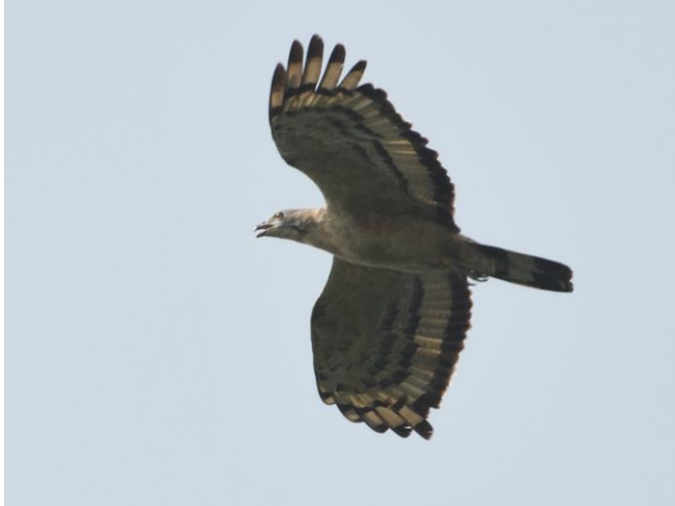
Male Crested Honey Buzzard passing over station 1.