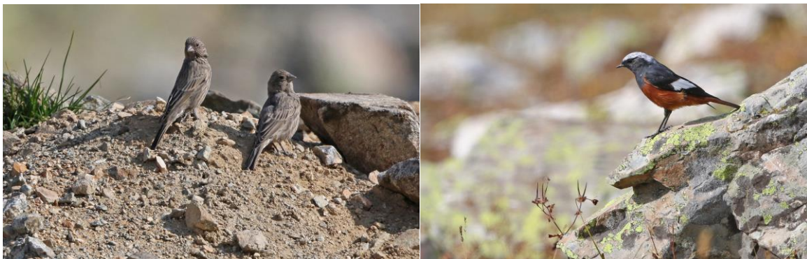
Great Rosefinches and Güldenstädt's Redstart – target species of the Greater Caucasus.

but were not lucky. We returned to the valley floor and had some lunch scanning the ridges for vultures and raptors. In an hour we had three Lammergeiers, several Griffon Vultures and a pair of Golden Eagles. Also migrating flocks of Bee-eaters and a female Siberian Stonechat in a paddock.