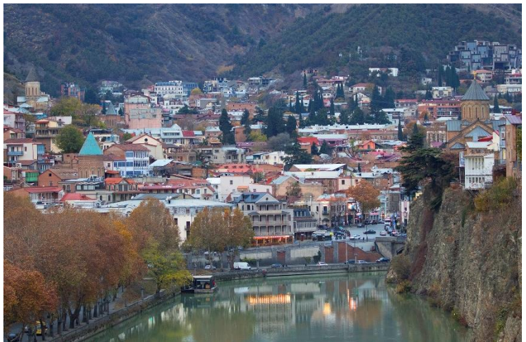
Old Tbilisi from Hotel Terrace

Day 7 | 9 th December 2019: Today we had mainly a travel day to Azerbaijan. In the morning before breakfast the group has settled in the hotel's terrace to photograph flying gulls and other birds, which are wealthy at this part of the Kura River, just a few hundred meters away from popular and touristy old town. After breakfast we loaded our luggage to the vehicle and ventured to the border. About one hour drive and we arrived to the customs, where Layla Muslim met us at the Georgian side of the border. Leyla is local Azerbaijani birder, engaged in the annual bird counts at the Besh Barmag Migration Bottleneck and representing also the Nature Friends organization. She is one of not many young enthusiasts, nowadays raising in Azerbaijan as a future nature conservation leaders and good birders.