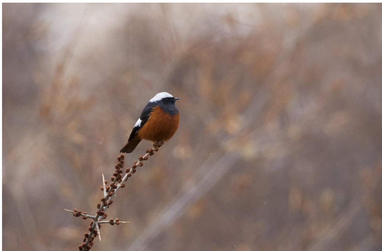
Güldenstädt's Redstart Phoenicurus erythrogastrus