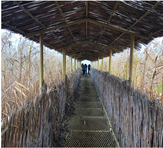
Flamingo Lake Viewpoint

had to come later for Barn Owl photography. Approximately two hours later group returned back with incredible close up pictures of Black Francolins. As explained, they had several individuals on very close range. Cool pictures in very deed. Waiting a Barn Owl took us about an hour. It was already dark when we first heard them puffing from a hole in the roof, where they live. Soon three Barn Owls popped up one by one and started flying around for a few minutes, before finally landed in a tree in front of the building. Since the targets were in dark, I was asked to use a torchlight, but in respect of conservation concept and considering we were in the national park, I had to refuse. Surprisingly, this decision disappointed some of the group mates, so the only chance they had is to play with settings and use some of the night photography tricks. Of course, the photographs made in such challenging conditions would not be perfect, but conceptually absolutely fine. On the drive back to the entry gate, we saw some nice rodent - Small Five-toed Jerboa Allactaga elater , an interesting observation for everyone.