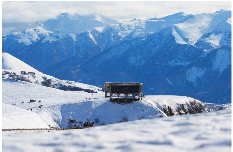
Friendship Monument, Gudauri