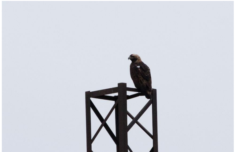
Eastern Imperial Eagle

Spending almost two hours in the hide it didn't really brought any results. We could see two eagles seating on the pylon about five hundred meters away, but they have not taken any broad flight, but rather moved only on short distances from one pylon to another. It was already late lunch o'clock and we all walked to our vehicle to eat. During lunch we discussed about changing photography method and it was decided to try first driving as closer as possible to the bird and shoot from the open windows. We tried it and it worked very well. After an hour try, both birds seemed quite relaxed about us and it was decided to try on walk, so what we actually did; we drove and parked our vehicle about two hundred meters away, got out, prepared and made first shots. Then we moved on fifteen meters closer and did same. Then another fifteen meters and so on, until we reached it on thirty/fifty meters distance. When everyone got enough pictures of seating bird, we stayed quietly and waited until bird would spread the wings to shoot it in flight. That was probably a last and one of the most successful captures of today. We all agreed on completion of the daily task and headed back to hotel for longer rest before dinner. On the way back we could again spot big flock of about one thousand Little Bustards murmuring above the same place we had them yesterday.