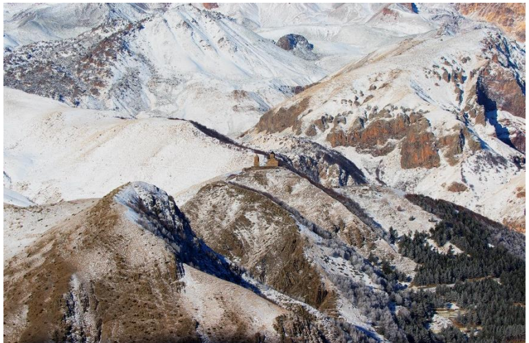
Gergeti Trinity Church 2170 m