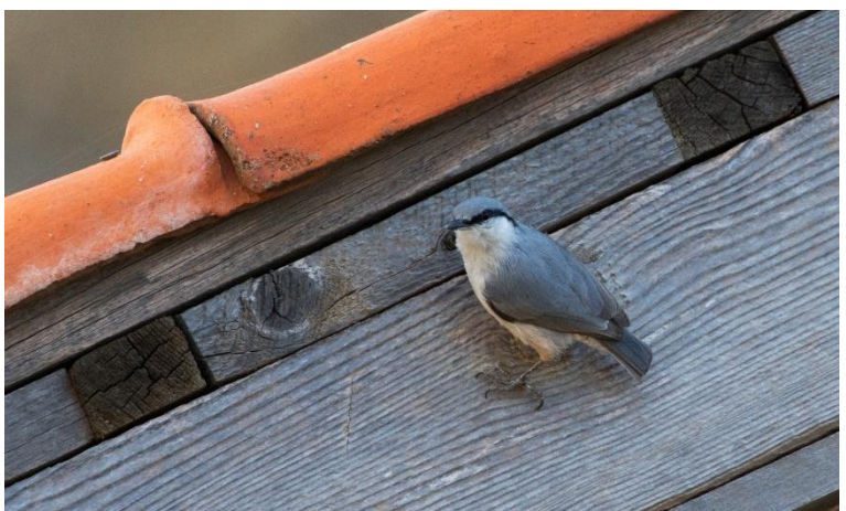
Western Rock Nuthatch

Our lunch did not last for long, but it was rather quick snacking and the rest of the group has also rushed back to the monastery yard. A few tens or why not hundreds of more shots of Nuthatch and Wallcreeper were made, when group has finally felt satisfied with workshop results and we have relocated lower down to the scrubby patch outside the monastery, where some other nice targets awaited us here; a flock of about fifty Red-fronted Serins, couple of Hawfinches, Rock Bunting, Rock Sparrow and European Robin, that has so much excited the group, because they do not have this common representative of the European fauna back in China and for most of the group mates this bird was a lifer. Over two hours we spent here photographing these different birds and left the monastery only in the late evening. On the way to Tbilisi we did also visit the lake, a big water body between