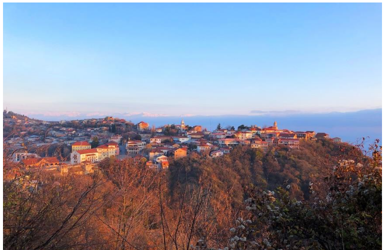
Sighnaghi Town 836 m

Day 4 | 6 th December 2019: Today we had slightly earlier breakfast, since we had to make a long drive to the nature reserve along the border with Azerbaijan. A lot promising, nice and sunny day, still a bit chilly in the morning, but much warmer during the day, than in the Greater Caucasus. Some small birds were seen in the backyard of our hotel during breakfast, including Greenfinches, Goldfinches, Hawfinches and one Lesser Spotted Woodpecker pecking on a tree in front of the hotel's restaurant. We set off at yet first morning light to photograph Sighnaghi town on the way. Beautiful scenery indeed, with clean blue sky and clear views of the Greater Caucasus Mountains on a background.