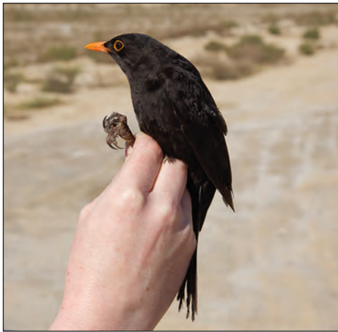
Plate 16. Common Blackbird Turdus merula 23 January 2015, Sabkhat Al Fasl, Jubail, Eastern province, Saudi Arabia.

Shrikes Lanius (meridionalis) pallidirostris WF 11 Apr was a good count. A Black Drongo Dicrurus macrocercus Dubai 8 Apr. The second Ashy Drongo D. leucophaeus of the winter was seen in Mamzar park 4 Jan (although reported by a non-birder at least one week prior to this); the same, or possibly a different bird, was still present 13 Feb. A Mesopotamian Crow Corvus (cornix) capellanus photographed at Khor al Beida 1 Mar; although not seen last winter this may be the original bird from 2012–13. Flocks of Hypocoliuses Hypocolius ampelinus remained at Sir Bani Yas (up to 61) and Lulu island (up to 130) throughout February, with smaller numbers Delma island. The latest ever Calandra Lark Melanocorypha calandra WF 9 May. Two Wire-tailed Swallows Hirundo smithii Warsan 7 Feb with one remaining until 27th. A Savi's Warbler Locustella luscinioides WF 28 Mar and another Sila 3 Apr. A Ring Ouzel Turdus torquata Jebel Hafeet 10–22 Jan. A European Robin Erithacus rubecula Safa park 13 Feb while up to four White-throated Robins Irania gutturalis Mamzar park with singles at other locations during an influx of migrants after a severe dust-storm 3 Apr.