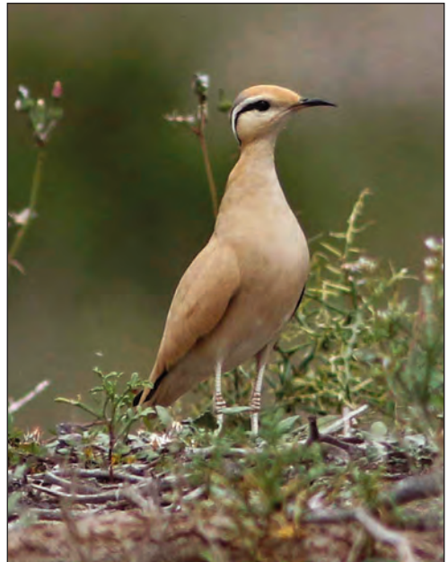
Plate 5. Cream-coloured Courser Cursorius cursor 8 April 2015, Lady's Mile, Cyprus. © Rajja Howard