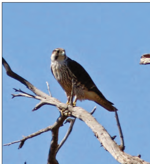
Plate 1. 'Tundra' Peregrine Falco peregrinus calidus (juvenile) 5 March 2015 Akrotiri GP, Cyprus.

One Baillon's Crake Porzana pusilla Zakaki marsh 15–28 Mar and 8–11 Apr (Plate 3). Demoiselle Crane Anthropoides virgo is usually rare in spring but three at Akrotiri GP 13 Mar while 32 Goudi 16 Mar, 27 Lady's Mile 21 Mar and four Lady's Mile 1 Apr. One Eurasian Oystercatcher Haematopus ostralegus Spiros beach 28 Mar (fewer than 20 records in last ten years). A male Caspian Plover Charadrius asiaticus Mandria 9–18 Apr (34th record). One Eurasian Dotterel Charadrius morinellus Akrotiri salt lake 11 Apr, up to four Larnaca desalination fields 11–16 Apr, two Lady's Mile 13 Apr, one Mandria 14–18 Apr (Plate 4); species not recorded every year.