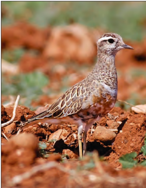
Plate 4. Eurasian Dotterel Charadrius morinellus 15 April 2015, Mandria beach, Cyprus.