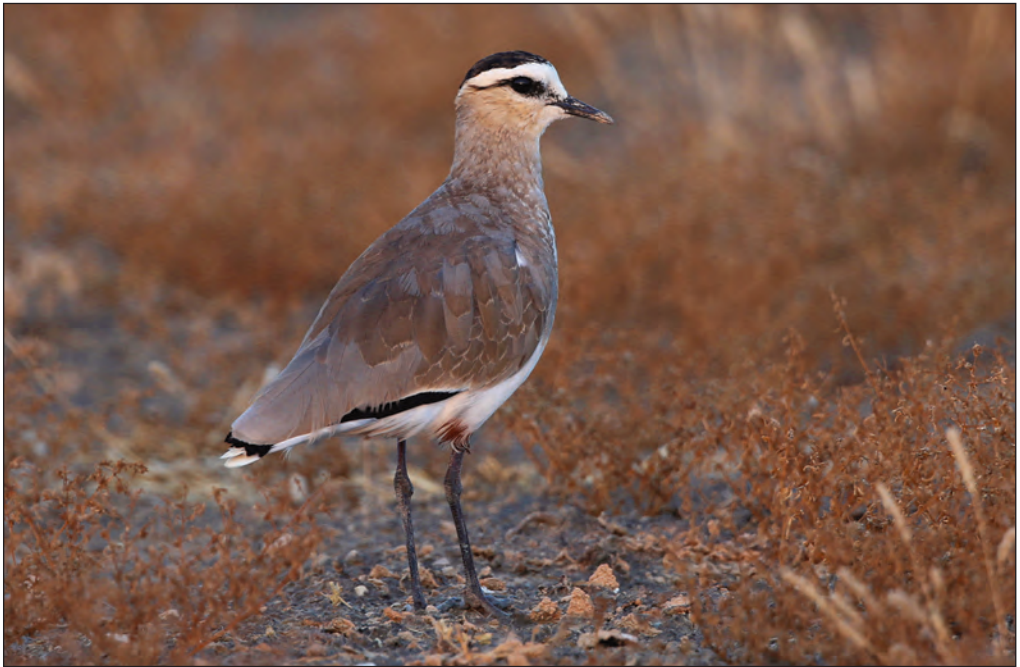
Plate 12. Sociable Lapwing Vanellus gregarius 7 January 2015, Salalah, Oman.

Khabbah. First record Eleonora's Falcon Falco eleonora , Jarziz farm 12 Jun. A Lanner Falcon Falco biarmicus Al Balid farm 9 and 21 Jan.