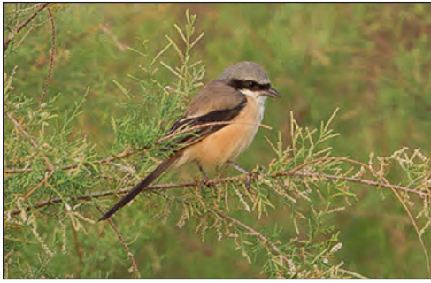
Plate 14. Long-tailed Shrike Lanius schach 4 April 2015, Dhahran Hills golf course, Dhahran, Eastern province, Saudi Arabia.

Four Eurasian Penduline Tits Remiz pendulinus SAF 5 Dec 2014 with two more Ash Shargiyah Development Company farm, Fadhili 27 Mar. A probable breeding pair of Thick-billed Larks Ramphocoris clotbey Riyadh area 1 May. First breeding Barn Swallows Hirundo rustica for Arabia were found at Al Hayer, near Riyadh, in February with a total of 13 nests. A Siberian Chiffchaff Phylloscopus (collybita) tristis trapped and ringed SAF 23 Jan. One Common Grasshopper Warbler Locustella naevia trapped and ringed SAF 27 Mar (Plate 15) while a Sardinian Warbler Sylvia melanocephala Haql 23 Feb. An adult male Common Blackbird Turdus merula trapped and ringed SAF 23 Jan (Plate 16) and remained until 20 Feb with another present at the same site 31 Jan. Male Collared Flycatcher Ficedula albicollis near Tabuk 11 April, a rare vagrant to western Saudi Arabia. An immature White-crowned Wheatear Oenanthe leucopyga KAUST 16 May. Both Kurdistan Wheatear Oenanthe xanthopyrma and Red-tailed Wheatear Oenanthe chrysopygia were at Wadi Rabigh 23 Jan. Two Arabian Golden-winged Grosbeaks Rhynchostruthus percivali near Taif 11 Jan and a single Eurasian Siskin Spinus spinus was on a farm just south of Tabuk 22 Feb.