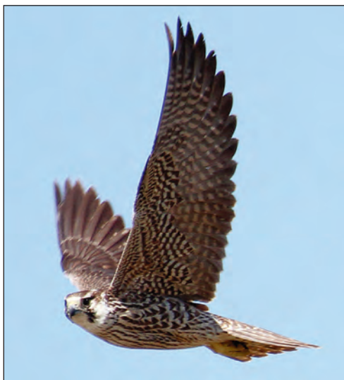
Plate 2. 'Tundra' Peregrine Falco peregrinus calidus (juvenile) 22 March 2015 Akrotiri GP, Cyprus.