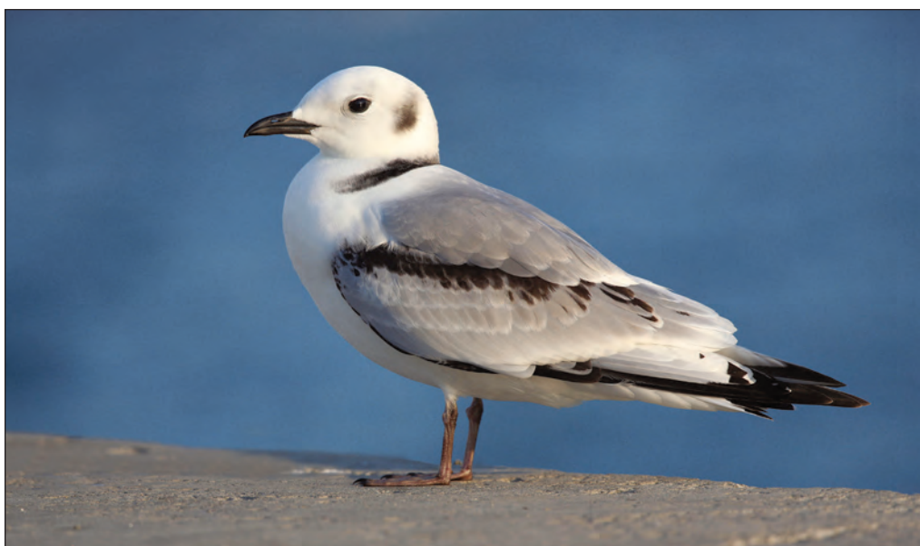
Plate 6. Black-legged Kittiwake Rissa tridactyla 6 December 2014, Larnaca, Cyprus.

A Red Knot Calidris canutus Lady's Mile 16 May. Record number of Bar-tailed Godwits Limosa lapponica (32) Akrotiri salt lake 26 Apr with two remaining at nearby Lady's Mile to 4 May; all previous records have been singles or pairs (25th record). 18 Whimbrels Numenius phaeopus Lady's Mile 2 Apr, a record number of this scarce migrant. A Cream-coloured Courser Cursorius cursor Lady's Mile 31 Mar–10 Apr (Plate 5) with different bird there 28 Apr; this species is a less than annual spring migrant. c200 Collared Pratincoles Glareola pratincola over Zakaki marsh 20 Apr, a noteworthy number while a Black-winged Pratincole Glareola nordmanni was at Akrotiri salt lake 28 Apr (38th record since 1993). The seventh record of Black-legged Kittiwake Rissa tridactyla still present Larnaca until 4 Jan (Plate 6). Fourth record of Pomarine Skua Stercorarius pomarinus Curium bay, Akrotiri peninsula, 21 May while one Arctic Skua S. parasiticus off cape Greco 29 Mar and one Mandria 9 Apr (fewer than 50 records since 1957).