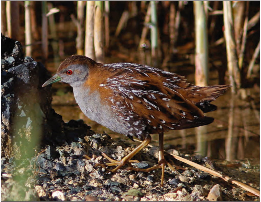
Plate 3. Baillon's Crake Porzana pusilla 10 April 2015, Zakaki marsh, Cyprus.