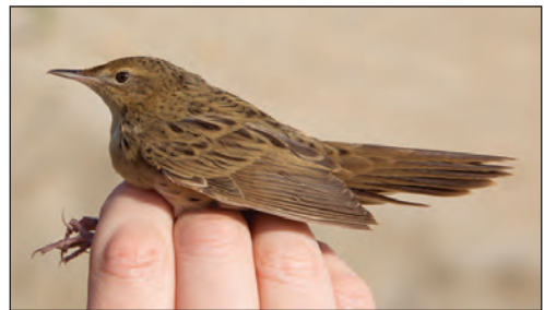
Plate 15. Common Grasshopper Warbler Locustella naevia 27 March 2015, Sabkhat Al Fasl, Jubail, Eastern province, Saudi Arabia.

As many as three Corncrakes Crex crex Al Qudra on several dates early May to the 9th. One Little Crake Porzana parva Al Wathba lake 20 Mar. Asian Koels Eudynamis scolopacea Safa park 5 Feb and another two days later Mamzar park with a third Jebel Dhanna 20 Mar. Several Eurasian Scops Owls Otus scops in several locations 20–21 Mar while Short-eared Owls Asio flammeus recorded Sharjah 27 Feb, Bhalghelam island 20 Mar and over Abu Dhabi 18 Apr. Two Little Swifts Apus affinis Delma island 30–31 Jan while a single over Al Ain 13 Mar. A European Bee-eater Merops apiaster Dubai PF 3 Jan. Nine Steppe Grey