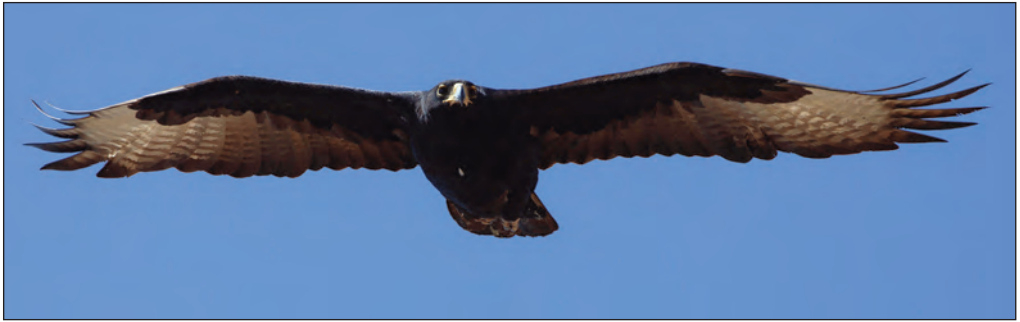
Plate 11. Verreaux's Eagle Aquila verreauxii 8 February 2015, Jebel Samhan, Oman.