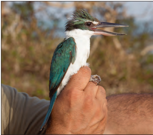
Plate 15. Collared Kingfisher Todirhamphus chloris 29 June 2015, Al Qahma, Jizan province, Saudi Arabia.