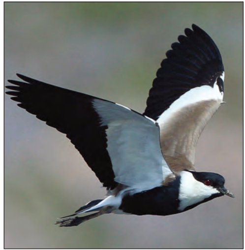
Plate 6. Spur-winged Lapwing Vanellus spinosus 3 November 2015, Raysut, Oman.

17 Nov–30 Dec. First record Brahminy Kite Haliastur indus Wadi Darbat 20 Nov. Long-legged Buzzard Buteo rufinus Dawkah farm 28 Aug. Amur Falcons Falco amurensis Shelim 13 Nov (Plate 3), Hilf 15 Nov, Jarziz farm 10 Dec (Plate 4).