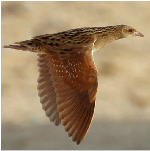
Plate 5. Corncrake Crex crex | September 2015, Al Ghaftayn, Oman.