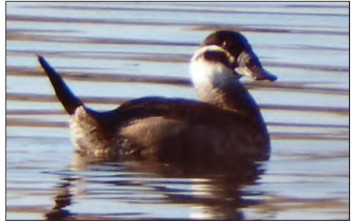
Plate 1. White-headed Duck Oxyura leucocephala 21 December 2015, Oroklini marsh, Cyprus.

First Red-breasted Goose Branta ruficollis since 2002 (eighth record) Larnaca sewage works 4–23 Nov. A Ruddy Shelduck Tadorna ferruginea Zakaki marsh 15 and 22 Aug first August record. Also one Bishop's pool 17 Aug and one Oroklini lake 3–6 Nov. Another Larnaca sewage works 22 Sep—at least 24 Nov, two there 14–21 Dec and two eastern Mesaoria 10 Dec. One Red-crested Pochard Netta rufina Oroklini marsh 3 Nov (rare migrant, recent