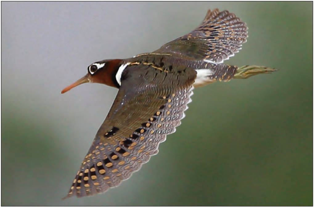
Plate 7. Greater Painted-snipe Rostratula benghalensis 28 August 2015, Raysut, Oman.