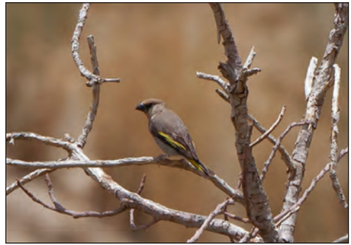
Plate 17. Arabian Golden-winged Grosbeak Rhynchostruthus percivali 3 July, near Bani Saad, Mecca province, Saudi Arabia.

Four Blanford's Short-toed Larks Calandrella blanfordi Sallal Al Dahna, near Tanoumah, 1 Sep. Two ' mangrove ' white-eye sp ( Zosterops abyssinicus ?) Either mangroves,