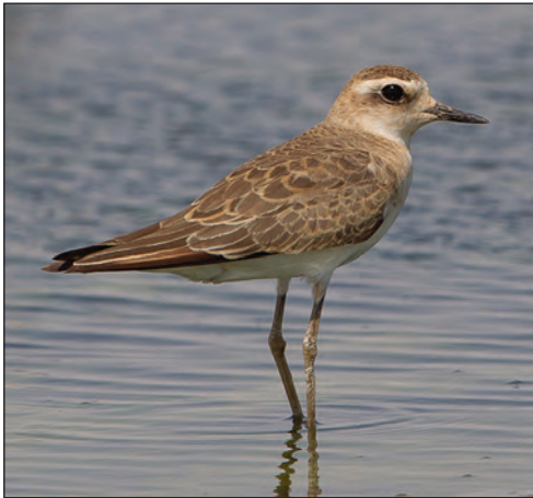
Plate 13. Caspian Plover Charadrius asiaticus 28 August 2015, Sabkhat Al Fasl, Jubail, Eastern province, Saudi Arabia.