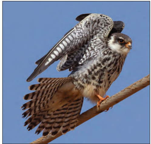
Plate 3. Amur Falcon Falco amurensis 13 November 2015, Shelim, Oman.

One Lesser Flamingo Phoeniconaias minor Khawr Rawri 26 Dec and seven there 28 Dec are seventh record. One Black Stork Ciconia nigra Wadi Baqlat 10–17 Nov and one Wadi Darbat 17 and 25 Nov. Abdim's Storks C. abdimii Raysut STP from 27 Oct (max 625 on 20 Nov) while 500 over Salalah 9 Dec. An African Sacred Ibis Threskiornis aethiopicus Qatbit 2 Dec. 80 Glossy Ibises Plegadis falcinellus Al Baleed 19 Sep and 90 East Khawr 19 Oct. A juvenile Little Bittern Ixobrychus minutus Al Ghaftayn, central desert, 1 Sep. A Yellow Bittern I. sinensis Al Qurm park 22 Oct (very rare north). 15 Indian Pond Herons Ardeola grayii Al Baleed park 21 Oct, an unusually high number. Intermediate Egrets Egretta intermedia Al Ansab wetland (up to two, Jul–Dec), one central desert 12 Sep (Dawqah farm) and in the south (Al Baleed, Khawr Rawri, Raysut, Al Mughsayl) up to two Nov–Dec). 2000 Great Cormorants Phalacrocorax carbo 20 Nov Al Qurm beach. 17 Western Ospreys Pandion haliaetus Raysut 6 Dec. Two adult Black-winged Kites Elanus caeruleus Barka 19 Oct. 260 Egyptian Vultures