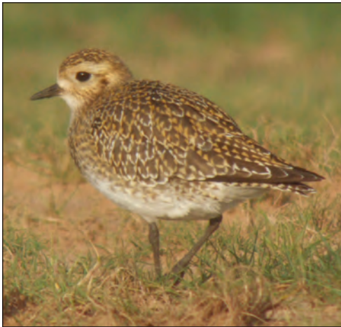
Plate 21. Eurasian Golden Plover Vanellus apricaria 27 November 2015, Hamanriyah, United Arab Emirates.