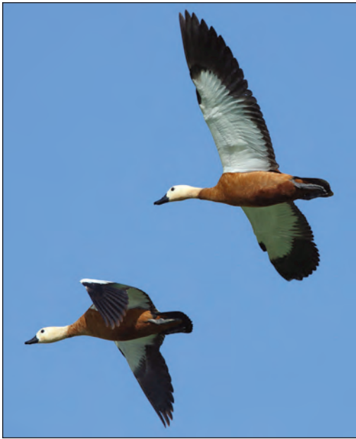
Plate 2. Ruddy Shelducks Tadorna ferruginea 6 December 2015, Raysut, Oman.

Rasas 28 Sep. 103 Little Grebes Tachybaptus ruficollis Al Ansab wetland 4 Sep and 84 there 4 Nov with three Black-necked Grebes Podiceps nigricollis .