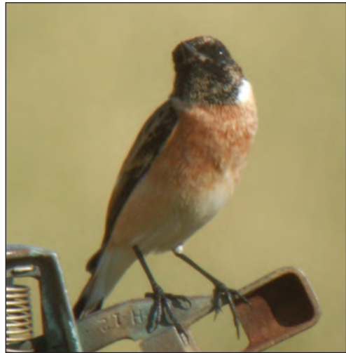
Plate 22. Caspian Stonechat Saxicola [torquatus] maurus hemprichii 27 November 2015, Wamm Farms, United Arab Emirates.

clanga Ras al Khor, Dubai, 26 Dec. Single Amur Falcons Falco amurensis WF 3 Jul (three 4 Jul) and 13 Nov. Corncrakes Crex crex Abu Dhabi 11 Oct and Al Ain 16 Oct. One Spur-winged Lapwing Vanellus spinosus Mafrag 21–28 Nov (Plate 20, 7th record and first since 2011), a Eurasian Golden Plover V. apricaria Hamranayah 21–28 Nov (Plate 21) and three Caspian Plovers Charadrius asiaticus there 12 Sep. Third record Pheasant-tailed Jacana Hydrophasianus chirurgus Al Qudra 29–31 Oct. One Little Gull Hydrocoloeus minutus Fujairah 15 Nov (16th record). An Oriental Turtle Dove Streptopelia orientalis WF 26 Sep–early Oct and another there 17 Oct. UAE's fourth Pied Cuckoo Oxylophus jacobinus WF 4 Jul.