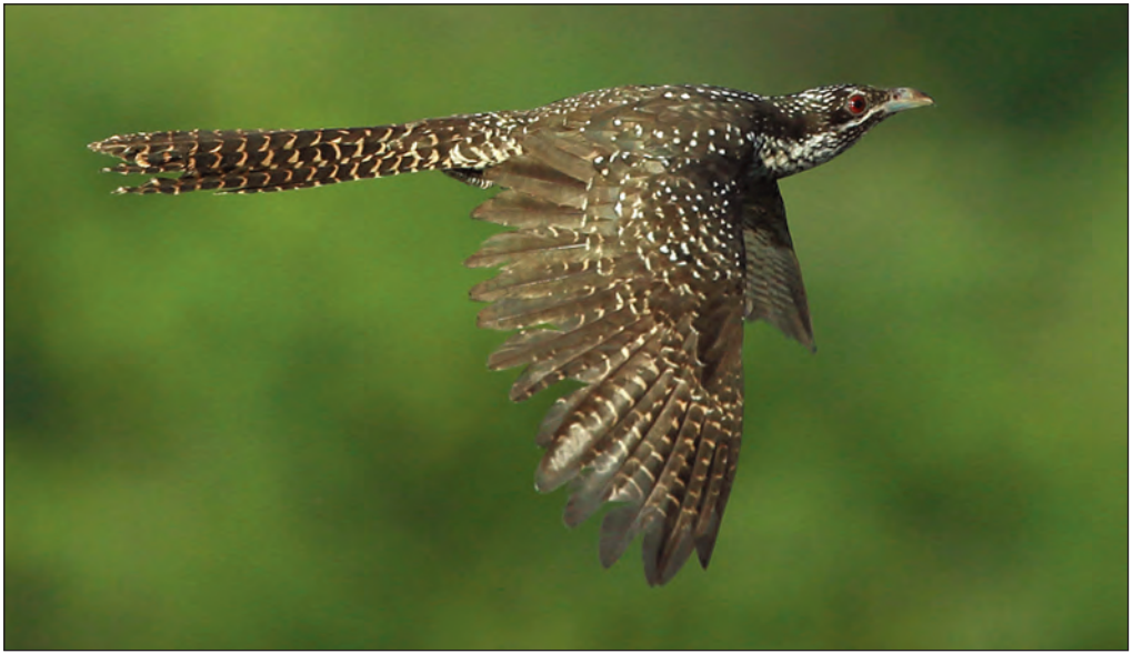
Plate 10. Asian Koel Eudynamis scolopaceus 13 December 2015, Hilf, Masirah Island, Oman.

Khawr Rawri 25 Oct–at least 12 Jan 2016 (tenth record). 75 Blue-cheeked Bee-eaters Merops persicus Khawr Rawri 1 Nov was a late date. 14 Eurasian Hoopoes Upupa epops Dawqah farm 11 Sep, 22 there 22 Sep, 13 Sallan 24 Oct and 19 there 21 Nov, one Damaniyat islands 6 Sep. Four Eurasian Wrynecks Jynx torquilla Dawqah farm 22 Sep was highest autumn number.