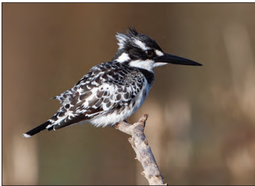
Plate 16. Pied Kingfisher Ceryle rudis 13 November 2015, Sabkhat Al Fasl, Jubail, Eastern province, Saudi Arabia.

Najran northwards to Taif, indicating that it may be much commoner than previously realised. One White-throated Kingfisher Halcyon smyrnensis SAF 14 Aug–27 Nov at least (possibly one that wintered into 2015 remaining through summer). Another Rabigh dam 11 Dec. Nine Collared Kingfishers Todirhamphus chloris trapped and ringed in a small area of Al Qahma mangroves 29 Jun (Plate 15). A female Pied Kingfisher Ceryle rudis SAF 23 Oct, numbers increasing there to 12 by 5 Dec. Four remained until at least 31 Dec (Plate 16). Three Al Hyer 16 Dec and one Al Kharj 30 Dec.