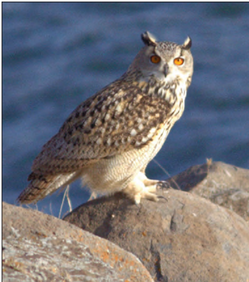
Plate 19. Eurasian Eagle Owl Bubo bubo possibly omissus 28 November 2015, lake Çıldır, Ardahan, Turkey.

A Eurasian Eagle Owl Bubo bubo , possibly omissus , Çıldır Gölü 28 Nov (Plate 19)—it might have arrived from Central Asia or Iran. 1200 Blue-cheeked Bee-eaters Merops