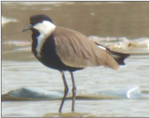
Plate 20. Spur-winged Lapwing Vanellus spinosus 21 November 2015, Mafrag, United Arab Emirates.