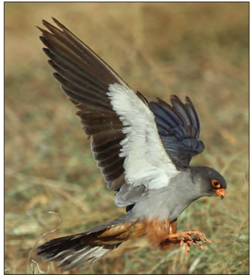
Plate 4. Amur Falcon Falco amurensis 10 December 2015, Jarziz farm, Salalah, Oman.

Neophron percnopterus Fahud 2 Oct. Crested Honey Buzzards Pernis ptilorhynchus East Khawr park 26 Nov (two)–30 Dec (one), max four 10 Dec. One Eurasian Griffon Vulture Gyps fulvus Tawi Atayr 10 Nov, five Wadi Darbat 25 Nov, two Raysut STP 26 Nov and four Al Mazyunah 28 Nov. 14 Lappet-faced Vultures Torgos tracheliotus Al Mazyunah 28 Nov. A fulvescens Greater Spotted Eagle Clanga clanga Raysut STP 3 Nov and 12 Al Ansab wetland 16 Dec. Two Yellow-billed Kites Milvus aegyptius East Khawr park area