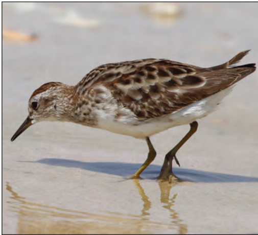
Plate 8. Long-toed Stint Calidris subminuta 4 November 2015, East Khawr, Salalah, Oman.