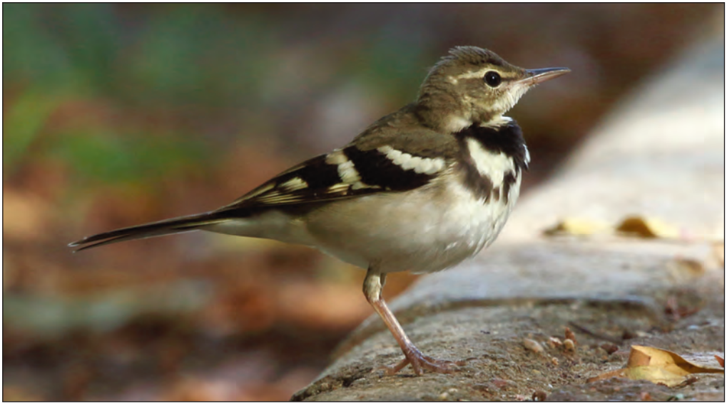
Plate 11. Forest Wagtail Dendronanthus indicus 5 December 2015, East Khawr park, Salalah, Oman.

and 4 Dec, two Qatbit 2 Dec, two Shisr 4 Dec. First record Eurasian Tree Sparrow Passer montanus Sohar 11 Dec. 50 Yellow-throated Sparrows Gymnoris xanthocollis Muscat 27 Jul. 1000 Rüppell's Weavers Ploceus galbula Al Baleed park 21 Oct was a high concentration. One Forest Wagtail Dendronanthus indicus Qatbit 14–21 Nov and one East Khawr park 21 Nov—at least 12 Jan 2016 (Plate 11, 10th & 11th records). An Eastern Yellow Wagtail Motacilla (flava) tsutschensis Khawr Rawri 1 Nov (sixth record). A Masked Wagtail M. (alba) personata Fahud 2 Oct while fourth record Amur Wagtail M. (alba) leucopsis Sohar 15 Sep. Single Richard's Pipits Anthus richardi Al Mazyounah STP 24 Oct, Al Fazyah 29 Dec. Three Trumpeter Finches Bucanetes githagineus Al Mazyounah STP 23 Nov. Ninth record Eurasian Siskin Spinus spinus Dawkah farm 14 Nov. An Eastern Cinereous Bunting Emberiza (cinerea) semenowi Al Ghaftayn 15 Sep. Ortolan Buntings E. hortulana several locations central desert from 16 Sep, max 25 Dawqah farm 27 Oct. A Little Bunting E. pusilla Shisr 23 Nov and Black-headed Buntings E. melanocephala Qatbit 16 Sep (two) and one there 22 Sep, Fahud 2 Oct and Shisr 4 Dec.