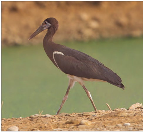
Plate 12. Abdim's Stork Ciconia abdimii 30 June 2015, Sabya waste water lagoons, Jizan province, Saudi Arabia.