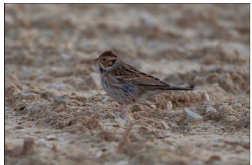
Plate 18. Little Bunting Emberiza pusilla 19 December 2015, Sabkhat Al Fasl, Jubail, Eastern province, Saudi Arabia.

Jizan province, 26 Jun (one trapped and ringed). Also, two Al Qahma mangroves 28 Jun. A European Robin Erithacus rubecula SAF from 1 Dec with second bird there 9 Dec (both birds remained until at least 31 Dec). A Thrush Nightingale Luscinia luscinia there 2 Oct. Up to five White-throated Robins Irania gutturalis KAUST late Aug, an unusual record from this locality. One Collared Flycatcher Ficedula albicollis Al Mefah park, Tanoumah, 1 Sep (species still regarded as a vagrant). A number of sightings of Arabian endemic subspecies of African Pipit Anthus cinnamomeus eximius at a location June–September first confirmed records since 1990. Three Arabian Golden-winged Grosbeaks Rhynchostruthus percivali , two adults and a juvenile, near Bani Saad 3 Jul (Plate 17) until late Jul with five birds nearby late Jul. One Little Bunting Emberiza pusilla SAF 19 Dec (Plate 18) second record Eastern province.