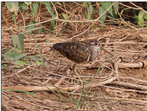
Plate 14. Greater Painted-snipe Rostratula benghalensis 30 June 2015, Sabya waste water lagoons, Jizan province, Saudi Arabia.