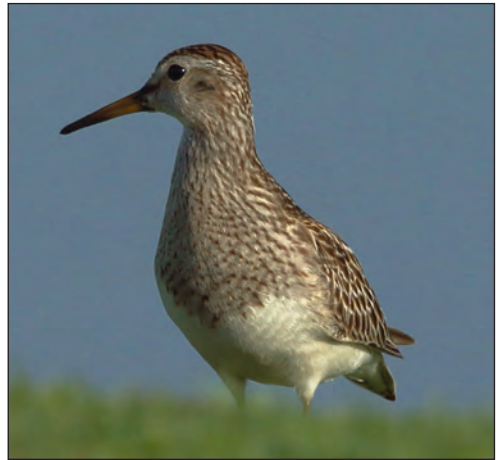
Plate 9. Pectoral Sandpiper Calidris melanotos 18 November 2015, Muscat, Oman.

jacobinus Al Ghaftayn 21 Nov. Asian Koel Eudynamis scolopaceus records away from Masirah island (Plate 10) included Dawqah farm 14 Nov, Mudhay 4 Dec, Taqah 23 Dec. Third record Common Hawk-cuckoo Hierococcyx varius Shisr 15 Nov. Eurasian Scops Owls Otus scops Al Ghaftayn 15–16 Sep, Qatbit 18 Sep, Dawqah farm 22 Sep. One Short-eared Owl Asio flammeus East Khawr 19 Nov. 14 European Nightjars Caprimulgus europaeus Qatbit and