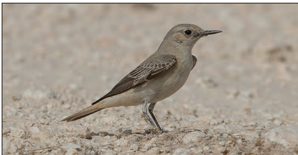
Plate 16. Hooded Wheatear Oenanthe monacha 2 March 2018, Jebal Hamrah, Judah, Eastern province, Saudi Arabia.

Up to 12 Arabian Magpies Pica asirensis near Tanoumah late May–late Jun with two further birds seen, plus two old nests, near A'Namas. Eight Bimaculated Larks Melanocorypha bimaculata in a pivot field near Jebel Hamrah, Judah, 9 Mar (Plate 15). Up to thirty ' Arabian Red-capped Larks ' Calandrella [blanfordi] eremica Talea valley 16 Jun including adults with young. Two very early Savi's Warblers Locustella luscinioides trapped and ringed Sabkhat Al Fasl 23 Feb. An adult Rose-coloured Starling Pastor roseus Al Asfar lake, Hufuf, 21 Apr with three adults A'Shargiyah Development Company farm, Fadhili, 27 Apr and another adult on Al Khbar corniche 19 Jun. A Common Blackbird Turdus merula Al Jouf 16 Jan. A pair of Black Scrub Robins Cercotrichas podobe Munaizilah STP, near Hofuf 14 Jan, another species that appears to have colonised the Eastern province over the last few years. A female Hooded Wheatear Oenanthe monacha Jebal Hamrah, Judah, 16 Feb with a different female in the same general area but at a different location 2–9 Mar (Plate 16). A male Kurdistan Wheatear O. [x.] xanthoprymna KAUST 5 Mar (first for location). A Yellow-throated Sparrow Gymnoris xanthocollis Dhahran corniche 16 Apr. Four African Pipits Anthus cinnamomeus eximius Al Mefah park, Tanoumah 4 May and seen collecting food 26 May with two further birds A'Namas 27 May, the furthest