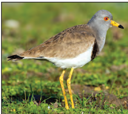
Plate 17. Grey-headed Lapwing Vanellus cinereus 11 March 2018 Samsun, Kızılırmak delta, Turkey.

Lesser Kestrel Falco naumanni Göksu delta 7 Jan. A Baillon’s Crane Zapornia pusilla Milleyha, Hatay 31 Mar–13 Apr (rarely recorded). The first record for Turkey and the second for the OSME region of Grey-headed Lapwing Vanellus cinereus 11 Mar Samsun, Kızılırmak delta (Plates 17, 18). Four Black-winged Pratincoles Glareola nordmanni 28 Apr Milleyha, Hatay, confirms the rare passage of the species in spring. First record of Great Black-backed Gull Larus marinus for this site occurred 31 Mar, with another single 26 Jan, Küçükçekmece, İstanbul.