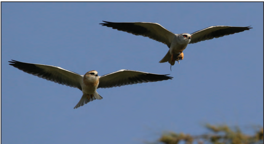
Plate 11. Black-winged Kites Elanus caeruleus , adult carrying food, closely followed by juvenile, 9 May 2018, near Madaba, Jordan.

A Lesser White-fronted Goose Anser erythropus spent some months in the Aqaba–Eilat area 20 Feb–4 May including Aqaba bird observatory (ABO) (first record). Further records of Black-winged Kites Elanus caeruleus in the Jordan valley including Safi (southern Jordan valley) and Madaba with a pair there 1 May with three newly fledged juveniles (Plate 11); now regular and breeding at a few sites. A 2cy Crested Honey Buzzard Pernis ptilorhynchus 11 Mar and an adult female 5 May both ABO (fourth & fifth records).