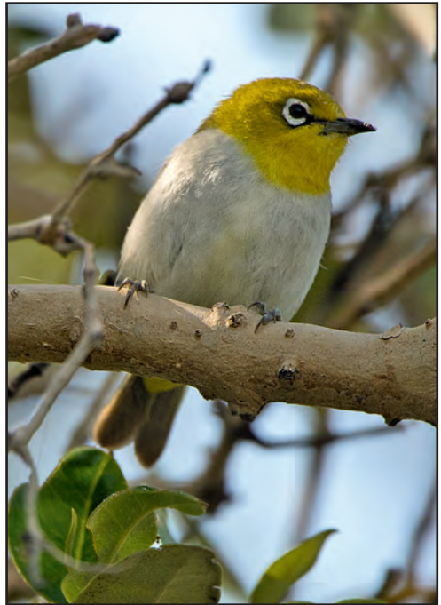
Plate 9. Oriental White-eye Zosterops palpebrosus 24 January 2018, Khalathi creek, Hormozgan, Iran.

Larks Alaudala raytal Golshar shore 19 Jan, ten Kolagh Kashi 20 Jan, rather common Tiab 21 Jan, common Azini creek harbour 22 Jan. Ten Hypocolius Hypocolius ampelinus Bishapur 10