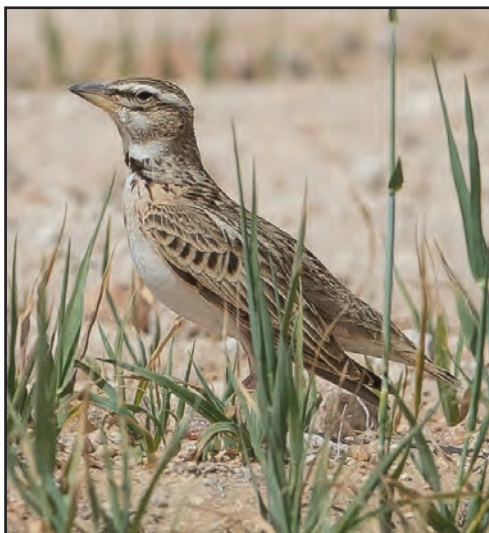
Plate 15. Bimaculated Lark Melanocorypha bimaculata 9 March 2018, Jebal Hamrah, Judah, Eastern province, Saudi Arabia.

Kingfisher Halcyon smyrnensis reported at KAUST in Nov–Dec remained until 25 Feb while one Dhahran early May. Two Pied Kingfishers Ceryle rudis Sabkhat Al Fasl 22 Dec with a female still present 9 Mar and another at KAUST all winter. A Eurasian Hobby Falco subbuteo was only the fourth record for KAUST, 21 Apr. At least two Barbary Falcons Falco peregrinoides were in the Asir mountains 18 Jun, a species that has declined significantly in the last twenty years.