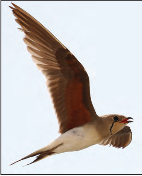
Plate 21. Collared Pratincole Gareola pratincola mobbing 8 June 2018, near Dubai, United Arab Emirates.

one Sila'a 16 Mar (7th–8th records). Seven Eurasian Scops Owls Otus scops at a single site in Al Ain 30–31 Mar was an unusually high number. Intensive survey work added a number of new records of Spotted Eagle Owl Bubo (africanus) milesi in the Hajar mountains, a population only discovered late 2017. Two Egyptian Nightjars Caprimulgus aegyptius Al Wathba 17 Feb, one Lulu island 2 Mar and up to ten throughout May at Ajban. The third record of Red-footed Falcon Falco [v.] vespertinus Al Qudra 22 Apr.