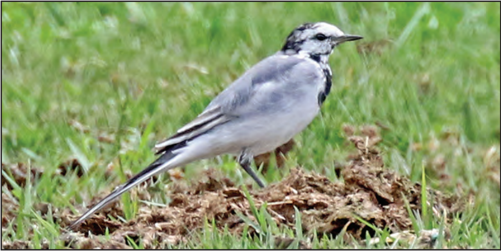
Plate 6. 'Eastern' or 'Siberian' White Wagtail Motacilla alba ocularis , 12 April 2018, Phasouri reedbed, Cyprus.

15 May. Citrine Wagtails Motacilla citreola recorded several dates 19 Feb–14 May, mainly singles, although two males Larnaca STP 2 Apr. An eastern race White Wagtail M. alba ocularis ('East Siberian Wagtail') Phasouri 28 Mar–15 Apr (Plate 6), first record. A Richard's Pipit Anthus richardi Paphos 23 Mar, one Paphos headland 5 Apr with two there 10 Apr. The third record of Blyth's Pipit A. godlewskii Mandria 13–28 Mar. A Tawny Pipit A. campestris Mavrokolymbos dam 5 Jun, a late record. Higher than usual wintering numbers recorded of Bramblings Fringilla montifringilla , Hawfinches Coccothraustes coccothraustes and Eurasian Siskins Spinus spinus with several three figure flocks in Troodos during Mar. A Trumpeter Finch Bucanetes githagineus cape Greco 29 Mar and one Rizokarpaso (Dipkarpaz) rubbish dump 8 Apr. Two Yellowhammers Emberiza citrinella Troodos 25 Feb. A female Western Cinereous Bunting E. cineracea cape Greco 3 May.