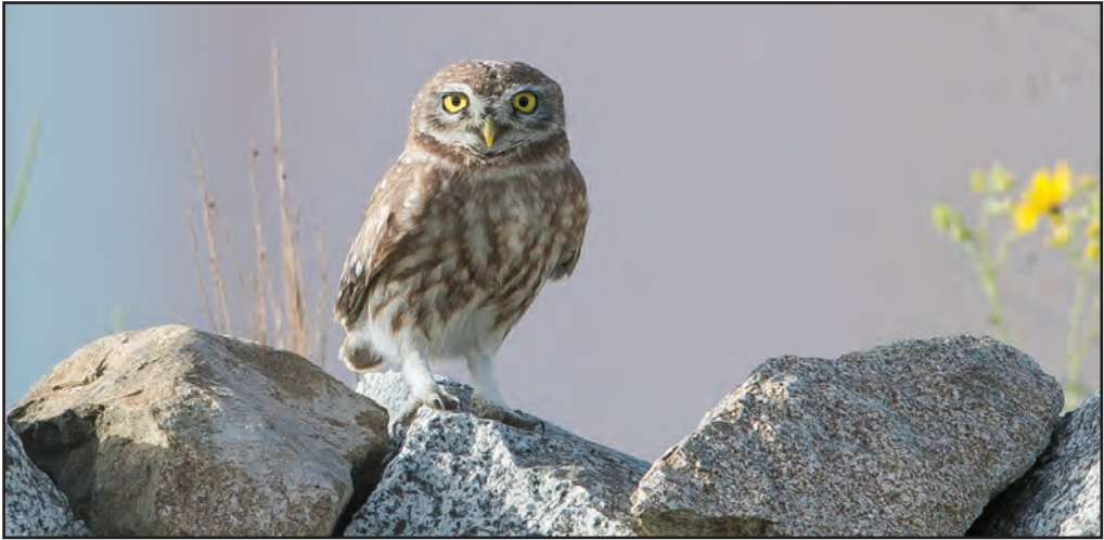
Plate 13. Little Owl Athene (noctua) saharae 26 May 2018, An Namas, Asir province, Saudi Arabia.