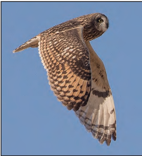
Plate 14. Short-eared Owl Asio flammeus 2 February 2018, Al Asfar lake, Hofuf, Eastern province, Saudi Arabia.

adult and juvenile seen. A Eurasian Stone-curlew Burhinus [o.] oedicephalus Dhahran 8 Mar was the first for the site for more than twenty years. 21 Spur-winged Lapwings Vanellus spinosus Munaizilah STP, near Hofuf 14 Jan, with two birds at Sabkhat Al Fasl intermittently most of the winter and another two at A'Shargiyah Development Company farm, Fadhili, all winter. Three Red-wattled Lapwings V. indicus Munaizilah STP 14 Jan, a further bird at Sabkhat Al Fasl, Jubail 13 Apr and 27 at Shaybah water ponds 9 May.