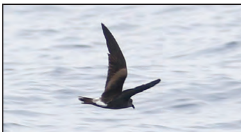
Plate 19. Leach’s Storm Petrel Hydrobates leucorhoa 25 May 2018, 60 km offshore from Kalba, United Arab Emirates.

Four Eastern Greylag Geese Anser a. rubrirostris Saadiyat golf course, 13 Jan–early Mar. 27 Wilson’s Storm Petrels Oceanites oceanicus during a pelagic trip out of Kalba 25 May plus a Leach’s Storm Petrel Hydrobates leucorhoa 60 km offshore (second record, Plate 19, previous being a specimen from 1969). A single Jouanin’s Petrel Bulweria fallax also seen on the same trip. The seventh record of Eastern Cattle Egret Bubulcus [ibis] coromandus Makaniyah farms 23 Apr. The Great White Pelican Pelecanus onocrotalus first seen Ras al Khor 22 Nov 2017 remained in the area until 12 May and another Al Wathba wetland reserve 8 Mar. Black-winged Kites Elanus caeruleus Dubai 13 Jan including a juvenile, one remaining to 8 Jun, and Abu Dhabi 26 Jan and 2 Mar (same bird). A European Honey Buzzard Pernis apivorus Abu Dhabi 26