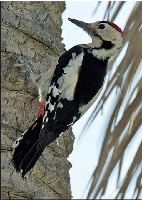
Plate 8. Sind Woodpecker Dendrocopos assimilis , male, 23 January 2018, Asheghan, Hormozgan, Iran.