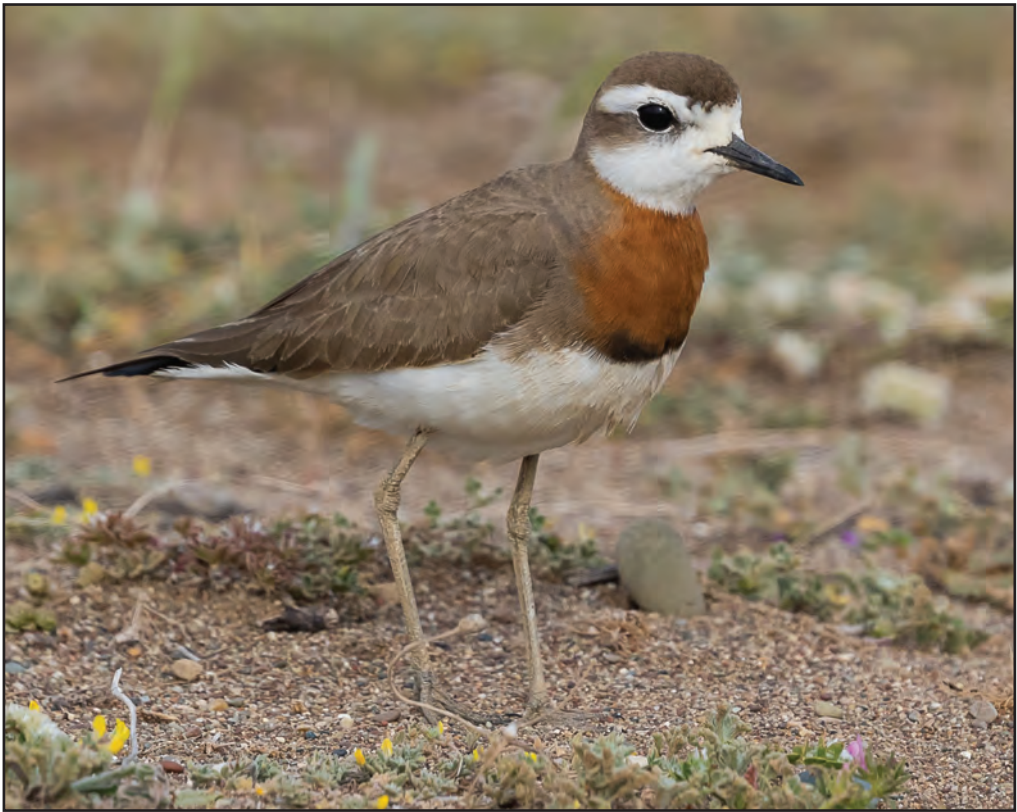
Plate 3. Caspian Plover Charadrius asiaticus 15 March 2018, Mandria (Paphos), Cyprus.

Phasouri reedbed 8 Apr, Episkopi (Paphos) 17 Apr and Polis reedbed 3 May. Three Red-necked Phalaropes Phalaropus lobatus Larnaca airport pools (north) 20–22 Apr, one remaining to 25 Apr and up to four at Akrotiri SL 25–27 Apr with two there 3 May. Two winter records of Marsh Sandpiper Tringa stagnatilis , one at both Kioneli (Gönyeli) and Kanli (Kanlıköy) dams 13 Jan and a late record of 12 Famagusta ((Mağusa) wetland 3 May. A Cream-coloured Courser Cursorius cursor moved east from Timi and Mandria (Paphos) on 23 Mar (Plate 4) to Akrotiri GP 24–26 Mar where possibly the same bird was present 5–8 Apr, with another Larnaca STP 2 Apr.