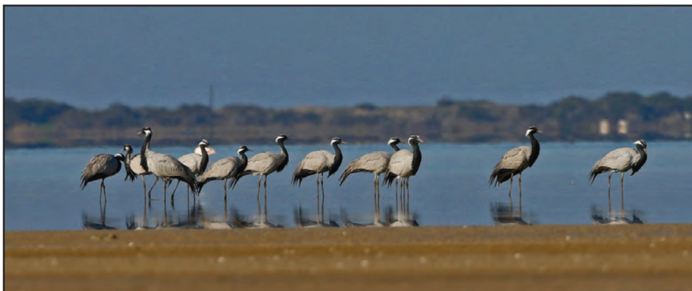
Plate 2. Demoiselle Cranes Grus virgo 11 March 2018, Akrotiri salt lake, Cyprus

Despite drought conditions, a number of interesting wader records. 15 Pied Avocets Recurvirostra avosetta Akrotiri GP and 12 Larnaca airport pools (south) 22 Mar, 12 Spiros pool 2 Apr, 20 Akrotiri GP 29 Apr and two Akrotiri SL 21 May. A Eurasian Dotterel Charadrius morinellus Rizokarpaso (Dipkarpaz) 31 Mar. Two Greater Sand Plovers Anarhynchus leschenaultii Silverbeach 3 Mar, ten Rizokarpaso (Dipkarpaz) 4 Mar, one Spiros pool 8 Jun and one Paphos headland 11 Jun. Single Caspian Plovers Anarhynchus asiaticus Akrotiri SL 7, 21 and 26 Mar, and 18–19 Apr, Mandria 14–15 Mar (Plate 3) and Paralimni lake 6–8 Apr. The regular wintering Eurasian Whimbrel Numenius phaeopus remained Paphos headland until 7 Apr, while singles Lady's Mile 26 Mar, Akrotiri SL 8–26 Apr, Mandria 20 and 23 Apr, and four flying W Lady's Mile 20 Apr. Three Eurasian Curlews Numenius arquata Glapsides wetland 12 Feb. A Sanderling Calidris alba Timi beach 29 Apr. Up to four Temminck's Stints Calidris temminckii were present during Jan Akrotiri SL, Larnaca SL and Paralimni lake while 12 Akrotiri SL 27 Apr and ten 1–3 May. 110 Ruffs Calidris pugnax Mia Millia (Haspolat) STP 1 May. Broad-billed Sandpipers Calidris falcinellus reported only in May this spring, 11 Akrotiri SL, 3 May, six 7 May and one 11 May. A Eurasian Woodcock Scolopax rusticola Prastio Avdimou 19 Jan. Several Great Snipe Gallinago media records: two Paralimni lake 4 Apr, singles Polis 1 Apr, Agia Varvara 4–6 Apr,