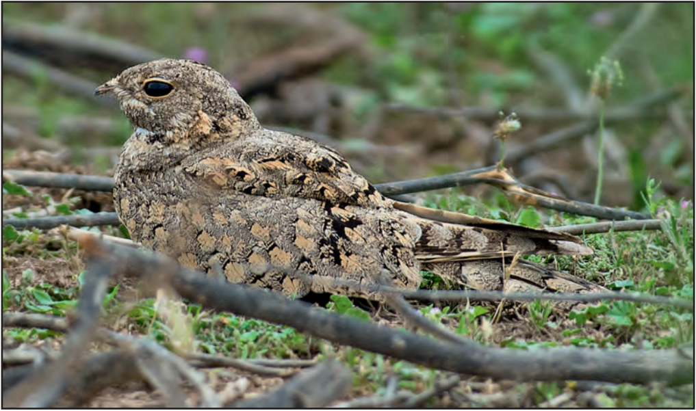
Plate 7. Egyptian Nightjar Caprimulgus aegyptius 12 April 2018 Helveh, Khuzestan, Iran.