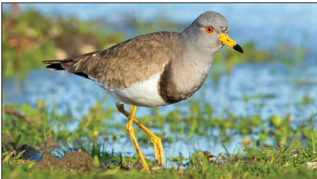
Plate 18. Grey-headed Lapwing Vanellus cinereus 11 March 2018 Samsun, Kızılırmak delta, Turkey.