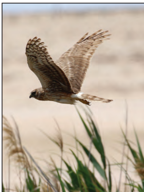
Plate 20. Hen Harrier Circus [c.] cyaneus 20 April 2018, Sila’a, United Arab Emirates.

May and five Crested Honey Buzzards Pernis ptilorhynchus over Abu Dhabi 2 Mar. The 15th record of Eurasian Griffon Vulture Gyps fulvus Jebel Hafeet 23 Apr and a Cinereous Vulture Aegypius monachus Dubai desert conservation reserve, 24 Jan. A Hen Harrier Circus [c.] cyaneus Sila’a 20 Apr (Plate 20) and three single Long-legged Buzzards Buteo [r.] rufinus various locations 12–14 Jan.