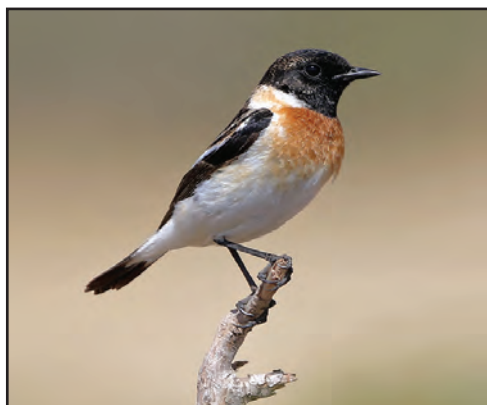
Plate 5. 'Caspian' Stonechat Saxicola maurus hemprichii 3 April 2018, cape Greco, Cyprus.

A Wallcreeper Tichodroma muraria Arodes 31 Jan was the only record. Two Rose-coloured Starlings Pastor roseus Karpasia 11 May and 18 Livera (Sadrazamköy) 18 May. A late Fieldfare Turdus pilaris Troodos 14 Apr. A Thrush Nightingale Luscinia luscinia ringed Palaikythro (Balikesir) pools 8 Apr. A Rufous-tailed Scrub-robin Cercotrichas galactotes Elea golf course, Paphos, 17 May, first since 2013. Semi-collared Flycatchers Ficedula semitorquata were at Baths of Aphrodite 29 Mar and 3 Apr, cape Greco 5, 7 and 21 Apr, Kiti dam 14 Apr, Bishop's Pool 28 Apr and Mandria 8 May. A female Red-breasted Flycatcher F. parva Paphos headland 29 Apr. A Western Siberian Stonechat Saxicola maurus maurus Mandria 1–3 Mar while single 'Caspian Stonechats' S. maurus hemprichii were at Paphos headland 19–23 Mar and 9 Apr, Akrotiri 19 Mar and 2 Apr and cape Greco 3 Apr (Plate 5). An Isabelline Wheatear Oenanthe isabellina Akrotiri 14–21 Jan was the earliest ever record. A female Hooded Wheatear O. monacha Paphos headland