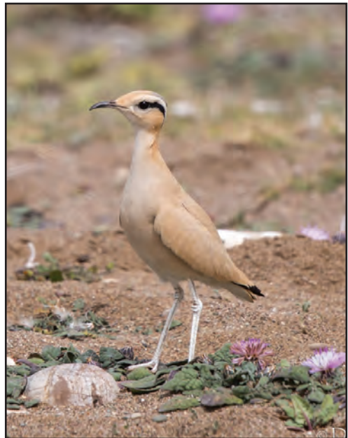
Plate 4. Cream-coloured Courser Cursorius cursor 23 March 2018, Mandria (Paphos), Cyprus.

Two Little Gulls Hydrocoloeus minutus Lady's Mile 4 Jan and one 19–29 Jan; one Larnaca STP 23 Jan and 5 Mar and one Akrotiri GP 16 Mar. Single Great Black-headed Gulls Ichthyaetus ichthyaetus reported in Jan, Feb and Apr at Trikomo (Ískele), cape Greco, Dekeleia, Larnaca and Paphos with up to three in March at Akrotiri, Timi and Mandria and a high