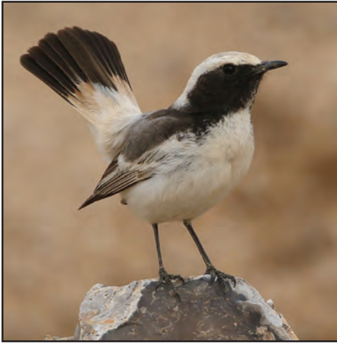
Plate 12. Red-rumped Wheatear Oenanthe moesta adult male, 15 February 2018, near Tafilah, Sharrah highlands, Jordan.

Nubian Nightjar Caprimulgus nubicus : 33 different individuals heard at three locations in southern Jordan valley (southeast Dead sea) and one location in Wadi Araba (survey by Jordan BirdWatch April–May 2018 of one of the rarest breeding species in Jordan). 10+ pairs of Red-rumped Wheatears Oenanthe moesta Feb 2018 (Plate 12) in two separate areas in the Sharrah highlands of southwest Jordan; one of the rarest breeding species in Jordan, its habitats now being threatened by new wind farm developments.