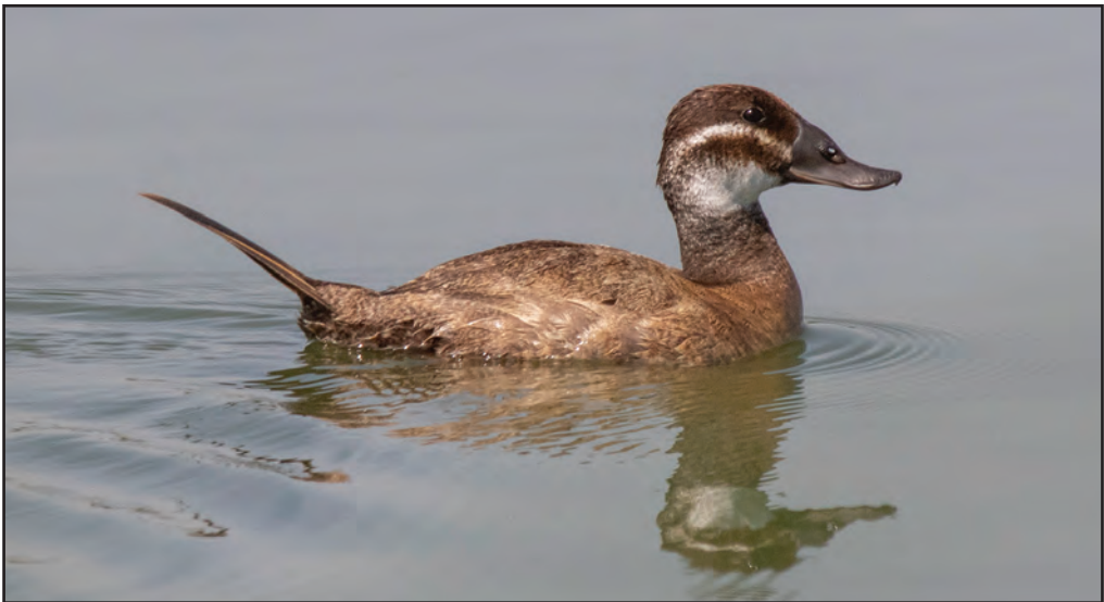
Plate 1. White-headed Duck Oxyura leucocephala 30 April 2018 Mia Millia (Haspolat) sewage treatment plant, Cyprus.

Paphos headland 6 Jan where a female also 4 Mar. A male and female White-headed Duck Oxyura leucocephala Kanli (Kanlıköy) reservoir 3 Apr and one Mia Millia (Haspolat) STP 30 Apr (Plate 1). The first record of Red-throated Diver Gavia stellata Paphos 12 Apr. Single Yelkouan Shearwaters Puffinus yelkouan Paphos 28 Mar and cape Greco 1 Apr. The Horned Grebe Podiceps auritus (one of two first seen 16 Nov 2017) remained offshore Koukليا, Paphos throughout Jan until 7 Feb. 68 Black-necked Grebes Podiceps nigricollis Larnaca STP during Feb and up to three at other wetlands until late Apr. A Black Stork Ciconia nigra Ercan airport 23 Apr and two near Apostolos Andreas (Zafer Bornu) Karpasia (Karpaz), 19 May and a Western White Stork C. c. ciconia Phasouri reedbeds 21 Apr. Eurasian Spoonbill Platalea leucorodia numbers included seven Akrotiri salt lake 2 Feb, five Oroklini marsh 31 Mar, 16