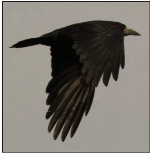
Plate 10. Rook Corvus frugilegus 21 May 2018, near Sirwan, Iraq.

A male Namaqua Dove Oena capensis Mosul dam 19 Jun (vagrant to Iraq). A Middle-Spotted Woodpecker Dendrocytes medius Sharbazher area 19 Apr and a European Green Woodpecker Picus viridis there 30 Mar (both uncommon in Iraq). A Lanner Falcon Falco biarmicus near Darbandikhan 12 Jan and one near Halabja 27 Jan. Four Masked Shrikes