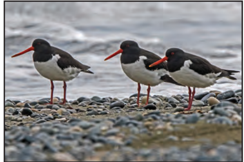
Plate 7. Eurasian Oystercatcher Haematopus ostralegus 29 March 2019, Lady's Mile, Cyprus.

The first migrating Western Osprey Pandion haliaetus 24 Mar Odou and then singles many locations to 29 Apr. European Honey Buzzards Pernis apivorus are uncommon spring migrants but two Cape Apostolos Andreas 25