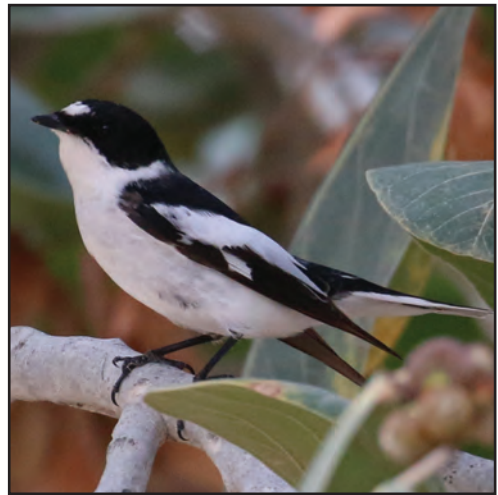
Plate 43. Male Semi-collared Flycatcher Ficedula semitorquata 22 March 2019, Al Mamzar Park, Dubai, United Arab Emirates.

between Dubai and Abu Dhabi (seen entering nesting holes) 24 May. A Black Scrub Robin Cercotrichas podobe Jebel Dhanna hotels 12-13 Mar (Plate 41) and another Al Sila'a peninsula 15 Mar (eight-ninth records). A European Robin Erithacus rubecula Al Mamzar park 22 Mar. A 2cy male European Pied Flycatcher Ficedula hypoleuca Umm al-Emarat park, Abu Dhabi, 6 May (second record; Plate 42) while a male Semi-collared Flycatcher F. semitorquata Al Mamzar park 22 Mar (Plate 43) and a female Al Sila'a peninsula 19 Apr. A male Eversmann's Redstart Phoenicurus erythronotus Munay dam 23 Feb. An influx of many ' Western Siberian