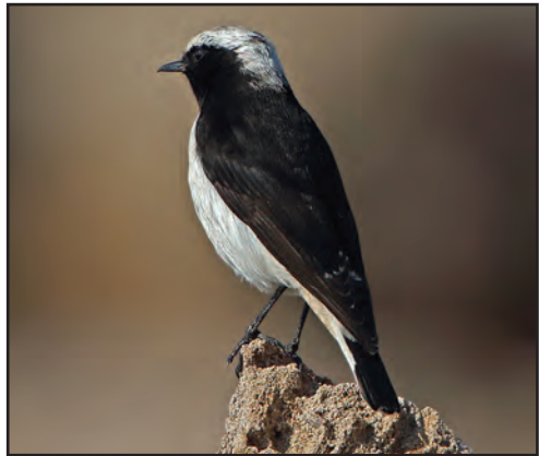
Plate 17. Eastern Mourning Wheatear Oenanthe lugens 19 February 2019, Cape Drepanum, Cyprus.

Ficedula parva Paphos headland 1 Apr and one Karpasia (Karpaz) 19 May. Both ' Western Siberian Stonechats ' Saxicola maurus maurus and ' Caspian Stonechats ' S. maurus hemprichii various locations 25 Mar-1 May. A male Northern Wheatear Oenanthe oenanthe Cape Greco 23 Jan - a very early record. A female Hooded Wheatear O. monacha Paphos headland 28 Mar-2 Apr (Plate 15) and the tenth record of White-crowned Wheatear O. leucopyga Tremithousa 14 Apr. An Eastern Mourning Wheatear Oenanthe lugens Livera (Sadrazamköy) 10 Feb (Plate 16) and another Cape Drepanum 18-21 Feb (Plate 17) were the fourth and fifth records. A Eurasian Tree Sparrow Passer montanus Manglis lake, Nicosia 5 Feb and another Cape Apostolos Andreas 23 Apr. At least nine Pale Rockfinch