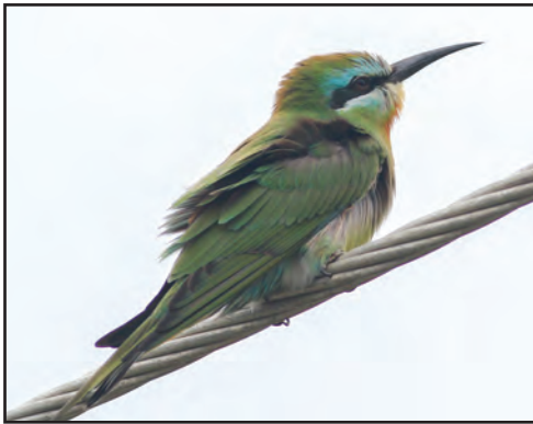
Plate 10. Blue-cheeked Bee-eater Merops persicus 30 March 2019, Rizokarpaso (Dipkarpaz), Cyprus.