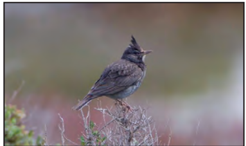
Plate 13. Melanistic Crested Lark Galerida cristata 24 February 2019, Kazivera (Gaziveran), Cyprus.

Karpasia (Karpaz) peninsula 26 Apr and one Akrotiri marsh (Phasouri reed-beds) 4 May (8th-10th records). Many Common Cuckoos Cuculus canorus various suitable breeding locations this spring and a pair seen mating Stavros tis Psokas 20 Apr. Single Little Swifts Apus affinis Akrotiri marsh 10 Jan, 14 Feb and 29 Apr and one Larnaca STP 20 Apr. Single Pied Kingfishers Ceryle rudis Asprokremmos dam 31 Mar, Rizokarpaso (Dipkarpaz) 21 Apr, eastern Mesaoria (Mesarya) plain 30 Apr, Zakaki marsh 1 May and Evretou dam 9-10 May. Blue-cheeked Bee-eaters Merops persicus 30 Mar-11 May various locations (maximum seven Cape Greco) (Plate 10). Eurasian Wrynecks Jynx torquilla heard calling Troodos 9 May, Pera Oreinis 29 May and Stavros tis Psokas 9 Jun (usually only a passage migrant). Single Daurian Shrikes Lanius isabellinus Neo Horio 27 Apr and Akrotiri gravel pits 5-6 May. A Turkestan Shrike Lanius phoenicuroides Paphos headland 27-29 Apr and one Larnaca