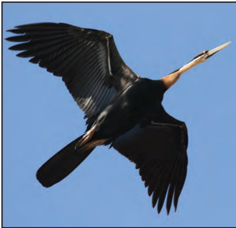
Plate 20. African Darter Anhinga rufa 13 February 2019, Hour-al-Azeem, Khuzestan Province, Iran.