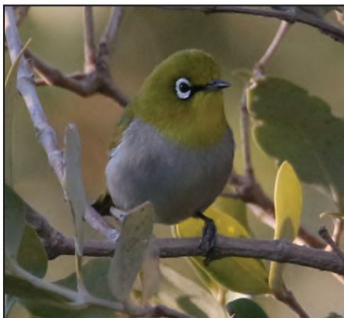
Plate 22. Oriental White-eye Zosterops palpebrosus 8 February 2019, mouth of River Gaz near Bandar-e Sirik, Hormozgan Province, Iran.