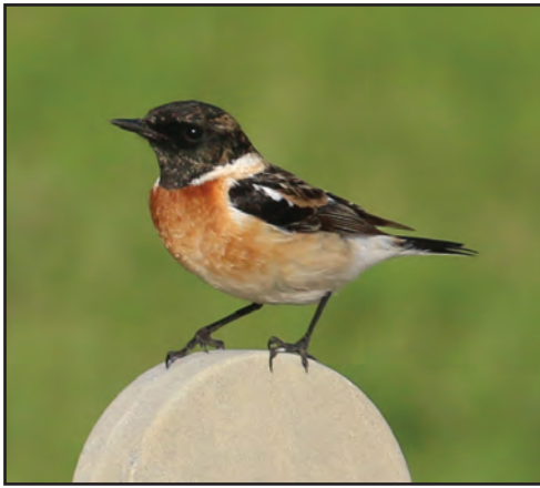
Plate 44. Caspian Stonechat Saxicola maurus hemprichii 9 March 2019, Abu Dhabi, United Arab Emirates.