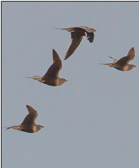
Plate 31. Chestnut-bellied Sandgrouse Syrrhaptes exustus 25 January 2019, Haradh, Eastern Province, Saudi Arabia.