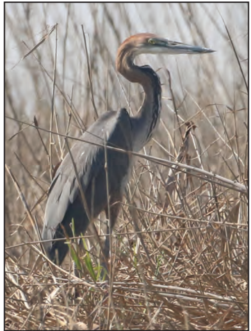
Plate 19. Goliath Heron Ardea goliath 13 February 2019, Hour-al-Azeem, Khuzestan Province, Iran.

A sub-adult Lammergeier Gypaetus barbatus Elba protected area 20 Mar and a female Crested Honey Buzzard Pernis ptilorhynchus Gebel el-Zayt 8 May. A Black Scrub