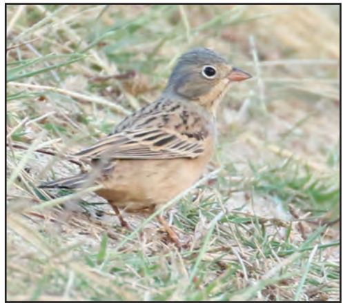
Plate 47. Cretzschmar's Bunting Emberiza caesia 16 March 2019, Saadiyat Island, Abu Dhabi, United Arab Emirates.