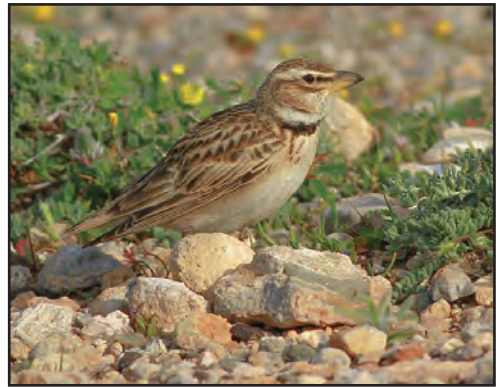
Plate 12. Bimaculated Lark Melanocorypha bimaculata 27 March 2019, Rizokarpaso (Dipkarpaz), Cyprus.