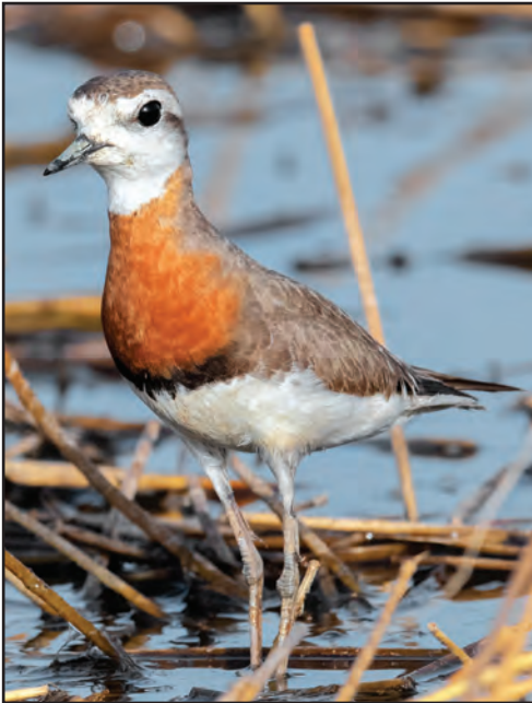
Plate 9. Caspian Plover Anarhynchus asiaticus 29 May 2019, Kouklia (Kukla) Wetlands, Cyprus.

headland. Pied Avocets Recurvirostra avosetta recorded various locations from 5 Jan with a maximum of ten Akrotiri salt lake 27 May. A Eurasian Dotterel Charadrius morinellus Spiros pool 26 Mar, three Morphou 30 Mar and two Pervolia 17 Apr. Two Greater Sand Plover Anarhynchus leschenaultii Trikomo (Iskele) 27 Jan. A female Caspian Plover Anarhynchus asiaticus Mandria (Paphos) 14-15 Mar (Plate 8) and a male Kouklia (Kukla) wetlands 29 May (Plate 9). The regular over-wintering Eurasian Whimbrel Numenius (phaeopus) phaeopus was at Paphos headland until 19 Apr while up to