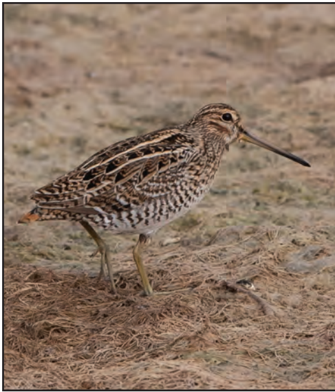
Plate 29. Great Snipe Gallinago media 6 May 2019, Sabkhat Al Fasl, Eastern Province, Saudi Arabia.