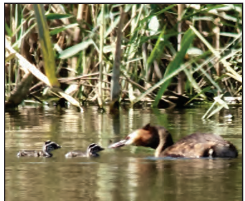
Plate 26. Adults with two young Great Crested Grebe Podiceps cristatus 24 May 2019, Jahra Pools Reserve, Kuwait.

A Sooty Shearwater Ardenna grisea Ras Al Salmiya 30 Apr, two JPR 16 May and four there 21 May (sixth-seventh records). The first record of Black Throated Diver Gavia arctica JPR 25-27 Jan. Two Great Crested Grebes Podiceps cristatus with two chicks JPR 22 Apr (first breeding record; Plate 26). Black-winged Kites Elanus caeruleus Al Abra 25 Feb and JPR 28 Feb. Four Crested Honey Buzzards Pernis ptilorhynchus Kuwait City 14 Mar, one JPR 26 Mar, one Rumaithya park 17