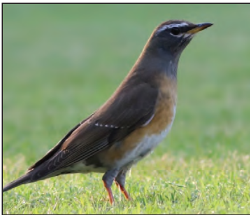
Plate 5. Eyebrowed Thrush Turdus obscurus 21 November 2018, Al Areen wildlife park, Bahrain.

in the south of the island was found breeding at the same location 23 Jun 2019 (one chick; Plate 3) and another ringed same area 22 July 2015 found 29 Jun, also with a chick. A good season for breeding Egyptian Nightjar Caprimulgus aegyptius - six females starting to lay in the centre of the island from 1 Mar and second brood of one female found 20 Jun (Plate 4). An Eyebrowed Thrush Turdus obscurus Al Areen wildlife park 21-23 Nov 2018 (Plate 5).