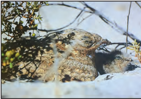
Plate 4. Egyptian Nightjar Caprimulgus aegyptius with chick 20 June 2019, central Bahrain.