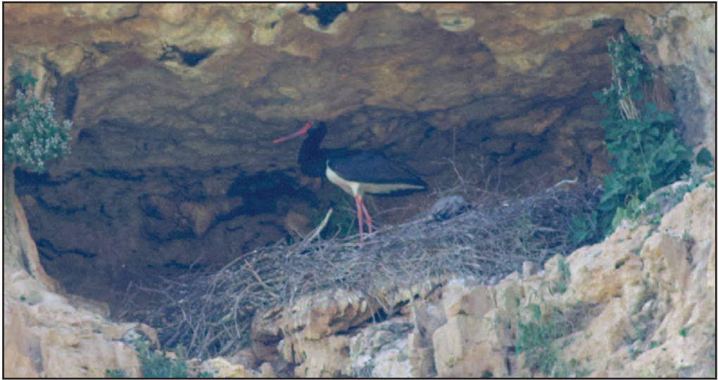
Plate 23. Adult Black Stork Ciconia nigra at nest, 20 May 2019, Chami Razan, Kurdistan Region, Iraq.