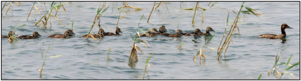
Plate 6. Ferruginous Duck Aythya nyroca with ducklings 12 June 2019, Koukليا (Kukla) Wetlands, Cyprus.