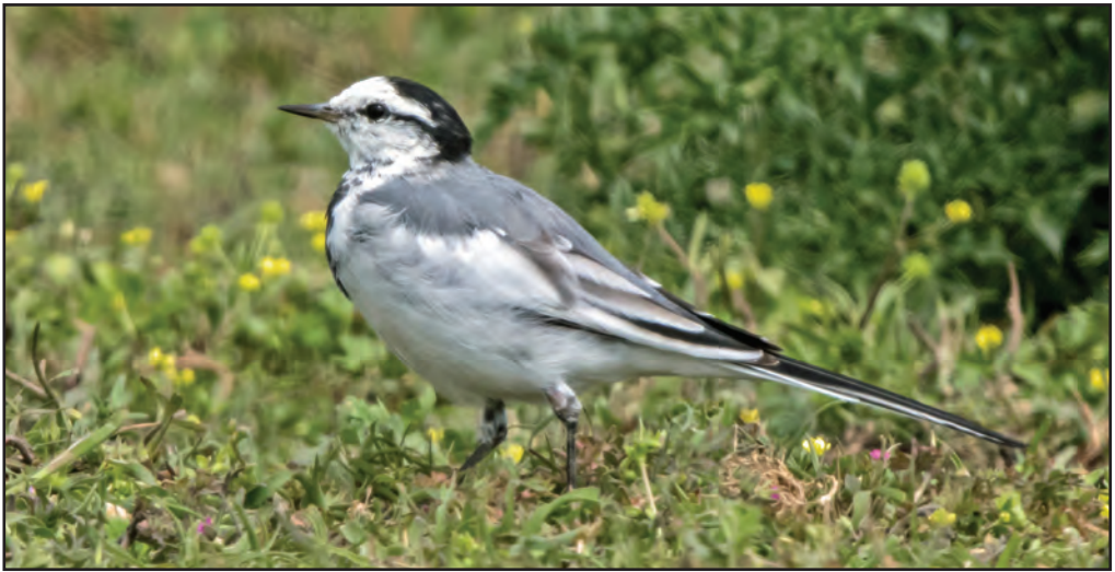
Plate 18. 'East Siberian Wagtail' Motacilla (alba) ocularis 4 April 2019, Akrotiri Marsh, Cyprus.

Carpospiza brachydactyla Cape Greco 7 May increasing to 27 on 12 May (14th record - and the highest number). Only two records of Richard's Pipit Anthus richardi this spring - one Paphos headland 29 Mar and one Timi beach 26 Apr. A Blyth's Pipit A. godlewskii Karpasia (Karpaz) peninsula 25 Apr (fourth record). A Sykes's Wagtail Motacilla (flava) beema Rizokarpaso (Dipkarpaz) 25 Apr. Up to five Citrine Wagtails M. citreola various locations 20 Mar-15 Apr, last record 10 May Lower Ezousas. Photographs of an ' East Siberian Wagtail ' M. (alba) ocularis Akrotiri Marsh 30 Mar (Plate 18) suggest it was the same bird that appeared there Mar 2018 (second record). Two Brambling Fringilla montifringilla Marathounta 2 Jan, one there 24 & 27 Jan, one Paphos headland 4-22 Mar, one Agia Napa STP 21 Mar and one Prastio 25 Mar. A Red-fronted Serin Serinus pusillus 23 Feb near Coral bay, Paphos (15th record). A ' Western Cinereous Bunting ' Emberiza (cineracea) cineracea Cape Greco 30 Mar, two Agia Napa STP 3 Apr and one Timi beach 26 Apr. 10 male Black-headed Buntings E. melanocephala Pentadactylos (Beşparmak) mountains singing at one location 10 Jun.