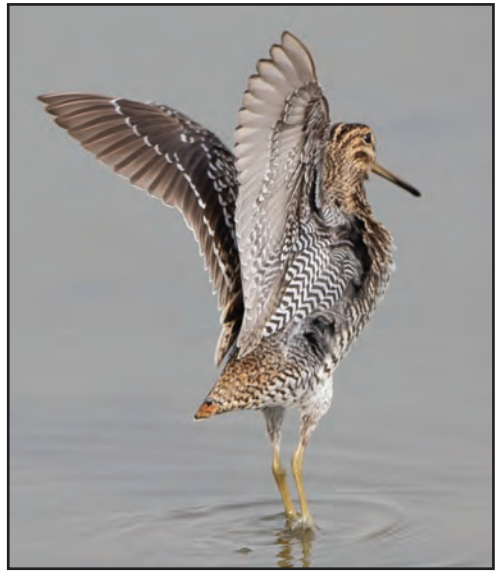
Plate 30. Great Snipe Gallinago media 6 May 2019, Sabkhat Al Fasl, Eastern Province, Saudi Arabia.