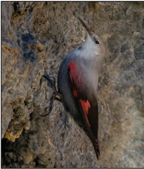
Plate 14. Wallcreeper Tichodroma muraria 9 January 2019, Larnaca tis Lapithou (Kozanköy), Cyprus.

one Paphos headland 26 Apr while single Icterine Warblers Hippolais icterina Smygies 22 Apr, Arodes and Paphos headland 24 Apr, Akrotiri gravel pits 30 Apr, Karpasia (Karpaz) 2 May and Lara 9 May. The third and fourth records of Common Grasshopper Warbler Locustella naevia Mandria (Paphos) 23 Mar and Paphos headland 1 Apr. Barred Warbler Curruca nisoria numbers greater than usual - up to five seen 17-29 Apr various locations and a high count of 15 Karpasia (Karpaz) 30 Apr, last record Larnaca STP 21 May. A late Goldcrest Regulus regulus Kantaras (Kantara) 2 May (rare in this area).