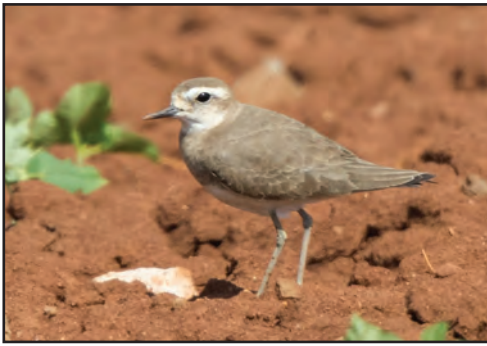
Plate 8. Female Caspian Plover Anarhynchus asiaticus 14 April 2019, Mandria (Paphos), Cyprus.