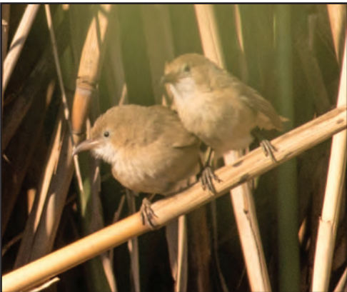
Plate 25. Iraq Babblers Argya altirostris 19 Apr 2019, Tanjaro stream, A'Sulaimaniyah, Kurdistan Region, Iraq.

19 Apr showing signs of breeding activity (Plate 25).