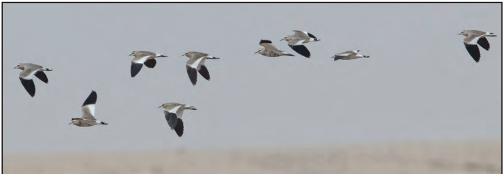
Plate 28. Sociable Lapwing Vanellus gregarius 25 January 2019, Haradh, Eastern Province, Saudi Arabia.

An adult female Crested Honey Buzzard Pernis ptilorhynchus Alheefah park, Tanoumah 17 May. A Mediterranean Golden Eagle Aquila (chrysaetos) homeyeri was around Shaybah February and March a vagrant to the Eastern province. Two Spur-winged Lapwing Vanellus spinosus Sabkhat Al Fasl (SAF) intermittently from 10 Apr seen displaying 10 May indicating possible breeding; one, possibly two, present 24 May. A single Sociable Lapwing Vanellus gregarius KAUST 22-26 Jan and fourteen in ploughed fields near Haradh 25 Jan (Plate 28), the fourth consecutive year birds have wintered at this site. Three adult Red-wattled Lapwing Vanellus indicus Khafrah marsh, Jubail, 9 Mar. A flock of 20 ' European Black-tailed Godwit ' Limosa (limosa) limosa several kilometres south of Jizan on the coast, 8 Mar, a high number. A Great Snipe Gallinago media was at SAF 6-10 May (Plates 29,30). A Pomarine Skua Stercorarius pomarinus Al Asfar lake, well inland at Al Hassa, Eastern province, 22 Dec 2018. A group of over 50 Chestnut-bellied