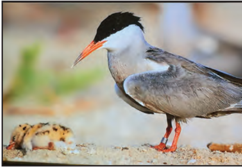
Plate 3. White-cheeked Tern Sterna repressa with one chick 23 June 2019, southern Bahrain.

A European Honey Buzzard Pernis apivorus ringed Bahrain 11 Oct 2018 was found dying four days later, 15 Oct, 1100 km away in Al Bahah, Hehaz, west Saudi Arabia. A White-cheeked Tern Sterna repressa ringed 4 Jul 2013