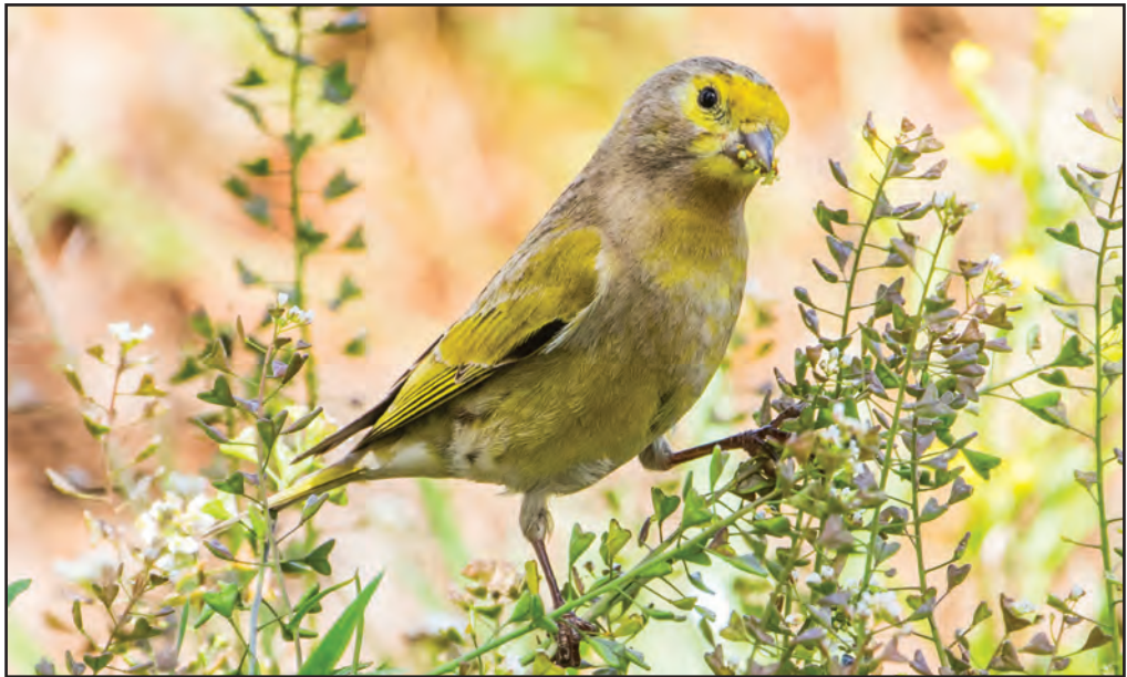
Plate 27. Syrian Serin Serinus syriacus 8 April 2019, Aanjar, Lebanon.

Larus armenicus 10 Mar Sanani island (Palm Islands nature reserve) – highest number recorded at one location. A Lesser Crested Tern Thalasseus bengalensis Chekka coast, northern Lebanon 2 Mar - second record, last 1895 (for further details see article in this issue). 25 pairs of Syrian Serin Serinus syriacus Hermel early Apr, 22 birds at the usual site of Aanjar, 8 Apr (Plate 27) and in mid-May other populations discovered in Rachaya, Kawkaba and Kfarmishky (all Jabal El Cheikh - Hermon) but precise numbers not yet determined.