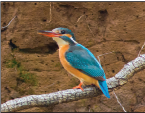
Plate 24. Common Kingfisher Alcedo atthis 18 May 2019, Parazan Area, Kurdistan Region, Iraq.