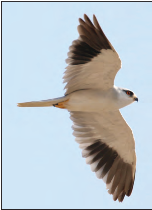
Plate 37. Black-winged Kite Elanus caeruleus 17 May 2019, Wamm Farms, Fujairah, United Arab Emirates.