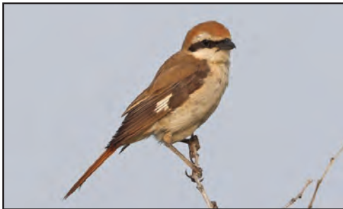
Plate 11. Turkestan Shrike Lanius phoenicuroides 22 May 2019, Larnaca Sewage Treatment Plant, Cyprus.