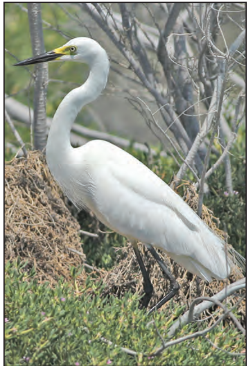
Plate 36. Intermediate Egret Ardea intermedia 15 April 2019, Ra’s al-Khor wildlife reserve, Dubai, United Arab Emirates.

Two female Red-breasted Merganser Mergus serrator Al Barsha pond 6-20 Mar (sixth record). 130 Wilson’s Storm Petrels Oceanites oceanicus on a pelagic trip off Kalba 31 May (70 on 14 Jun) together with two Swinhoe’s Storm Petrels Hydrobates monorhis . A Sooty Shearwater Ardenna grisea on a trip from Kalba, 17 May and a Flesh-footed Shearwater Ardenna carneipes off Kalba 14 Jun. A Eurasian Bittern Botaurus stellaris on a private estate near Green Mubazzarah, Oct 2018-1 Apr when seen departing northwards; one Al Qudra lake, 1 Feb (25th-26th records). The eighth record of Eastern Cattle Egret Bubulcus coromandus Ajman WTP 3-12 Apr and an Intermediate Egret Ardea intermedia in full breeding plumage at Ra’s al-Khor wildlife reserve 3 Apr (two 15 Apr; Plate 36). An adult male Frigatebird sp. over Jumeira public beach, Dubai, 17 Mar (first record). Single Black-winged Kites Elanus caeruleus Wamm