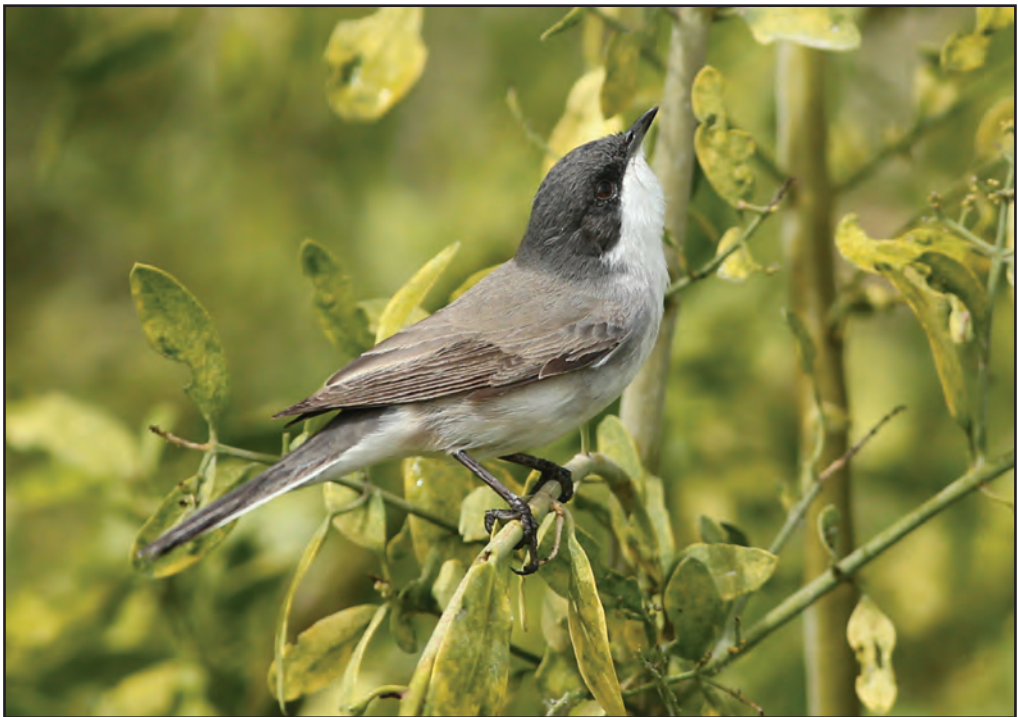
Plate 40. Hume's Whitethroat Curruca (curruca) althaea 15 March 2019, Jebel Dhanna, Abu Dhabi, United Arab Emirates.

Common Starling Sturnus vulgaris confirmed breeding at a pivot field site