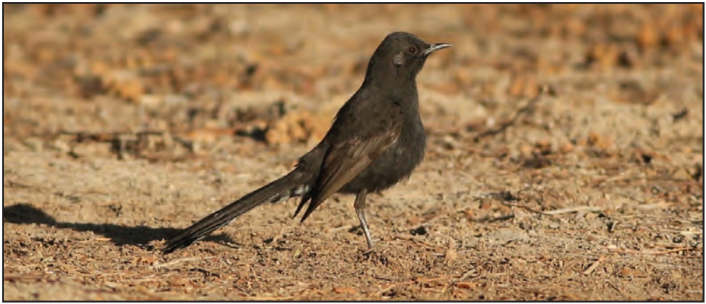
Plate 41. Black Scrub Robin Cercotrichas podobe 12 March 2019, Jebel Dhanna, Abu Dhabi, United Arab Emirates.