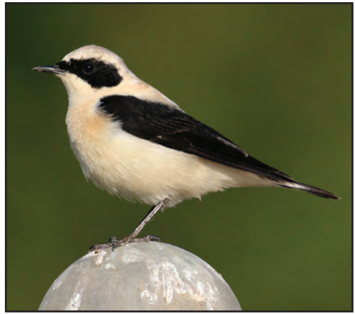
Plate 46. Eastern Black-eared Wheatear Oenanthe (hispanica) melanoleuca 10 March 2019, Abu Dhabi, United Arab Emirates.