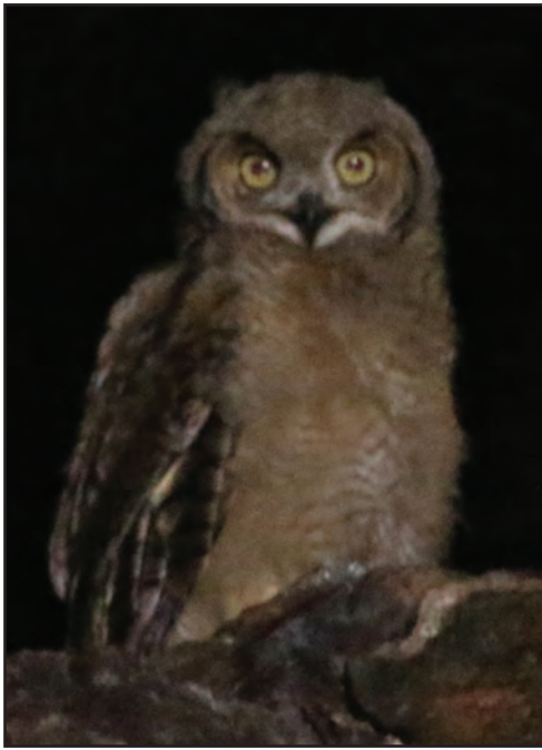
Plate 39. Arabian Spotted Eagle-owl Bubo (africanus) milesi 16 May 2019, Al Hajar mountains, United Arab Emirates.

2018 remained to 15 Mar while another Palm Jumeirah 13 Mar. A Merlin Falco columbarius near Qudra lake 22 Jan and a Bay-backed Shrike Lanius vittatus Wadi Wurrayah national park 28 Mar.