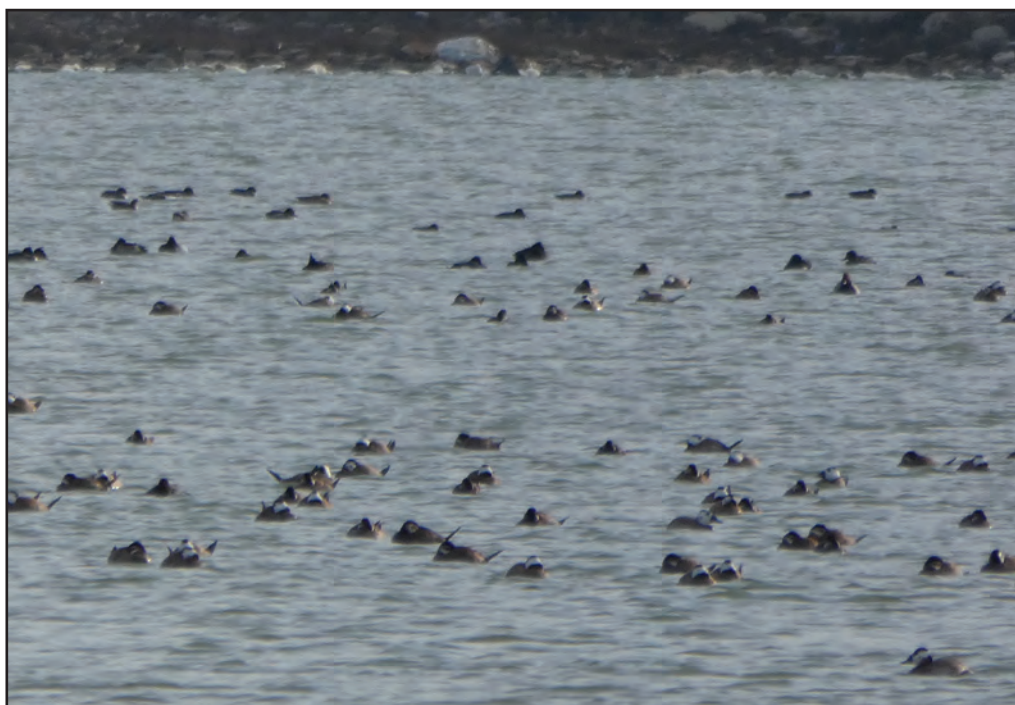
Plate 1. White-headed Ducks Oxyra leucocephala 26 December 2018, Zabrát Lake, Azerbaijan.