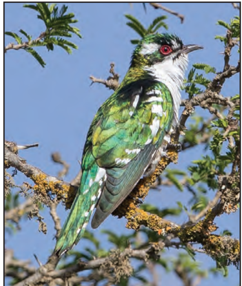
Plate 32. Diederik Cuckoo Chrysococcyx caprius 17 May 2019, Alheefah Park, Tanoumah, Asir Province, Saudi Arabia.

Sandgrouse Syrrhaptes exustus flying near Haradh 25 Jan (fourth record for the Eastern province; Plate 31).