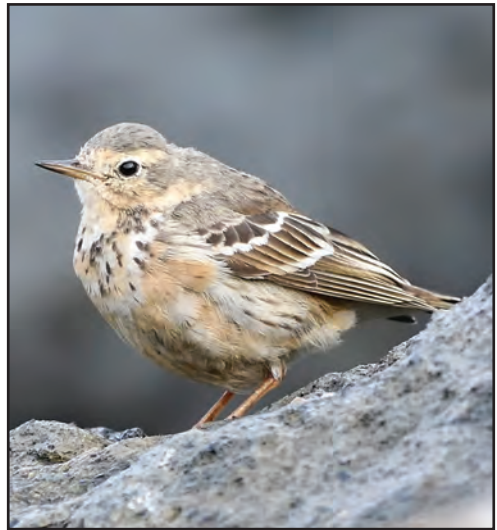
Plate 35. Siberian Buff-bellied Pipit Anthus (rubescens) japonicus 30 March 2019, Trabzon, Turkey.

hodgsoni Subaşı 7 Feb (both Hatay province). However the regular ‘ Siberian Buff-bellied Pipits ’ A. (rubescens) japonicus were not in Hatay as normal although singles occurred Kocaçay, Bursa, 31 Jan (Plate 34) and Trabzon 30 Mar (Plate 35). A single Pine Bunting Emberiza leucocephalos Gerede, Bolu 16 Feb and one trapped Aras ringing station 28 Mar.