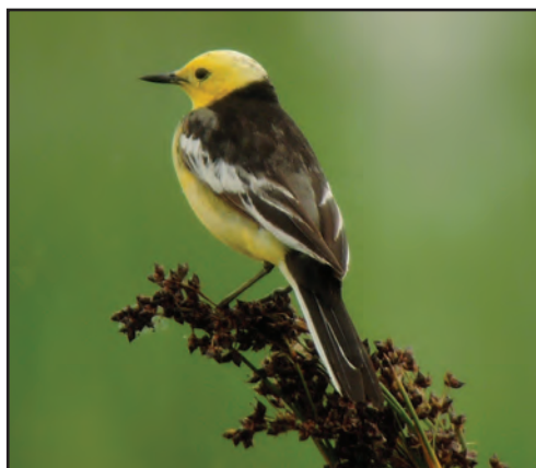
Plate 2. Male Black-backed Citrine Wagtail Motacilla (citreola) calcarata 26 May 2019, Kizil Agach, Azerbaijan.

Correction: The first breeding record of Namaqua Dove Oena capensis near Cayli 21 May 2018, mentioned in Sandgrouse 41(1), was in fact the first record of a single male with no evidence of breeding.