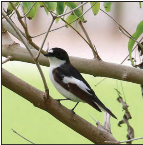
Plate 42. European Pied Flycatcher Ficedula hypoleuca 6 May 2019, Umm al-Emarat park, Abu Dhabi, United Arab Emirates.