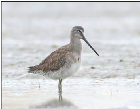
Plate 21. Long-billed Dowitcher Limnodromus scolopaceus 10 February 2019, Bandar Abbas, Iran.