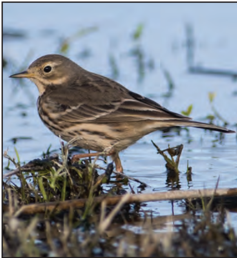
Plate 34. Siberian Buff-bellied Pipit Anthus (rubescens) japonicus 31 January 2019, Kocaçay, Bursa, Turkey.