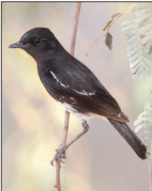
Plate 45. Pied Bushchat Saxicola caprata 18 April 2019, Green Mubazzarah, Al Ain, United Arab Emirates.