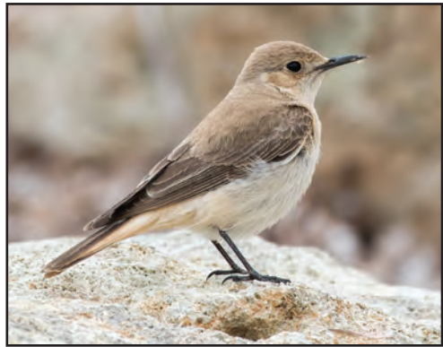
Plate 15. Female Hooded Wheatear Oenanthe monacha 30 March 2019, Paphos headland, Cyprus.

A Wallcreeper Tichodroma muraria Tunnel beach 5 Jan and 10 Feb and possibly the same bird Kensington cliffs 2 Feb; one Larnaca tis Lapithou (Kozanköy) 9 Jan was the first record from the north of the island since 2002 (Plate 14). A Common Myna Acridotheres tristis Trikomo (Iskele) 7 Jan. Rose-coloured Starlings Pastor roseus various locations 27 Apr-24 May, maximum seven Karpasia (Karpaz) 18 May. 1500 Common Starlings Sturnus vulgaris Famagusta Fresh Water lake (Ayluga) 3 Mar. Single Thrush Nightingales Luscinia luscinia Livera (Sadrazamköy) 30 Apr and Rizokarpaso (Dipkarpaz) 22 May where there was also a White-throated Robin Irania gutturalis 27 Apr. A Red-breasted Flycatcher