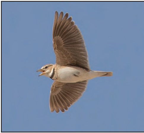
Plate 33. Bimaculated Lark Melanocorypha bimaculata 9 February 2019, Jebal Hamrah, Judah, Eastern Province, Saudi Arabia.

bimaculata near Jebal Hamrah, Judah, 9 Feb (Plate 33) while five Arabian Larks Eremalauta eremodites were at the stony edge of large irrigation fields 30 km west of Tabuk 18 Jan. A calling Siberian Chiffchaff Phylloscopus tristis SAF 11 Jan (third fully documented record). An Olive-tree Warbler Hippolais olivetorum Quraish Valley near Tanoumah, 17 May. A Pied Stonechat Saxicola caprata Jeddah eastern woods, 5 Jan-1 Mar (second record, last 17 Oct 1993). A female Cyprus Wheatear Oenanthe cypriaca KAUST 24 Mar and a Spanish Sparrow Passer hispaniolensis there 13 May (new species for the location). At least 150 Corn Bunting Emberiza calandra 15 km west of Tabuk 18-19 Jan, the largest flock seen in recent years while over 100 were near Jebal Hamrah, Judah, 9 February. A male Cretzschmar's Bunting E. caesia KAUST 30 Mar.