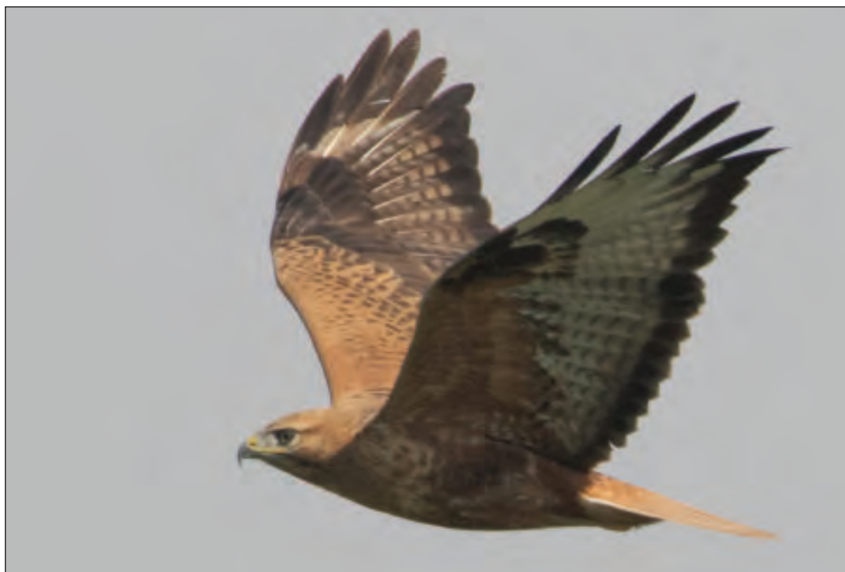
Plate 14. Long-legged Buzzard Buteo rufinus 11 November 2016, Irkaya farm, Qatar.

Eight Eastern Greylag Geese Anser a. rubrirostris West Saliya and three Greater White-fronted Geese A. albifrons Irkaya farm 12 Nov. Two Ruddy Shelducks Tadorna ferruginea IF 25 Nov–2 Dec, both taken by a hunter's Peregrine Falcon Falco peregrinus . Two Long-tailed Ducks Clangula hyemalis Al Thikira STP 29–30 Nov (first record and second GCC record, first Kuwait 2012). Up to 50 Black-necked Grebes Podiceps nigricollis on lagoons adjacent to IF early Dec. One