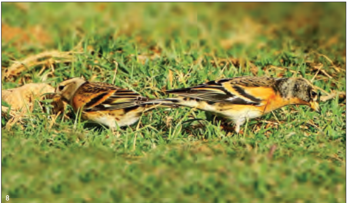
Plate 7. Siberian Buff-bellied Pipit Anthus (rubescens) japonicus 8 November 2016, Nicosia, Cyprus.