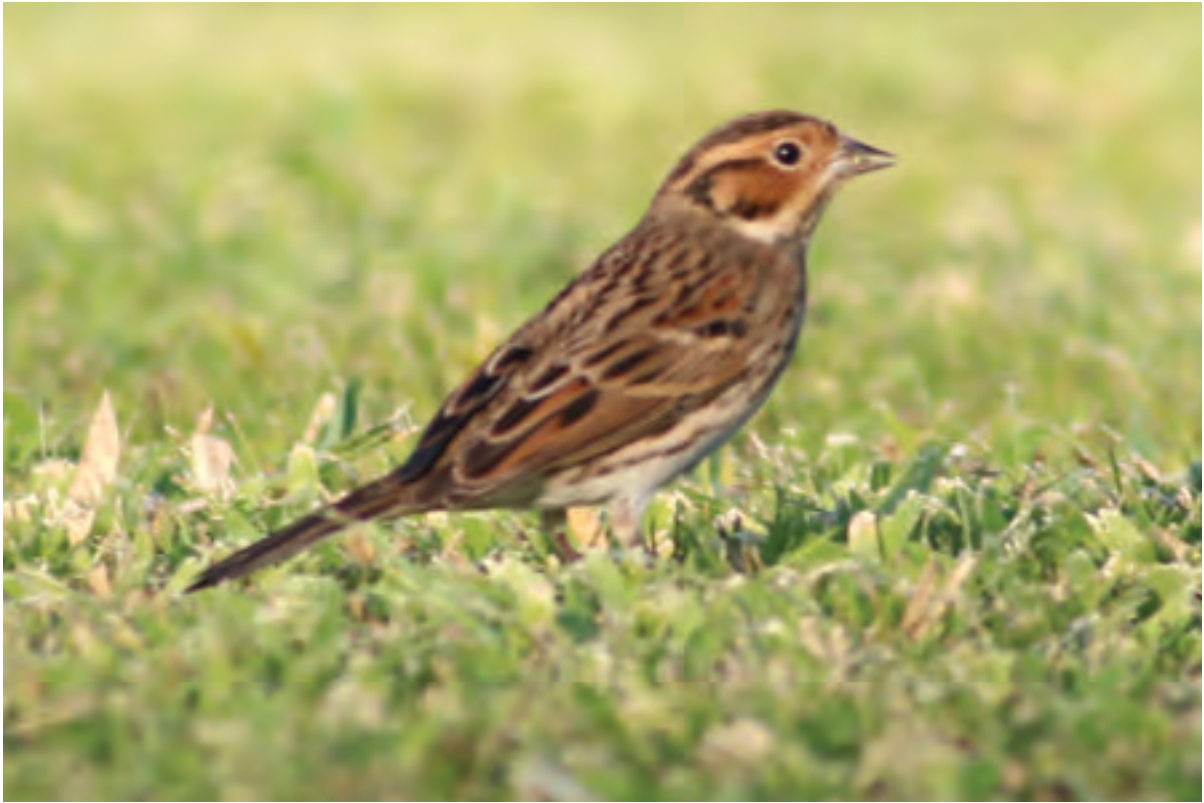
Plate 23. Little Bunting Emberiza pusilla 13 November 2016, Emirates Palace hotel, Abu Dhabi, United Arab Emirates.

two Eurasian Golden Plovers V. apricaria Wamm farm 26 Oct, one staying to 4 Nov. A Red Knot Calidris canutus Khor al Beida 13 Sep (12th record, first since 2013). A Cream-coloured Courser Cursorius cursor WF 4 Nov.