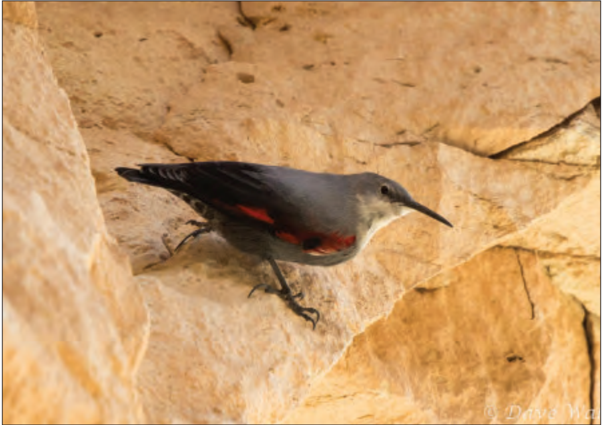
Plate 6. Wallcreeper Tichodroma muraria 12 November 2016, Avakas gorge, Paphos, Cyprus.

A Steppe Grey Shrike Lanius (meridionalis) pallidirostris Akrotiri SL 26 Oct–18 Nov and another cape Greco 21 Nov–15 Dec (Plate 4, 13 & 14th records). 30 Penduline Tits Remiz pendulinus Haspolat/Mia Milia STP 8 Nov. One Lesser Short-toed Lark Alaudala (rufescens) rufescens Mandria 5 Nov and a first-winter male Horned Lark Eremophila alpestris Troodos 25 Oct (Plate 5, fourth record). Two late Barn Swallows Hirundo rustica 26 Nov Ayluga lake/Agios Loukas.