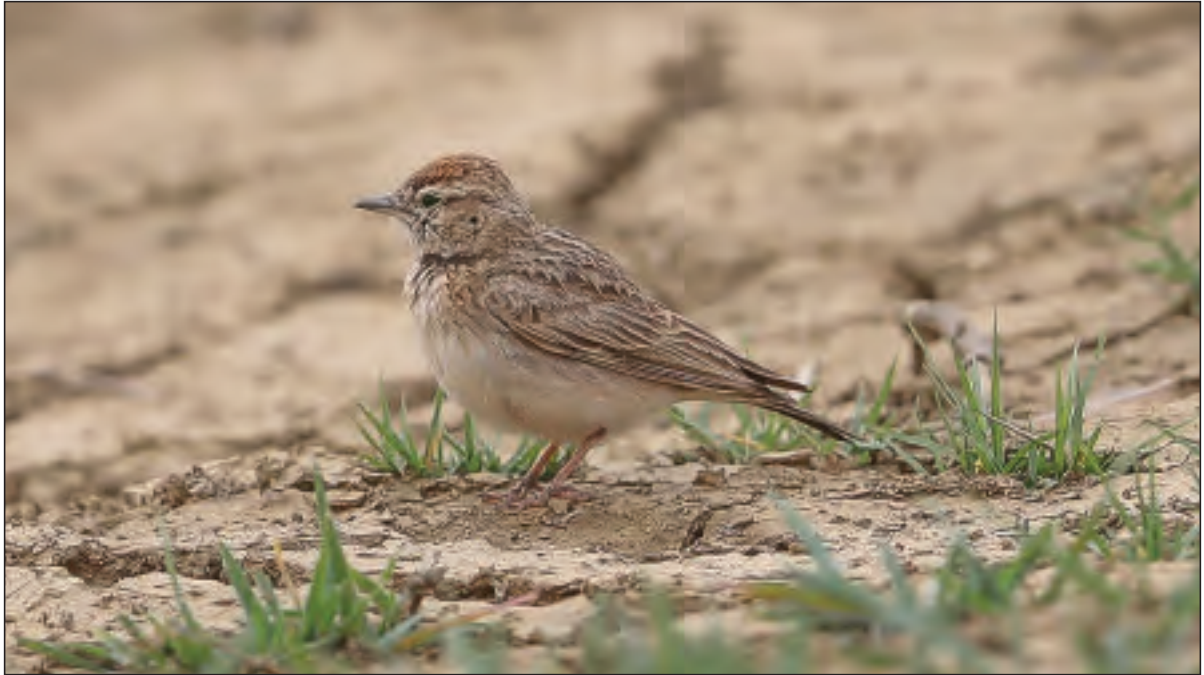
Plate 19. Blanford's Lark Calandrella blanfordi 9 July 2016, Talea'a valley, Asir mountains, Saudi Arabia.

European Robin Erithacus rubecula on west coast at KAUST 11 Nov and another, same day, on the east coast at SAF. Eight African Pipits Anthus cinnamomeus eximius including two adults feeding young Al Mefah park, Tanoumah, 7–8 Jul with another in song flight Talea'a valley 9 Jul.