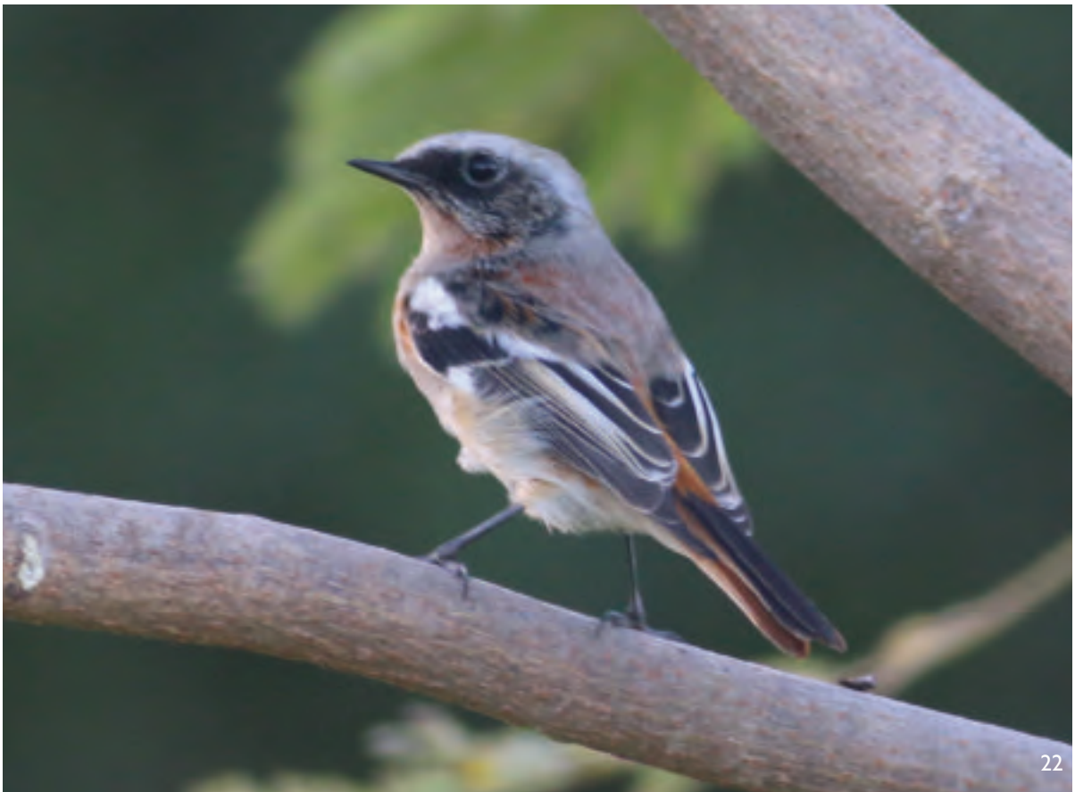
Plate 21. Savi's Warbler Locustella luscinioides 27 September 2016, Mushrif palace gardens, Abu Dhabi, United Arab Emirates.