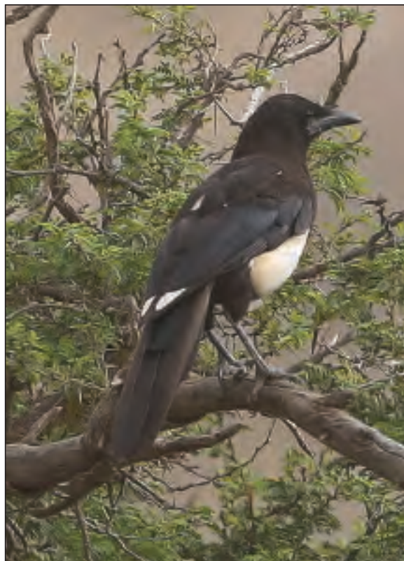
Plate 18. Arabian Magpie Pica (pica) asirensis 8 July 2016, Al Mehfar park, Tanoumah, Asir mountains, Saudi Arabia.

Four Blanford's Larks Calandrella blanfordi Talea'a valley, including adults and juveniles, 6 and 9 Jul (Plate 19). Four Oriental Skylarks Alauda gulgula SAF 11 Nov. A Fieldfare Turdus pilaris at farm near Zulfi 21 Nov. A