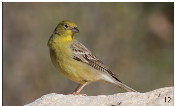
Plate 11. White-throated Robin Irania gutturalis 20 April 2016, Qara Dagh, Iraq.

Two Long-tailed Ducks Clangula hyemalis Ashuradeh, Golestan province, 29 Dec. A White-tailed Eagle Haliaeetus albicilla Pars-Abad, Moghan, Ardabil province, 24 Nov. One Red-footed Falcon Falco vespertinus Malekshahi city, Ilam province, 10 Nov. First record Forest Wagtail Dendronanthus indicus Bandar Abbas, Hormozgan province, 30 Nov. A Rustic Bunting Emberiza rustica Khoosheh