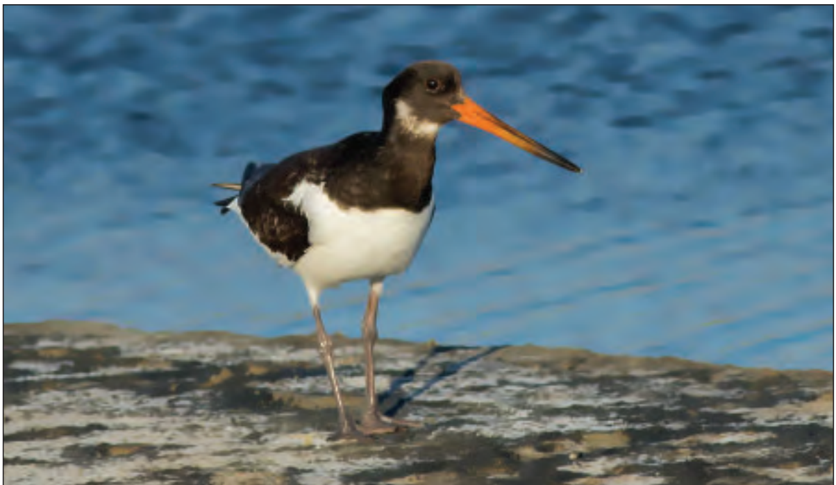
Plate 2. Eurasian Oystercatcher Haematopus ostralegus Gaziveran/Kazivera, Cyprus, 22 September 2016.

75 Eurasian Stone-curlews Burhinus [oediconemus] oediconemus East Mesaoria plain 12 Oct was a high count (four reported shot Dec).