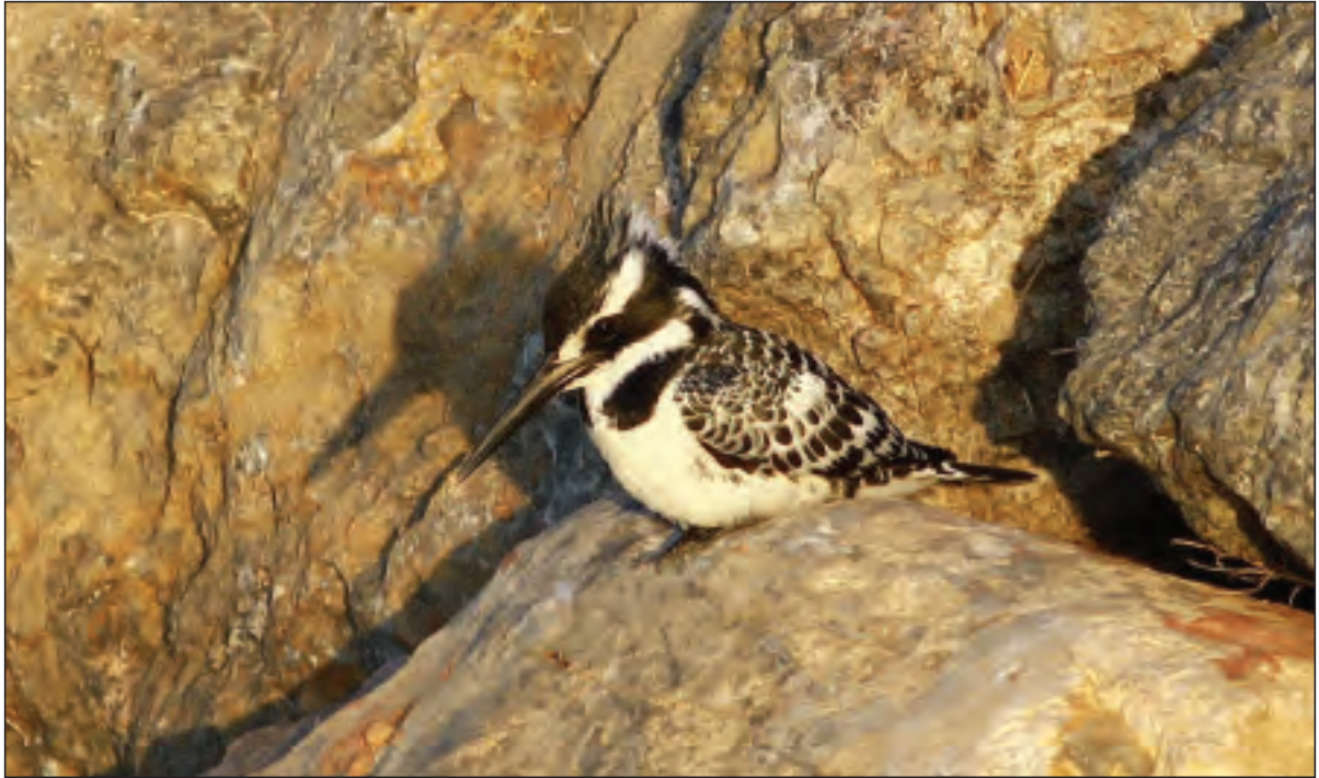
Plate 3. Pied Kingfisher Ceryle rudis Boğaz/Bogazi lagoon, Cyprus, 26 November 2016.

Single Eurasian Oystercatchers Haematopus ostralegus Polis Chrysochou bay 7 Aug and 10 Sep, Gaziveran/Kazivera 22–24 Sep (Plate 2) and two Sadrazamköy/Livera 20 Oct. A very high concentration of 130 Spur-winged Lapwings Vanellus spinosus Ayluga lake/Agios Loukas 19 Sep. Single Bar-tailed Godwits Limosa lapponica Akrotiri GP 8 Aug and 16–24 Sep and Gaziveran/Kazivera 23–25 Sep. 12–14 Spotted Redshanks Tringa erythropus Ayluga lake/Agios Loukas 19 Sep–3 Oct was a high count. The first Broad-billed Sandpiper Limicola falcinellus of the autumn Larnaca STP 15 Aug then two Lady's Mile 20 Aug, one remaining in the area 26 Aug–9 Sep. A single Little Gull Hydrocoloeus minutus Famagusta 8 Dec (now far less regular and less common than in the past). A first-winter Great Black-headed Gull Ichthyaetus ichthyaetus Lady's Mile 1 Dec and Larnaca SL 22 Dec. A first-winter Common Gull Larus c. canus Lady's Mile 15–16 Dec, increasing to three until 31 Dec when one bird (ssp heinei ) noted. A Caspian Tern Hydroprogne caspia off Agia Napa 23 Nov while an unusually high number of White-winged Terns Chlidonias leucopterus (220) at Polis, Chrysochou bay, 19 Aug. Single pale phase Arctic Skuas Stercorarius parasiticus headed west off Pomos 10 and 14 Oct and three 13 Oct.