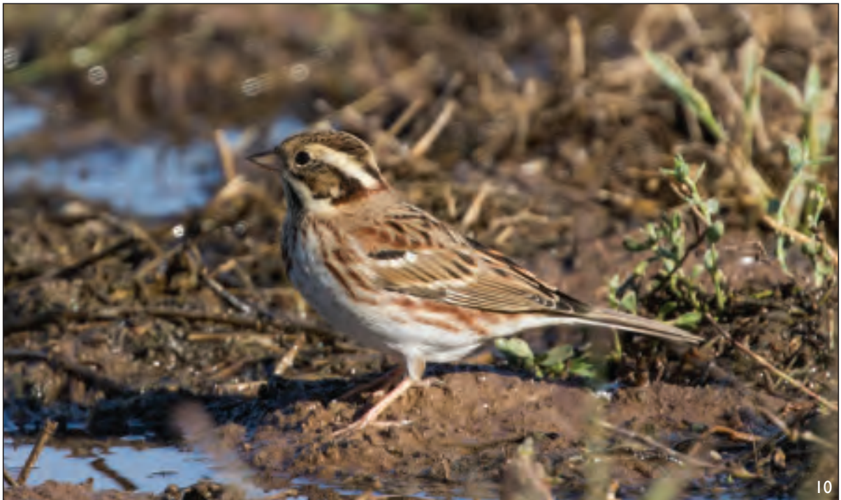
Plate 9. Pine Bunting Emberiza leucocephalos 4 November 2016, Troodos, Cyprus. © Dave Walker