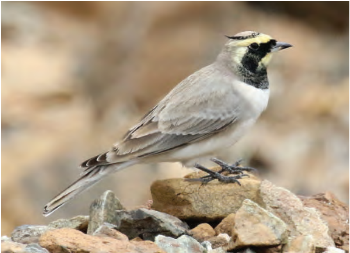
Plate 5. Horned Lark Eremophila alpestris 25 October 2016, Troodos, Cyprus.