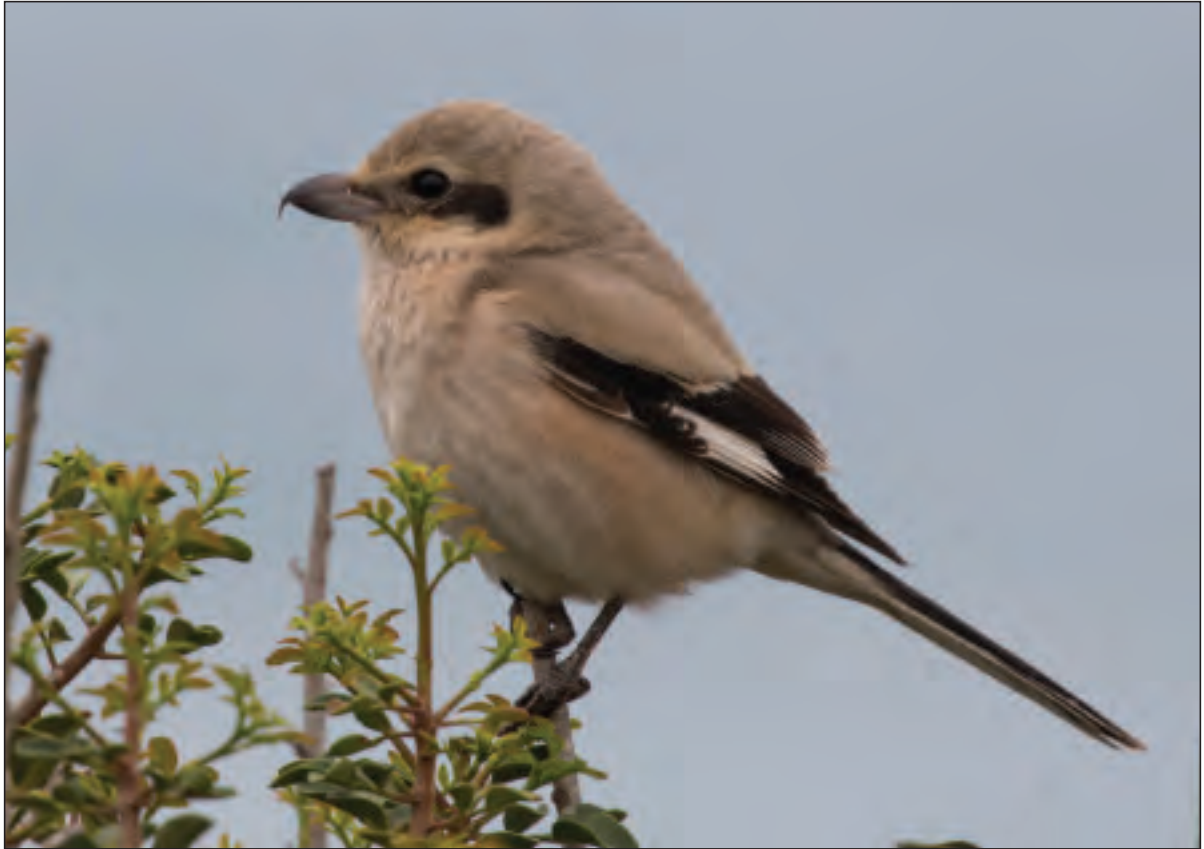
Plate 4. 'Steppe' Grey Shrike Lanius (meridionalis) pallidirostris 29 November 2016, cape Greco, Cyprus.