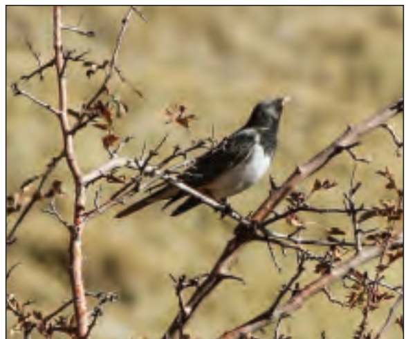
Plate 20. Black-throated Thrush Turdus atrogularis 14 November 2016, Yüksekova, Hakkari, Turkey.

A male Namaqua Dove Oena capensis near Bozova, Şanlıurfa, 26 Oct. One Plum-headed