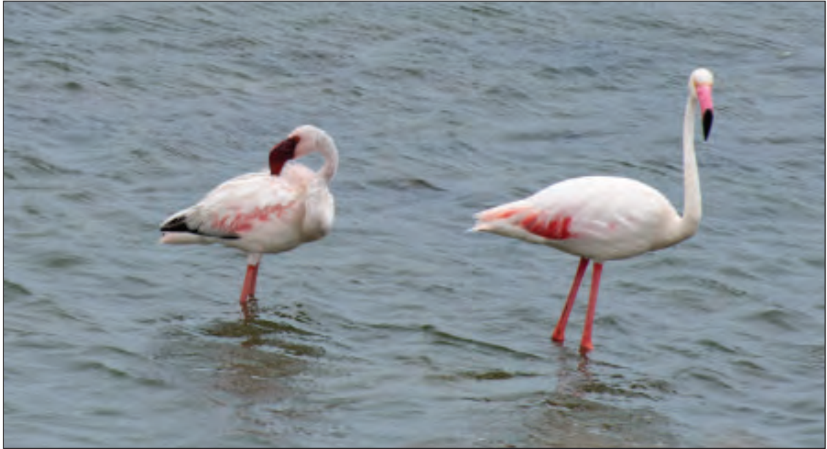
Plate 13. Lesser Flamingo Phoeniconaias minor 26 July 2016 Wadi Baqlat, Dhofar, Oman.

spinosus Raysut STP 22 Nov–29 Dec and three East Khawr 29 Dec. 110 Sociable Lapwings V. gregarius Sahanawt farm 26 Dec. Seven Pheasant-tailed Jacanas Hydrophasianus chirurgus Khawr Taqah 21 Nov, two East Khawr 23 Nov and 26 Dec, one A'Shuweimiyah 24 Dec (third record for this location) and one Raysut lagoons 29 Dec. Two Great Knots Calidris tenuirostris Khawr Dhurf 5 Dec were away from their usual wintering area (Barr Al Hikman). Long-toed Stints C. subminuta Hilf, Masirah island, 11–13 Sep, Shisr 24 Sep, East Khawr 18 Nov–29 Dec, Montasar 19 Nov. One Small Pratincole Glareola lactea Khawr Taqah 6 Dec. Brown Noddy Anous stolidus (singles): 12 and 14 Sep Masirah island and two off Fazayah 9 Dec. A White-eyed Gull Ichthyophaga leucophthalmus Mirbat 14 Nov. One Common Gull Larus c. canus Ras Madrakah 24 Dec and 100 Caspian Terns Hydroprogne caspia A'Duqm 23 Dec.