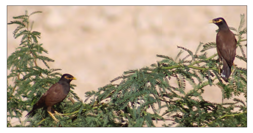
Plate I. Common Mynas Acridotheres tristis, near Kafrein, Jordan valley, Jordan, 30 July 2014.

station building surrounded by planted trees and shrubs was also frequented by the birds. On 3 September 2014 the site was visited again and three mynas were recorded in the early morning flying towards the west. It appeared that the birds were heading to the Kafrein dam or adjacent farmland 2–3 km away, presumably for drinking and feeding. Queen Alia international airport (sixth record)—two Common Mynas were on the ground at the edge of the road near the entrance of Queen Alia airport 31 August 2014. A pair of Common Mynas was reported twice from this site by two birdwatchers, June and July 2014.