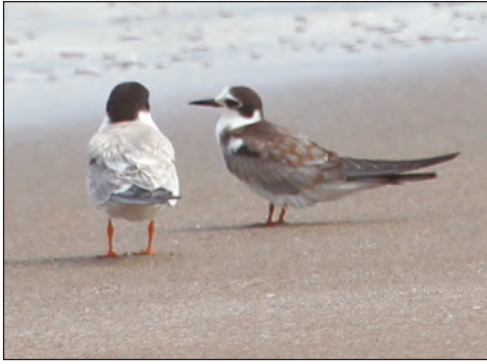
Plate 10. Black Tern Chlidonias niger 12 September 2014, Fujairah port beach, UAE.

Lesser Noddy Anous tenuirostris . One during pelagic trip off Khor Kalba 19 July 2014 (M Smiles et al ). Eighth record.