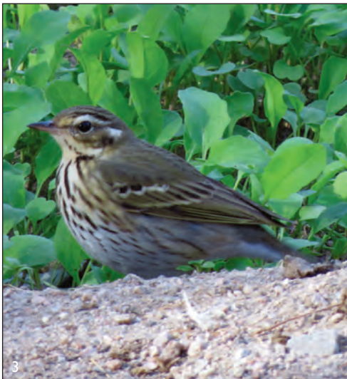
Plate 3. Olive-backed Pipit Anthus hodgsoni 17 December 2013, Aqaba palm beach, Jordan.