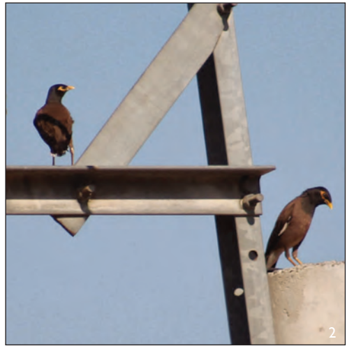
Plate 2. Common Mynas Acridotheres tristis 30 July 2014, northeast of Kafrein, Jordan valley, Jordan.