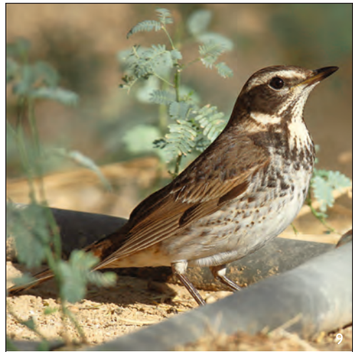
Plate 9. Dusky Thrush Turdus eunomus 1 March 2014, Qatbit, Oman.

Cinereous Vulture Aegypius monachus . One Tawi Atayr 25 November 2014 (D Forsman). Fourth record.