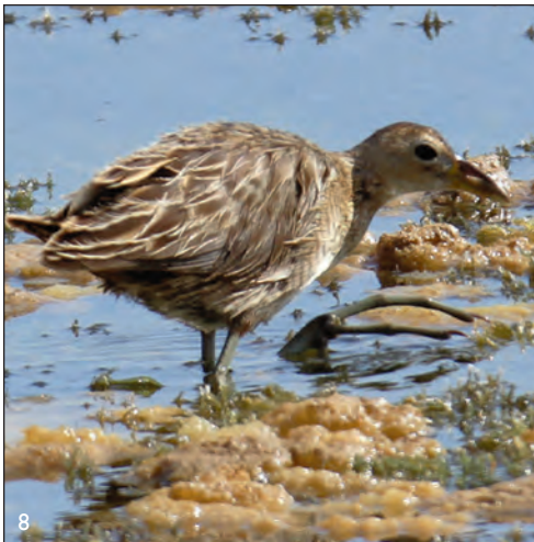
Plate 8. Watercock Gallicrex cinerea 24 February 2014, Al Mughsayl, Oman.