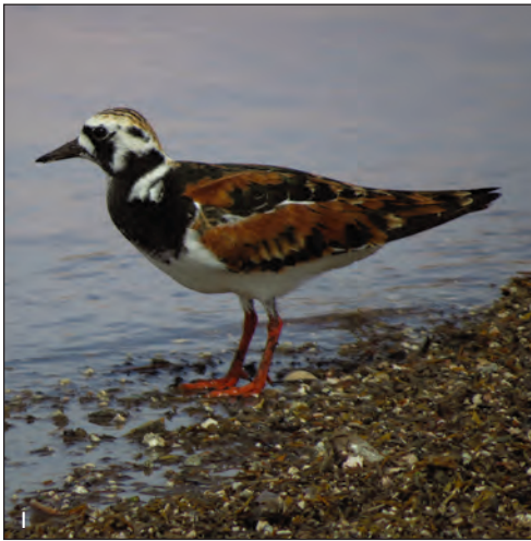
Plate 1. Ruddy Turnstone Arenaria interpres 10 April 2014, Aqaba bird observatory, Jordan.