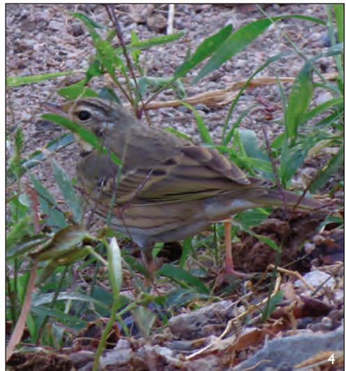
Plate 4. Olive-backed Pipit Anthus hodgsoni 17 December 2013, Aqaba palm beach, Jordan.