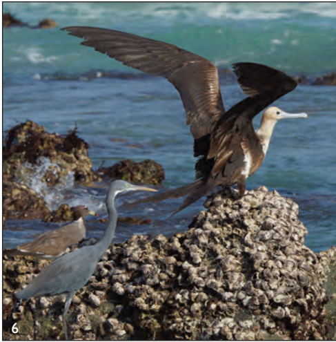
Plate 6. Lesser Frigatebird Fregata ariel 3 November 2014, Hiql, Masirah island, Oman.