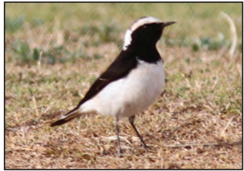
Plate 2. Pied Wheatear Oenanthe pleschanka 27 March 2018, golf course west of Makadi Bay, Egypt.

Pied Wheatear Oenanthe pleschanka . A first-winter male Shams Alam, Marsa Alam, 27 January 2012 (C Farinelle); a male Shams Alam, Wadi Gemal, 8 March 2015 (A Bujanowicz, A Jonczyk, J Nalepa); a