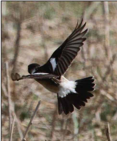
Plate 13. 'Byzantine Stonechat' Saxicola maurus variegatus 16 March 2018, Sila, United Arab Emirates.

2018 (O Campbell, Plate 11); two Al Mamzar park 9 October 2018 (M Smiles).