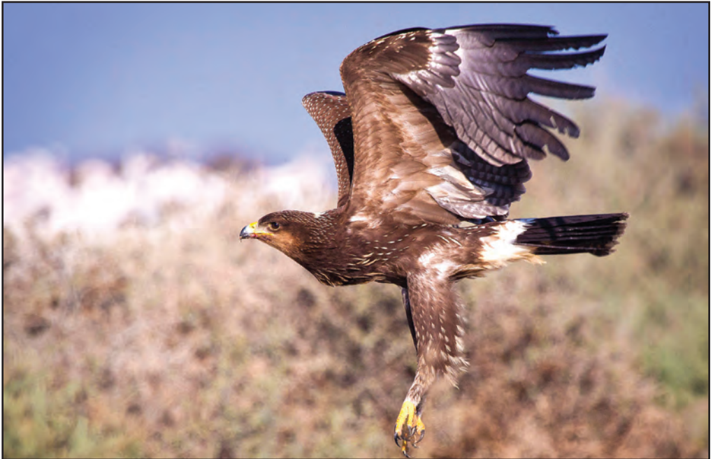
Plate 9. Lesser Spotted Eagle Clanga pomarina 11 November 2013, Siniyah Island, United Arab Emirates.

Lesser Spotted Eagle Clanga pomarina . One Siniyah Island, 11 November 2013 (R Gubiani, Plates 8, 9). Fifth record.