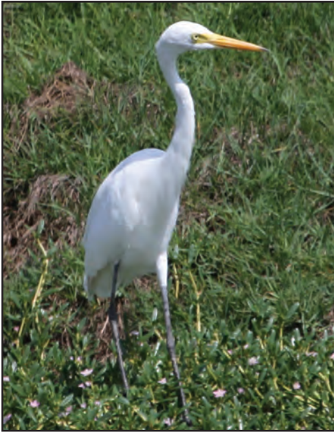
Plate 7. Intermediate Egret Ardea intermedia 26 October 2018, Al Badia Golf Club, United Arab Emirates.