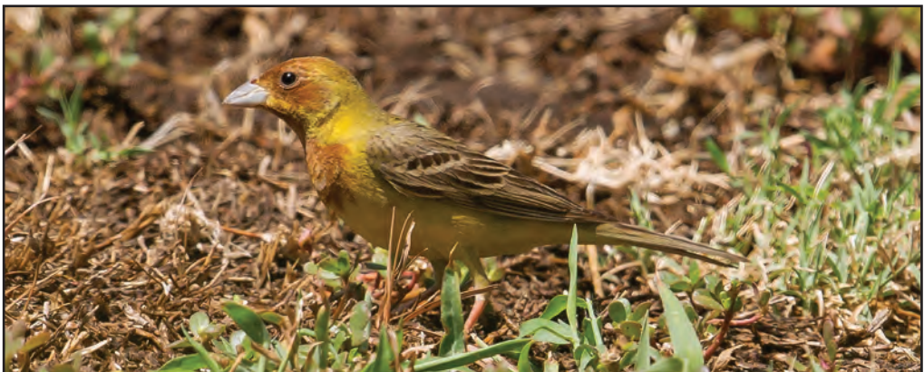
Plate 3. Red-headed Bunting Emberiza bruniceps 7 May 2016, Shams Alam, Marsa Alam, Egypt.

Red-headed Bunting Emberiza bruniceps . A male Shams Alam, Marsa Alam, 7 May