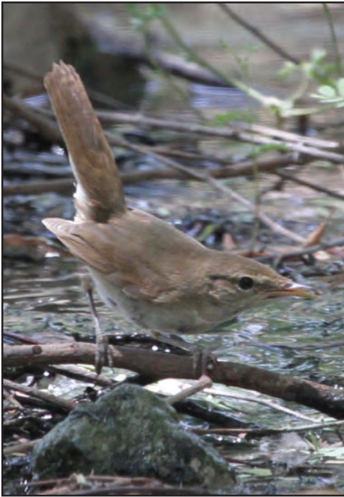
Plate 12. Blyth's Reed Warbler Acrocephalus dumetorum 20 August 2018, Mushrif Palace Gardens, United Arab Emirates.