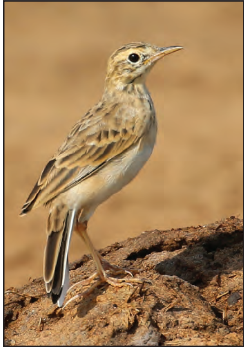
Plate 14. Paddyfield Pipit Anthus rufulus 24 November 2017, Hamraniyah Farm, United Arab Emirates.