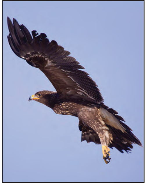
Plate 8. Lesser Spotted Eagle Clanga pomarina 11 November 2013, Siniyah Island, United Arab Emirates. © R Gubiani