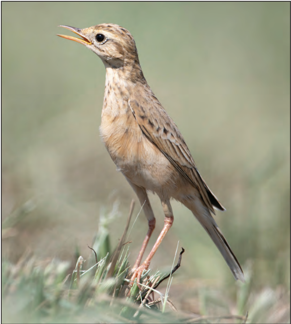
Plate 15. Paddyfield Pipit Anthus rufulus 12 October 2018, Wamm Farms, United Arab Emirates.

S Lloyd et al , Plate 15). First and second records.