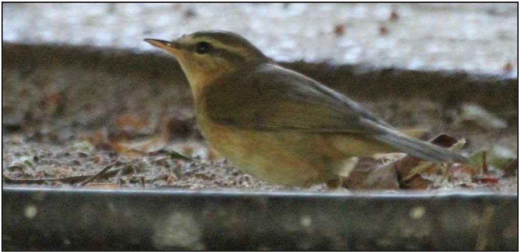
Plate 10. Dusky Warbler Phylloscopus fuscatus 20 October 2018, Mamzar Park, United Arab Emirates.