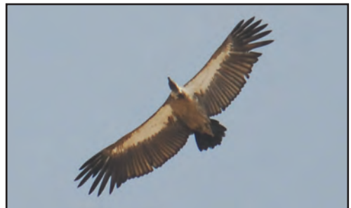
Plate 1. African White-backed Vulture Gyps africanus 25 March 2017, Shalatein, Hala'ib triangle, Egypt.

Pectoral Sandpiper Calidris melanotos . One Makadi Bay golf course, Hurghada, 27 March 2018 (O Jönsson). Third record.