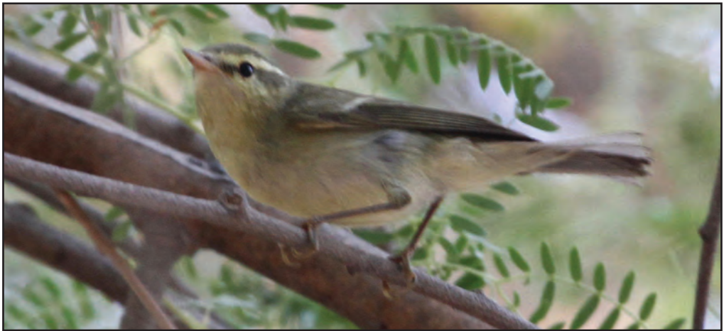
Plate 11. Green Warbler Phylloscopus nitidus 7 September 2018, Mushrif Palace Gardens, United Arab Emirates.

February 2019 (S Majeed). Seventh record, last recorded 2006.