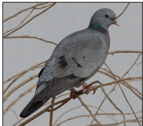
Plate 4. Western Stock Dove Columba oenas oenas 30 January 2019, Al Abra, Kuwait. © Omar Al Shaheen

'Arabian Grey Shrike' Lanius (excubitor) aucheri . One Salmi, 3 March 2018 (A Habeeb) (fourth record); two Sabah Al Ahmad Natural Reserve (with a nest with 4 eggs), 26 February 2019 (K Al Fahad) (seventh record); one Al Liyah north, 24 April 2019 (A Al-Sirhan) (eighth record). There are now eight records of this subspecies (see previous issues of Sandgrouse for details).