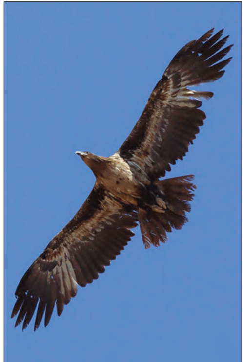
Plate 11. Pallas's Fish Eagle Haliaeetus leucoryphus 19 February 2016 Raysut, Oman.