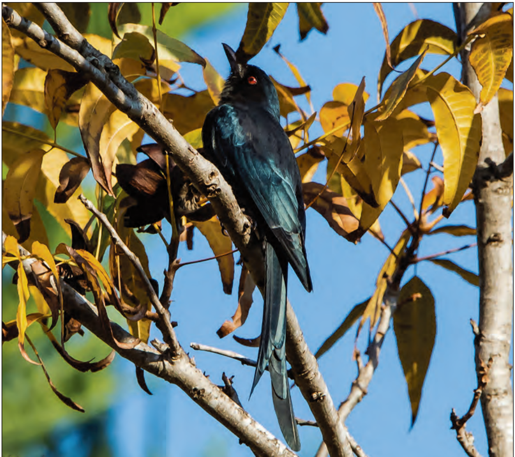
Plate 6. Ashy Drongo Edolius leucophaeus 15 December 2014 Gan Shmuel, north coastal plains, Israel.

Basra Reed Warbler Acrocephalus griseldis . One first winter ringed Agamon Hula 18 August 2015 (Y Charka). This species is again on the rarity list.