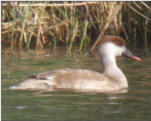
Plate 13. Red-crested Pochard Netta rufina 28 November 2015, Al Wathba wetland reserve, United Arab Emirates.

Red-crested Pochard Netta rufina . One female Al Wathba wetland reserve 28 November–21 December 2015 (OJ Campbell, S Bashir Khan et al , Plate 13). 17th record.