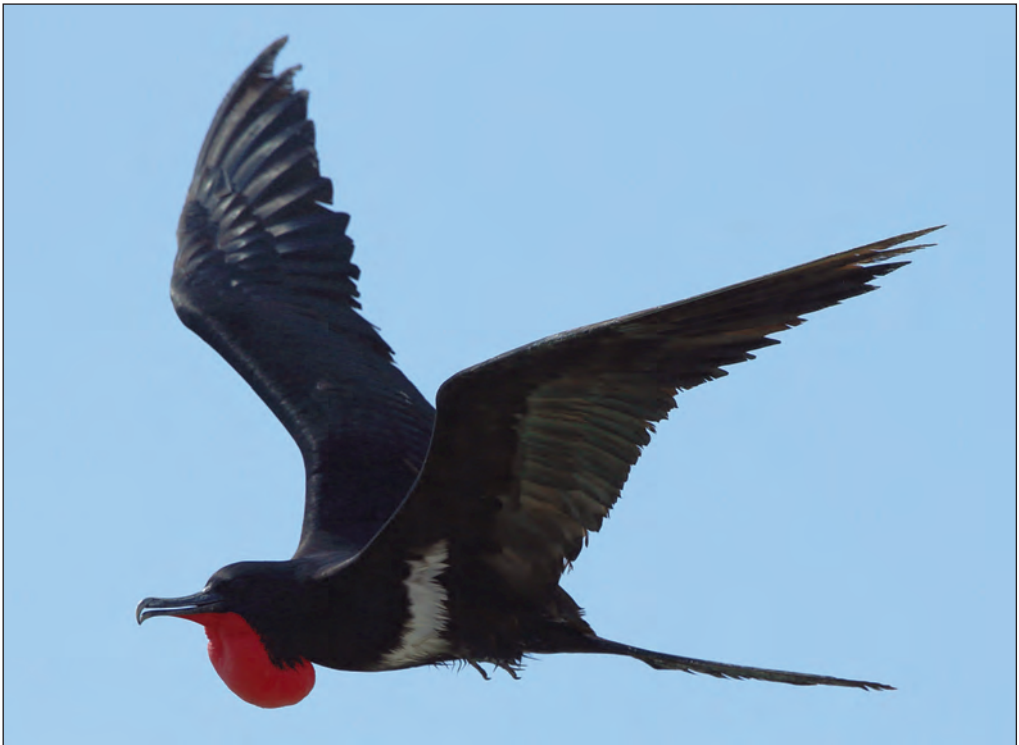
Plate 8. Lesser Frigatebird Fregata ariel | March 2016, Haitham, Oman.