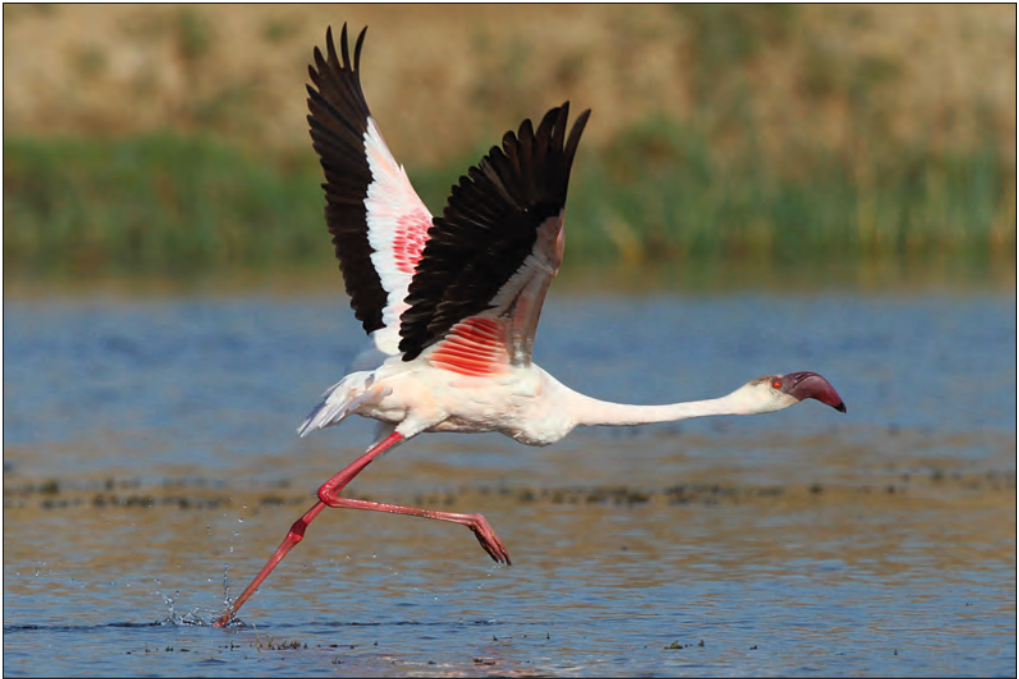
Plate 10. Lesser Flamingo Phoeniconaias minor Khawr Rawri, Oman, 12 January 2016.