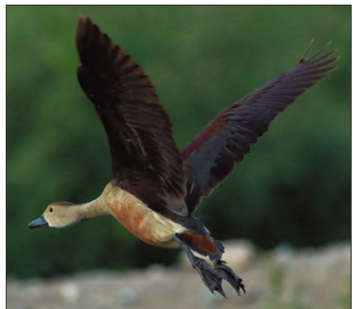
Plate 7. Lesser Whistling Duck Dendrocygna javanica 2 January 2016 Saham, Oman.

Lesser Whistling Duck Dendrocygna javanica . Up to ten Saham sewage treatment plant