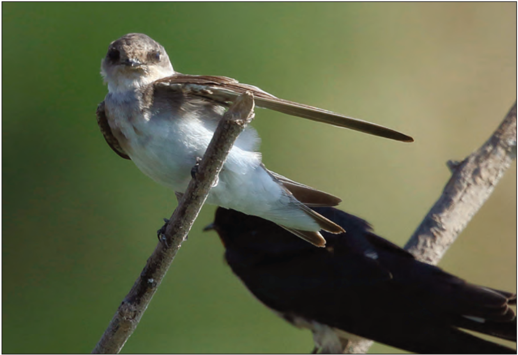
Plate 12. Pale Martin Riparia diluta 11 December 2015 Raysut, Oman.