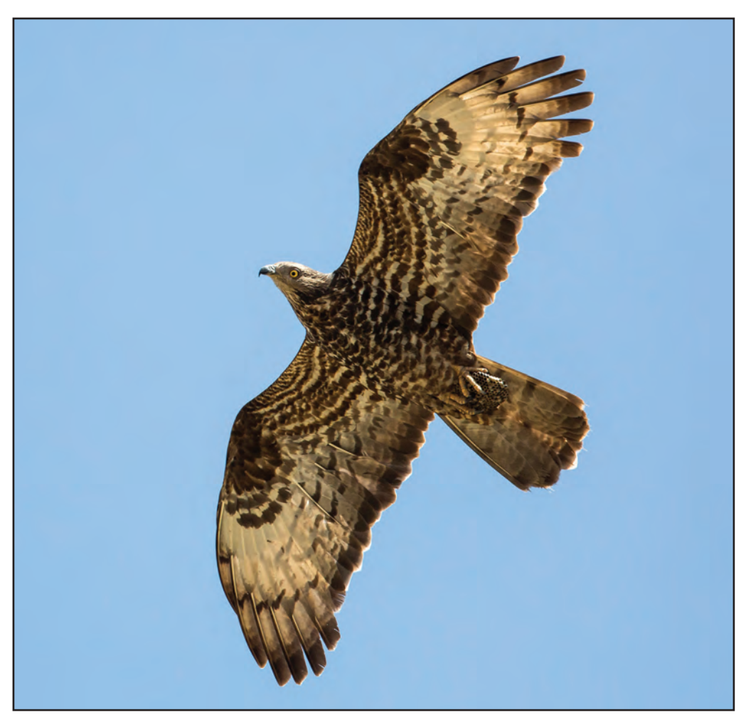
Plate 1. Comb-carrying European Honey Buzzard Pernis apivorus in Lebanon.

I recently received two excellent photos (Plates 1, 2) from Dr Antoine Faissal (tonyfaissal@ hotmail.com), of a European Honey Buzzard Pernis apivorus in flight in Lebanon. The second photo was a crop of the underside of the bird from the first photo showing that it was carrying a comb in its talons. Antoine sent me the following details of the observation: "On Tuesday September 5, 2017 I had an interview on a local radio station about bird migration over Lebanon, and I went with my wife after that to my favorite spot at 1713 m in Ehden village, north Lebanon. We arrived at the parking and the sky was already full of European Honey Buzzards. We hiked uphill to reach our spot, and for more than 2.30 h the sky was full of these buzzards. Thousands and thousands crossed over our head that day. I took many photos but didn't see the wasp nest until editing the photos. What a surprise."