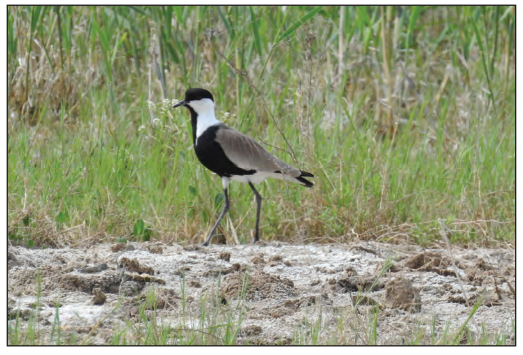
Plate 2. Spur-winged Lapwing Vanellus spinosus in Armash wetlands, Armenia, 6 May 2018.