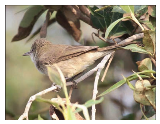
Plate 7. (left) Clamorous Reed Warbler Acrocephalus stentoreus brunnescens, Al Jar, Yemen, January 2011. This image shows especially the white chin and throat and warm brown flanks becoming tawny on lower flanks; also short first primary.