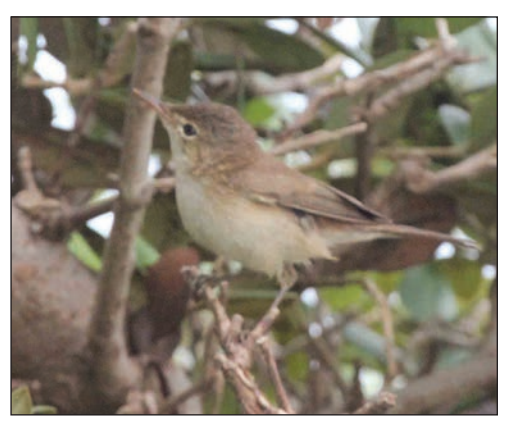
Plate 15. Mangrove Reed Warbler Acrocephalus (scirpaceus) avicenniae, Al Jar, Yemen, January 2011. This image shows the short primary projection.

The Mangrove Reed Warbler was first described by Ash et al (1989), originally as a subspecies of African Reed Warbler A. baeticatus . It is endemic to the Red sea and gulf of Aden region. On the African side it occurs from the coast of southern Sudan south to Eritrea and northern Somalia; in Arabia it is found on the Saudi Arabian coast south from Yanbu, and in Yemen in most mangroves of the Red sea coast and islands, though breeding has not been confirmed (Jennings 2010).