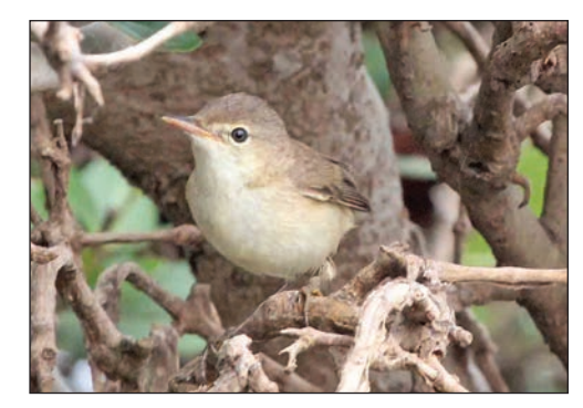
Plate 13. (left) Mangrove Reed Warbler Acrocephalus (scirpaceus) avicenniae, Al Jar, Yemen, January 2011. Note in this and Plates 14 & 15 the 'clean' appearance with posture similar to Blyth's Reed Warbler Acrocephalus dumetorum and kindly face.