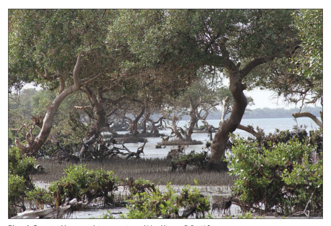
Plate I. Extensive Mangroves Avicenna marina at Al Jar, Yemen.

On 23 January we noticed one of the Clamorous Reed Warblers collecting nesting material and taking it to a low remnant mangrove clump on the shore. A half completed nest was found (Plate 2) but a month later, on 24 February, DS found the nest had been