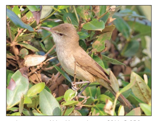
Plate 5. (left) Clamorous Reed Warbler Acrocephalus stentoreus brunnescens, Al Jar, Yemen, January 2011. © RF Porter Plate 6. (right) Clamorous Reed Warbler Acrocephalus stentoreus brunnescens, Al Jar, Yemen, January 2011. Note olive-brown upperparts, whitish supercilium, dark lores, inconspicuous whitish eye-ring, white chin and throat, warm brown flanks, short primary projection and short first primary.© RF Porter