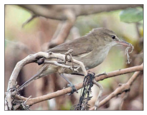
Plate 11. (left) Clamorous Reed Warbler Acrocephalus stentoreus brunnescens, Al Jar, Yemen, January 2011. This image shows the broad base to the bill and streaking on throat.