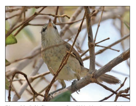
Plate 10. (right) Clamorous Reed Warbler Acrocephalus stentoreus brunnescens, Al Jar, Yemen, January 2011. Note the whitish supercilium, becoming obscure behind the eye, dark lores, inconspicuous whitish eye-ring and some dark streaks on throat.