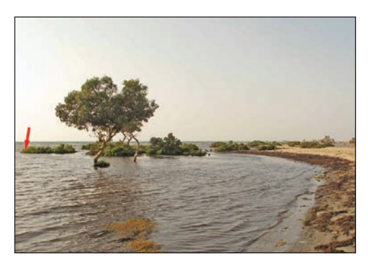
Plate 3. (left) Red arrow indicates position of Clamorous Reed Warbler Acrocephalus stentoreus brunnescens nest (Plate 2), low tide, Al Jar mangroves, Yemen, January 2011.